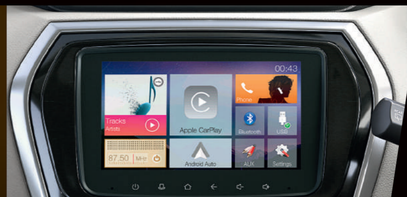
7" Touchscreen with Advanced Infotainment System

Enjoy your favourite music. Navigate your way. And stay connected on the go with the Android Auto and Apple Car Play on the Advanced Infotainment System with 7" capacitive touchscreen.