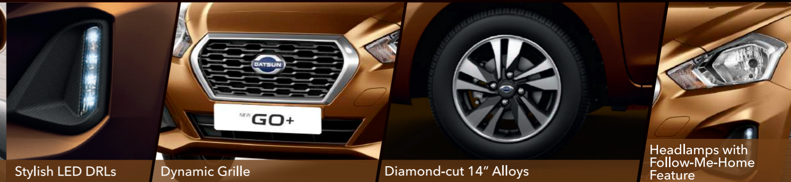
Stylish LED DRLs

Turn heads on the road with a dazzling range of new generation features.