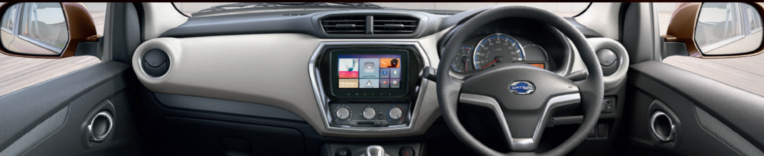
Dual Tone Premium Interiors.

We know what you need in your car. And have designed accordingly.