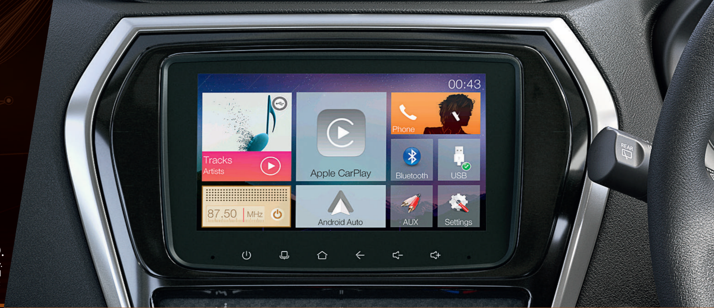
7" Touchscreen with Advance Infotainment System

Come, change the way you drive with the all new Datsun GO. Designed with Japanese Engineering, it is loaded with never before features and first in the segment technology. It is what you have been waiting for, for so long.