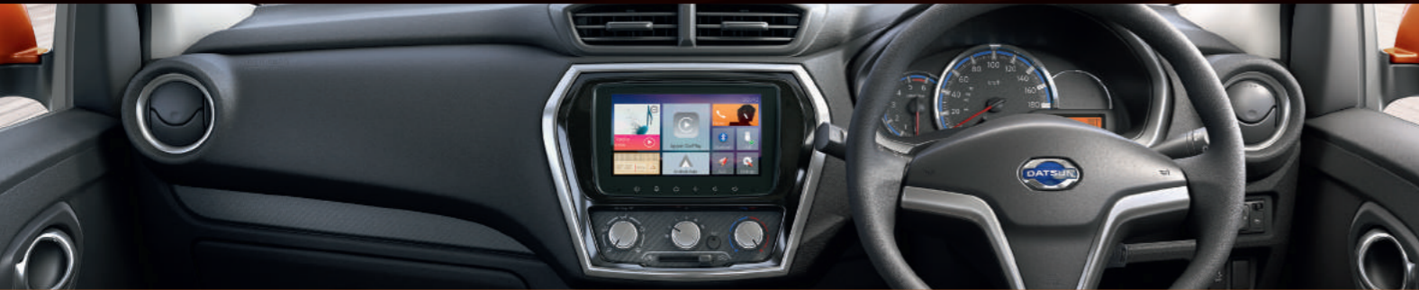
All Black Premium Interiors

We know what you need in your car. And have designed accordingly.