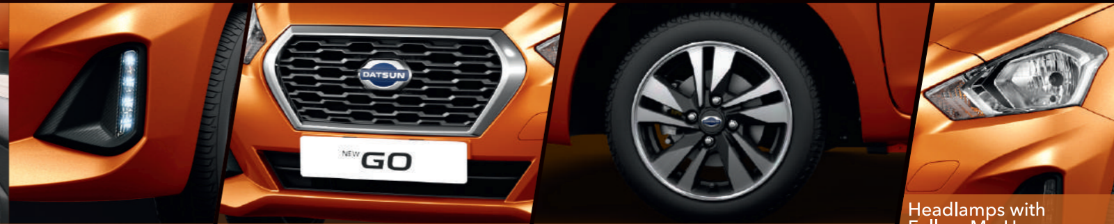
Stylish LED DRLs

Turn heads on the road with a dazzling range of new generation features.