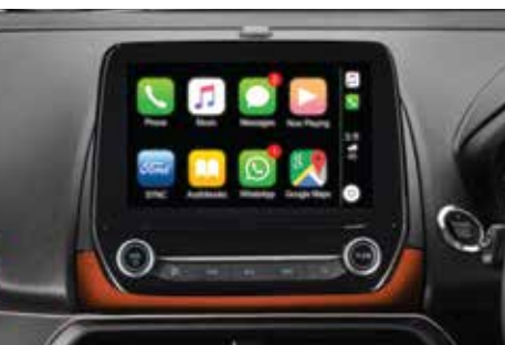
SYNC® 3 with 20.32cm (8.0) Touchscreen

With its breakthrough technology offerings, the Ford EcoSport seeks to change the game. The state-of-the-art tech is visible in all the facets of the car.