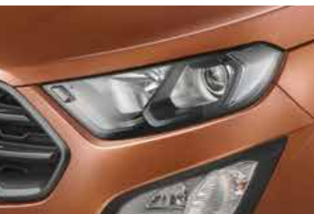
Bold HID Headlamps

With a bold exterior design, the Ford EcoSport always looks like it's ready for action. And yes, it knows how to turn heads!