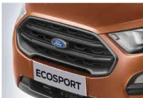
Stunning Grille Design