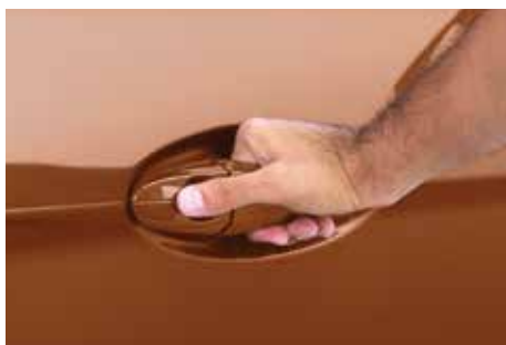
Push Start/Stop and Smart Entry with Capacitive Sensor