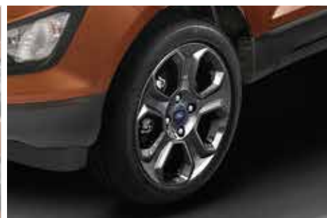
R16(205/60 R16) Sporty Alloy Wheels