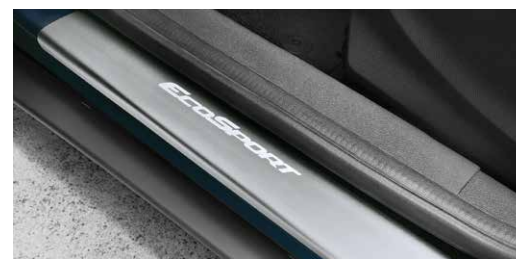
SS Scuff Plates