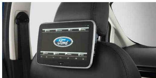
Rear Seat Entertainment System