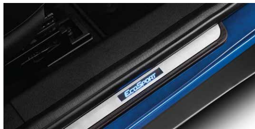
Illuminated Scuff Plates