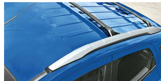
Roof Cross Bars