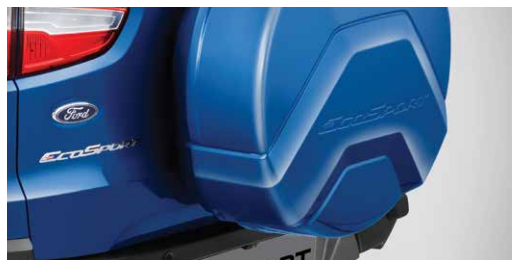
Spare Wheel Cover