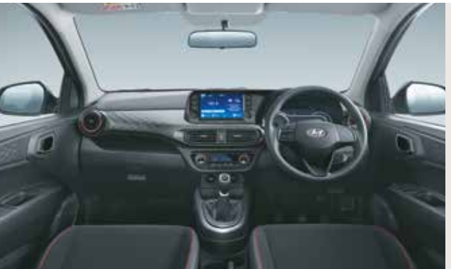
Black interiors with red inserts available in: