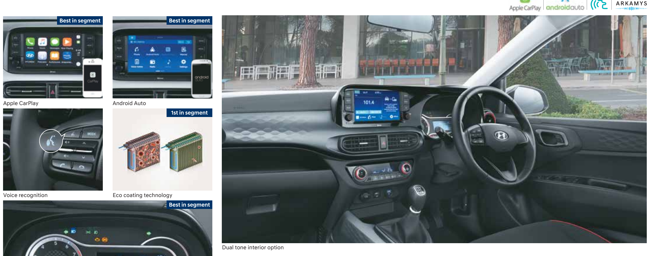
13.46 cm (5.3") digital speedometer

Grand i10 Nios gets its smart technology from the Hyundai stable; like the best-in-segment 20.25 cm (8") touchscreen infotainment system with smartphone connectivity. Advanced technology is always working behind the scene to make every drive a convenient yet richly immersive experience.