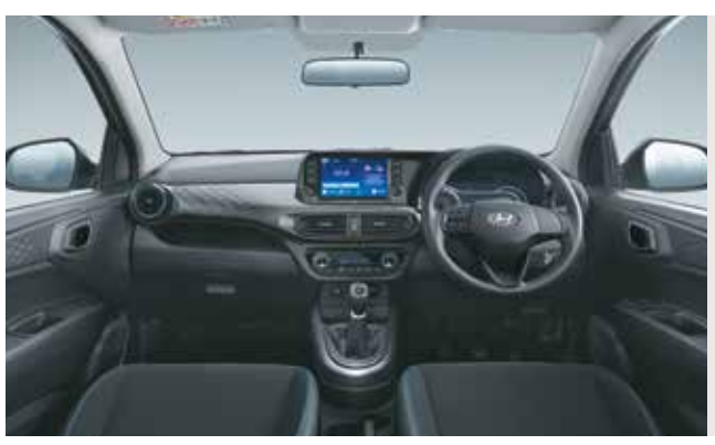
Black interiors with aqua teal inserts available in: