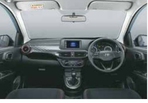
All black interiors with red colour inserts