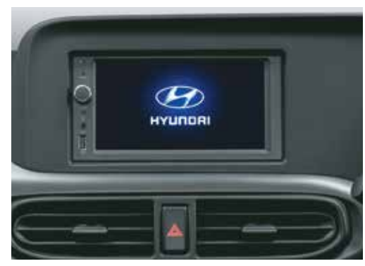
17.14 cm Touchscreen infotainment