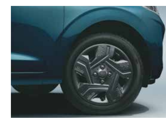
175/60 R15 (D=380.2 mm) Gun metal styled wheel

Step into the world of high-powered executives with the bold Grand i10 Nios corporate edition. A seamless blend of cutting-edge technology and new age style makes it the perfect statement for the young professional. Subtle details accentuate the corporate edition, like all-black interiors with red inserts, elegant chrome garnish and a 17.14cm touchscreen infotainment system, ensuring that you'll have a truly extraordinary driving experience.