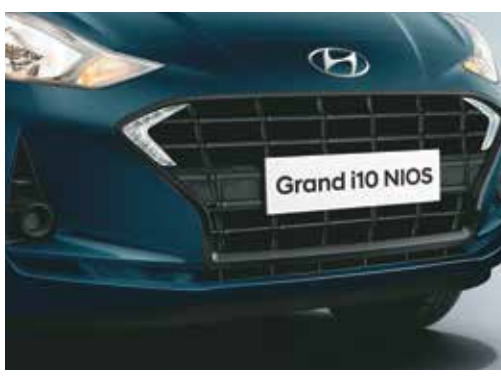
Glossy black radiator grille