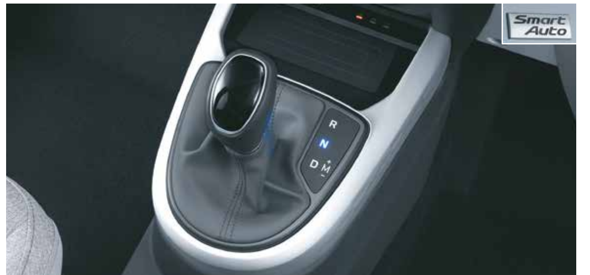
AMT in 1.2 petrol