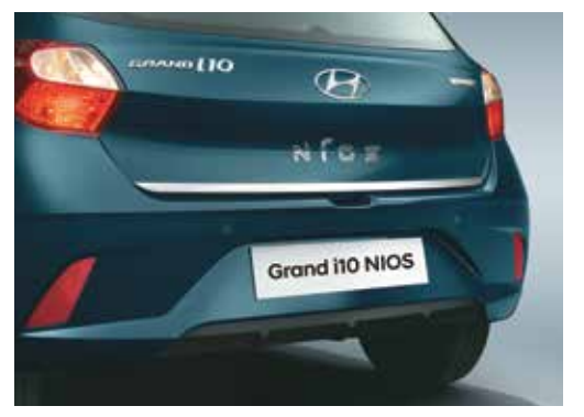
Rear chrome garnish