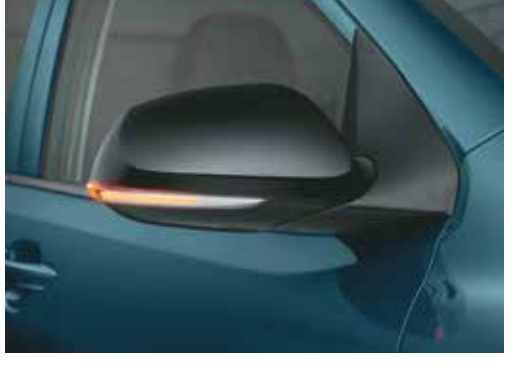
Electric folding outside mirror with turn indicator