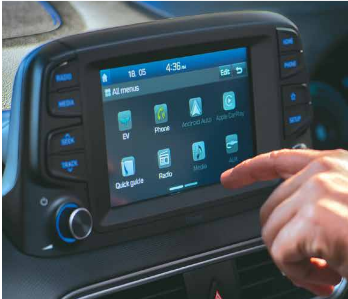
17.77cm Touchscreen Display Audio with Android Auto and Apple CarPlay screen

Get ready for a hassle-free life with KONA Electric that has been created to fit in your world seamlessly. Now you can access your phone, your favourite music and maps, using the multimedia touchscreen display that comes with Apple CarPlay and Android Auto compatibility. To ensure your phone never runs out of battery, there is a wireless charging pad.