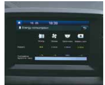
Power Consumption Information