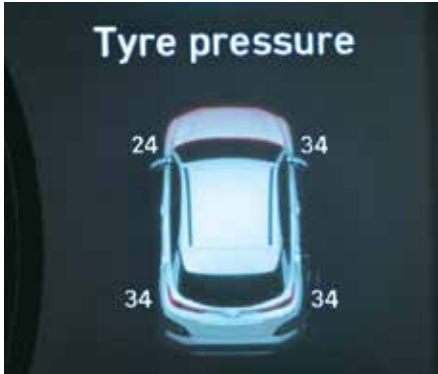
Tyre Pressure Monitoring System (High Line)