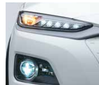
Distinctive split type LED Headlamps with LED DRLs

Roof Rails | Body Color ORVM with Turn Indicators | Body Colour Door Handles Dual Tone Roof (option) | Smart Electric Sunroof with Safety | Side Sill Molding – Black