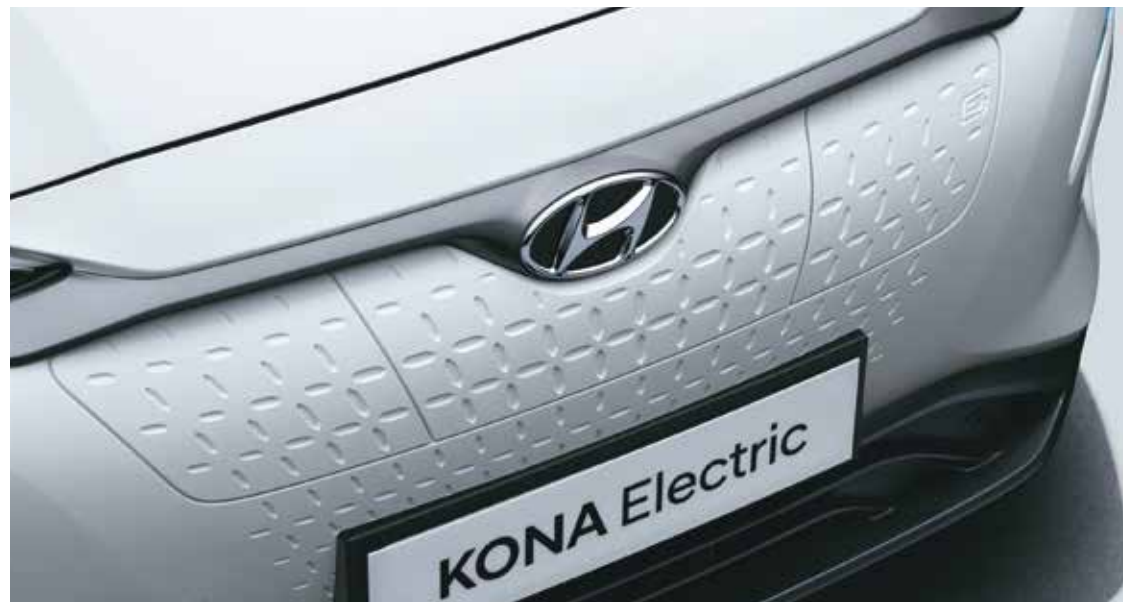
Modern, Clean & Integrated Front Grille Design optimized for Superior Aerodynamics