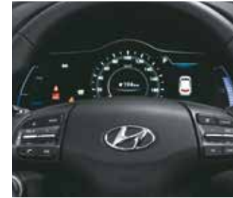
Digital Instrument Cluster with Supervision