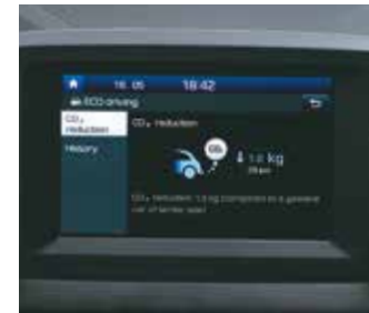
ECO Driving Information