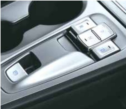
Shift-by-wire Automatic Transmission and Electric Parking Brake