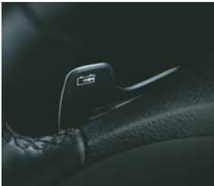
One Pedal Driving