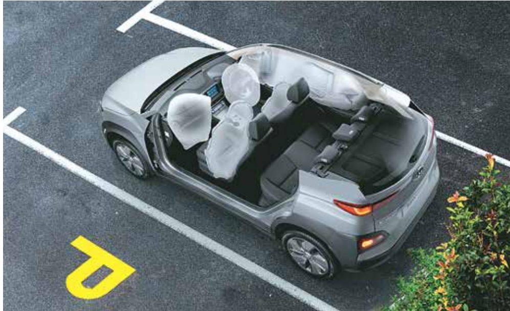
6 Airbags (Driver, Passenger, Front Side & Curtain)

KONA Electric comes with superior safety features to keep you out of harm's way. Made of ultra-high tensile strength steel, KONA Electric offers high impact energy absorption that keeps the passengers safe in the unfortunate event of a collision. The cabin has been especially designed to disperse energy to reduce impact on the occupants.