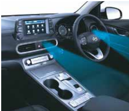
Option of Driver only Air Conditioning