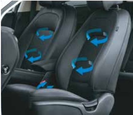
Front Ventilated and Heated Seats