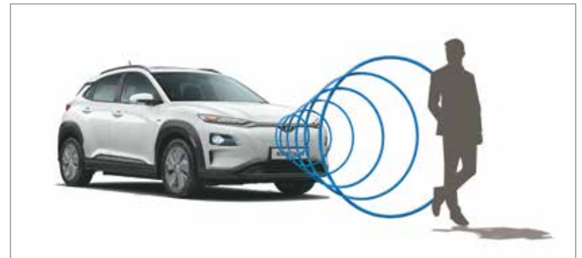
Virtual Engine Sound System

When the vehicle is in motion, VESS generates an engine sound to ensure pedestrian safety