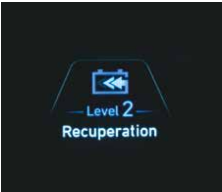
Paddle Shifters (For Regenerative Braking)