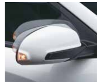
ORVM (Heated) with Electric Adjust and Folding