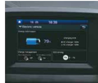
EV Menu Screens