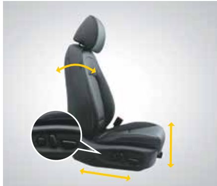
10-way Power Driver Seat with Lumbar Support