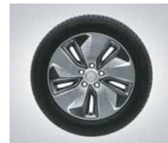
R17 EV Exclusive Alloy Wheels