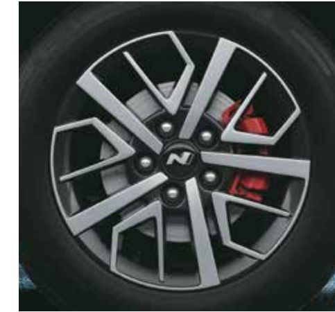
R16 (D=405.6 mm) Diamond cut alloys with N logo