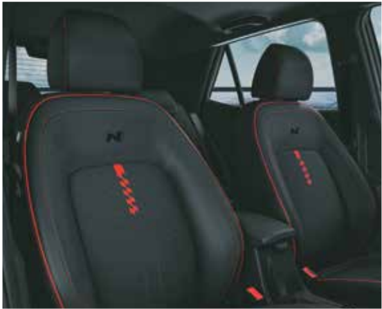
Leather^ seats with N logo