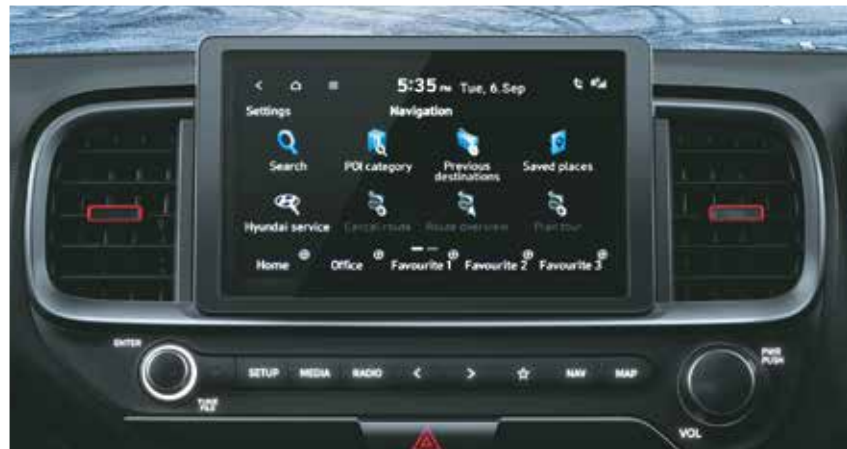
20.32 cm (8 inch) HD infotainment system with Bluelink

Built to bring the world to your fingertips, the Hyundai VENUE N Line is packed with technology to keep you connected through home-to-car with Alexa and Google Voice Assistant, Bluelink and more. The dashcam with dual camera records outside and inside the car with features like driving recording, event recording, vacation recording and parking recording (user defined).