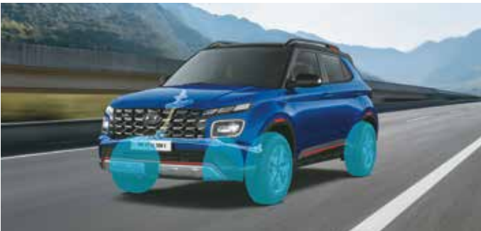
Vehicle stability management (VSM)