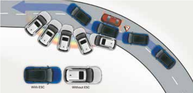
Electronic stability control (ESC)