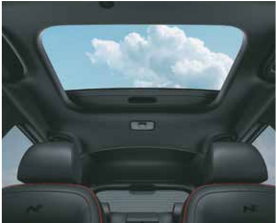
Smart electric sunroof

Step inside the Hyundai VENUE N Line and you'll discover what sets it apart. The sporty black interiors with athletic red inserts, N branding and the exciting red ambient lighting makes it the perfect playtime partner.