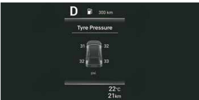
Tyre pressure monitoring system (Highline)

Other features – All 4 disc brakes | ABS with EBD | Brake assist system (BAS) | Headlamp escort function | Impact sensing auto door unlock Speed sensing auto door lock | Rear defogger with timer | ISOFIX