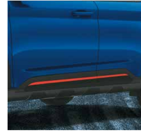
Side sill garnish with athletic red highlights

Other features – Dark chrome front grille | Twin tip muffler with exhaust note | Shark fin antenna