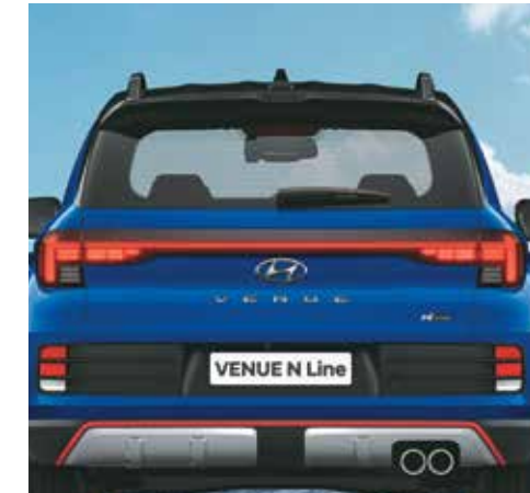
Connecting LED tail lamps