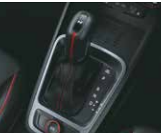
DCT gear knob with N logo