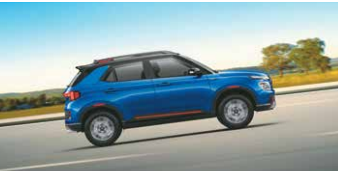
Hill assist control (HAC)