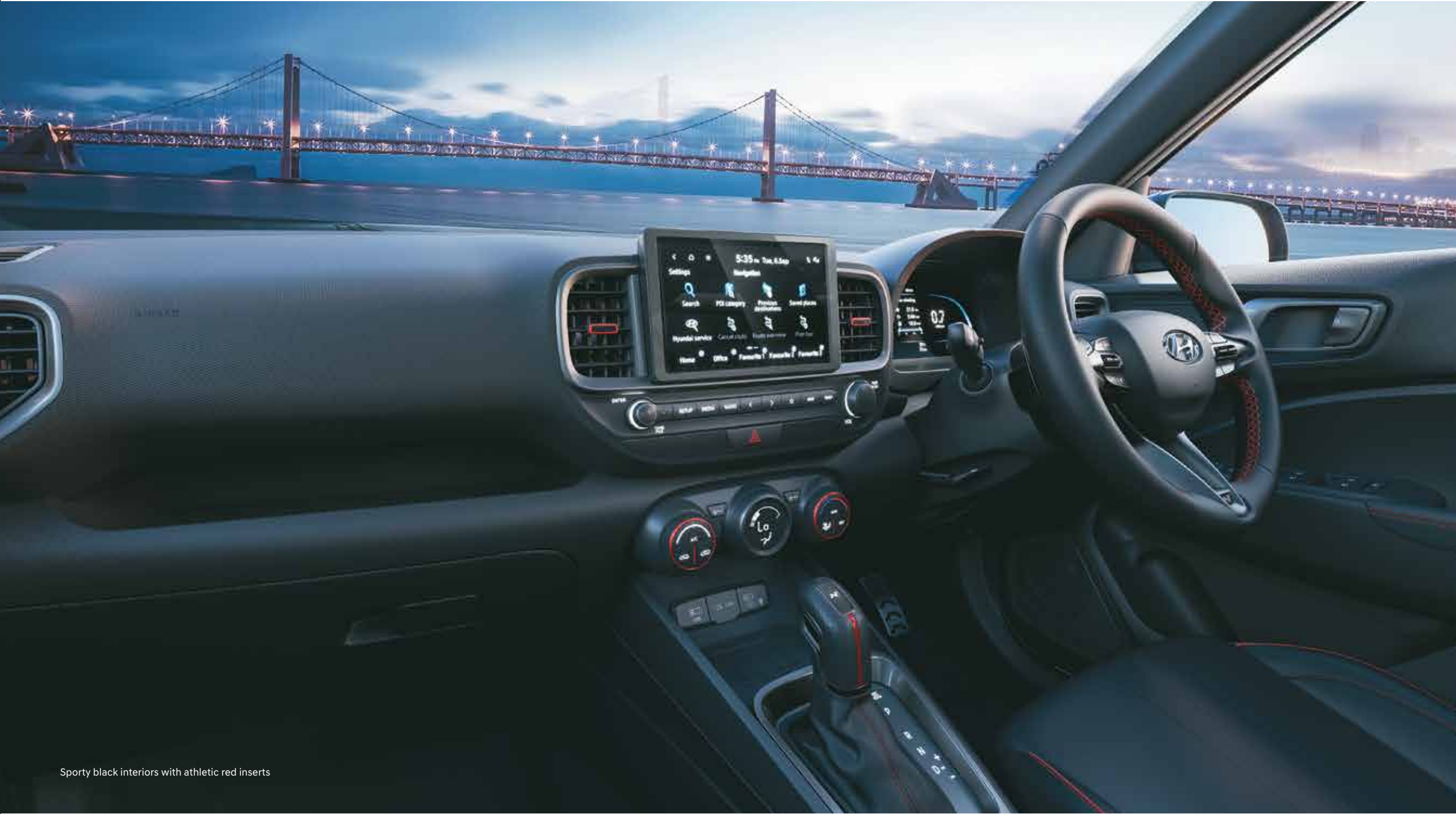
Sporty black interiors with athletic red inserts