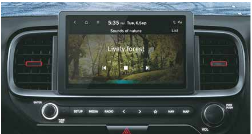
Ambient sounds of nature

Other features – Android Auto & Apple CarPlay | Over-the-air update (Infotainment system & map) | Wireless phone charger Steering wheel with audio & bluetooth controls