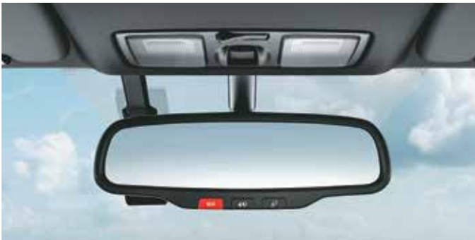
Electrochromic inside rear view mirror