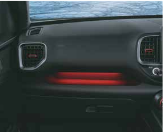
Exciting red ambient lighting