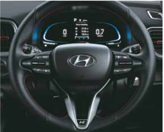
3-spoke leather^ steering wheel with N logo