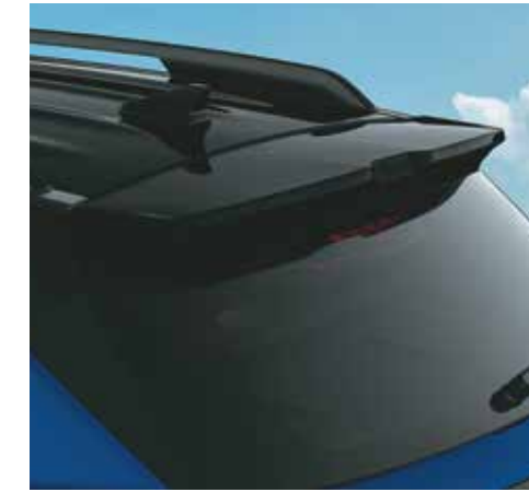
Sporty tailgate spoiler