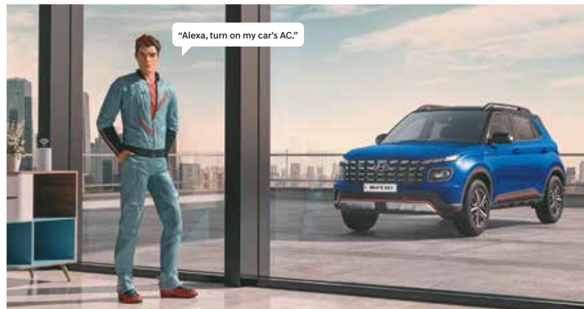
Home to car (H2C) with Alexa & Google Voice Assistant*