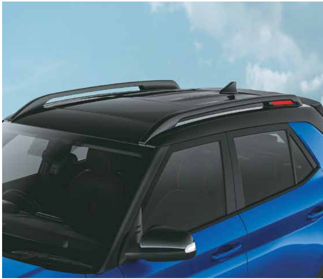
Roof rails with athletic red highlights