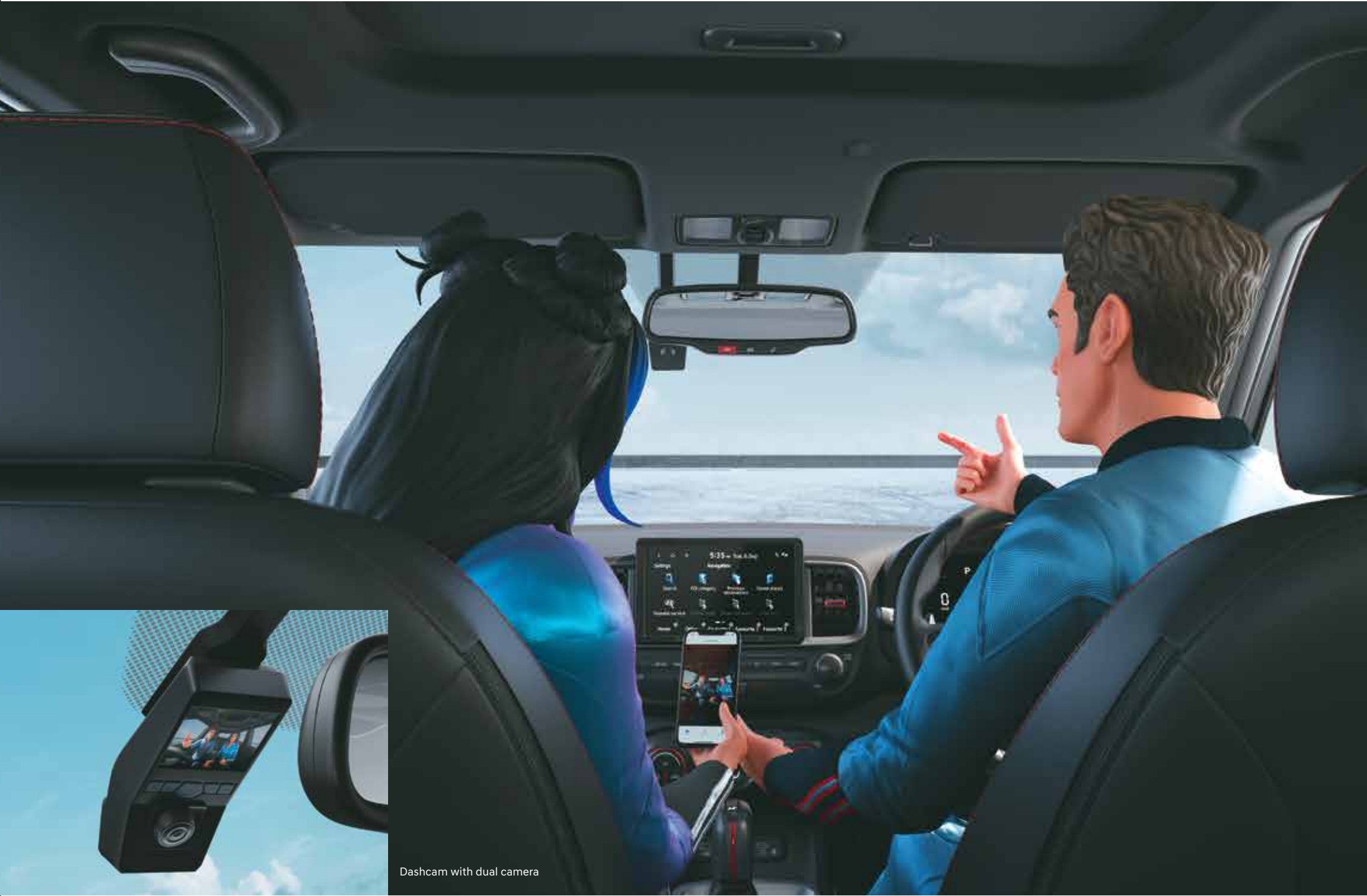
Dashcam with dual camera