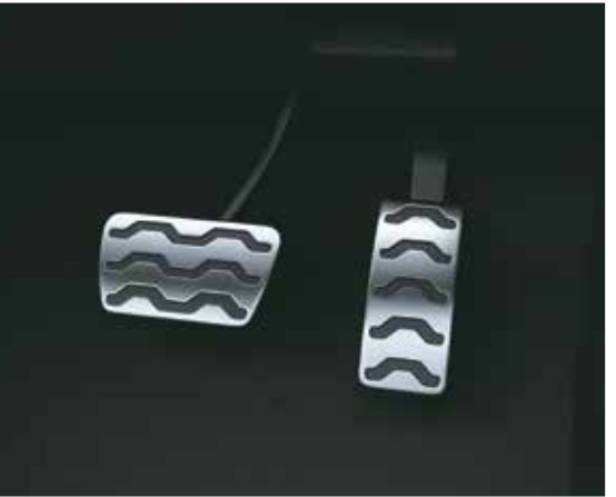
Sporty metal pedals