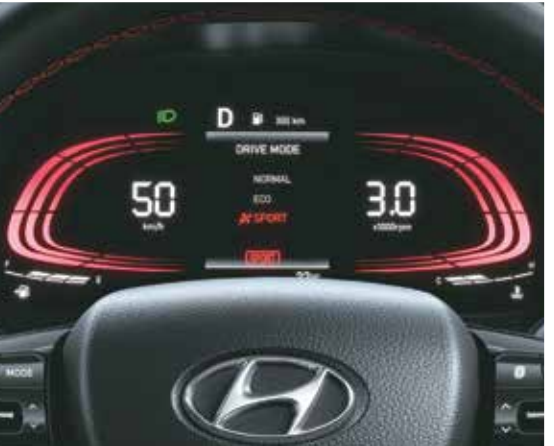
Digital cluster with colour TFT MID

Other features – Dark metal finish inside door handles | Power driver seat – 4 way | Fully automatic temperature control with digital display Glovebox cooling | 60:40 Split rear seat