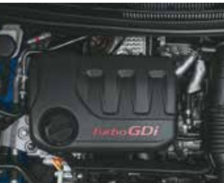
Kappa 1.0 I turbo GDI petrol engine