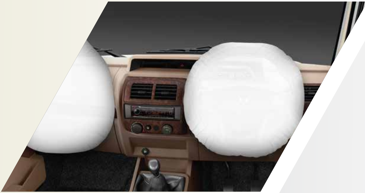
Dual Airbag for additional safety