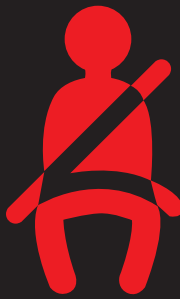
Driver + co-driver seat belt reminder