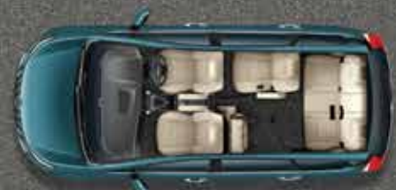
Single Touch Tumble Down in Middle Row Co-Driver Seat (In 7-Seater & 8-Seater)