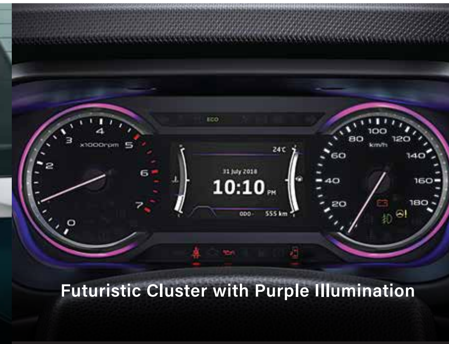
Futuristic Cluster with Purple Illumination