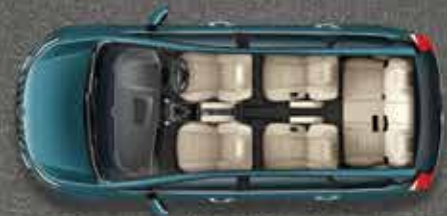
7-Seater with Captain Seats in Middle Row