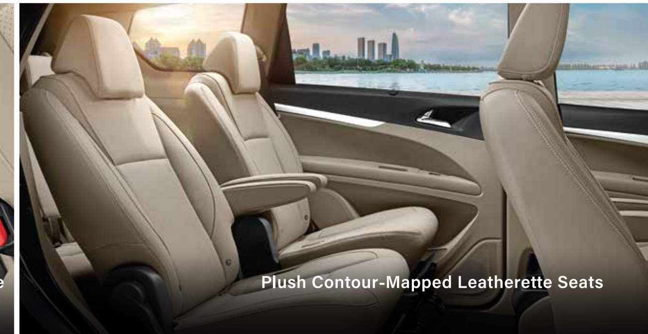
Plush Contour-Mapped Leatherette Seats