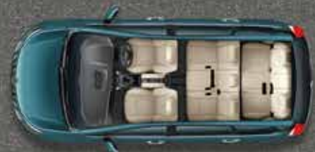
8-Seater with 60:40 Split in Middle Row