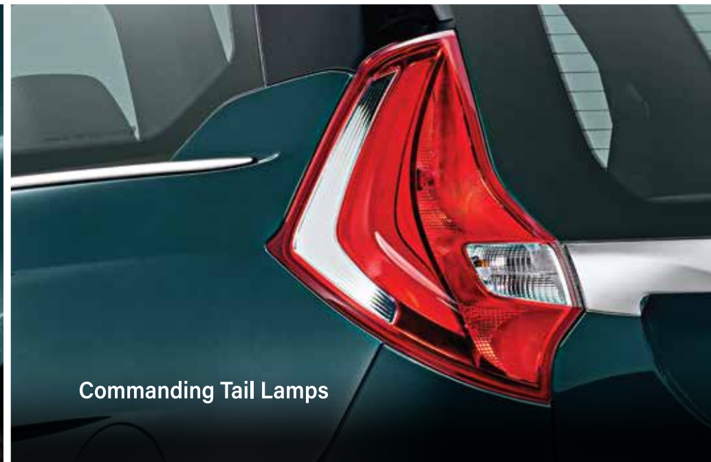
Commanding Tail Lamps