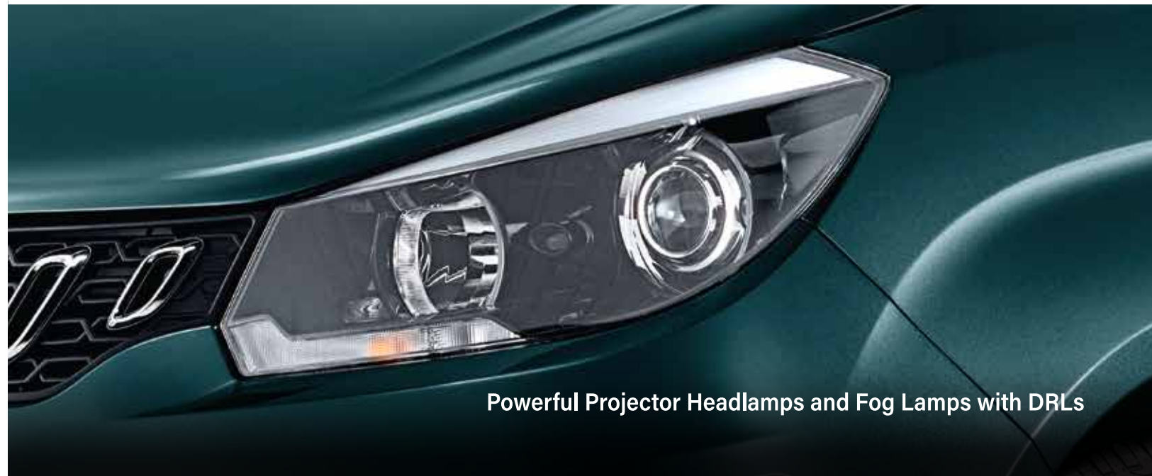
Powerful Projector Headlamps and Fog Lamps with DRLs