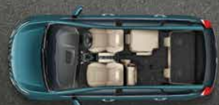
3 rd Row with 60:40 Split and Flat Fold (In 7-Seater & 8-Seater)