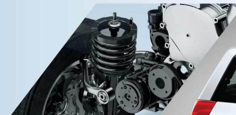
Cushion Suspension Technology with anti-roll bars