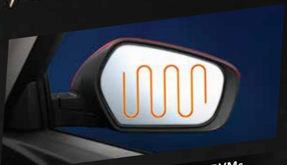
FIRST-IN-SEGMENT HEATED ORVMs