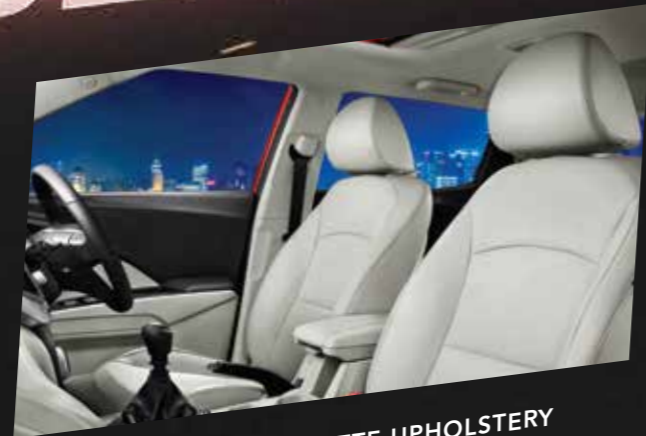
PREMIUM GREY LEATHERETTE UPHOLSTERY