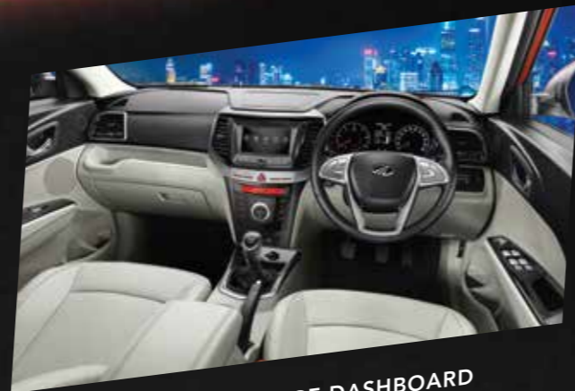
DUAL-TONE BLACK & BEIGE DASHBOARD