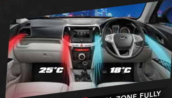
FIRST-IN-SEGMENT DUAL-ZONE FULLY AUTOMATIC TEMPERATURE CONTROL