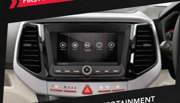
17.78 CM TOUCHSCREEN INFOTAINMENT WITH GPS NAVIGATION, APPLE CARPLAY & ANDROID AUTO™

The XUV300 allows you to adjust the air temperature to create separate, customised environments for the driver and front passenger. With 3 memory slots for your preferred setting, you won't waste time prepping up for your joyride.