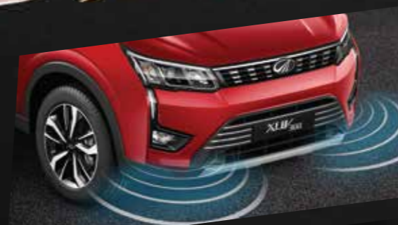
FIRST-IN-SEGMENT FRONT PARKING SENSORS