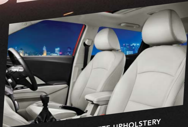
PREMIUM GREY LEATHERETTE UPHOLSTERY