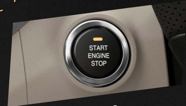
PUSH BUTTON START / STOP