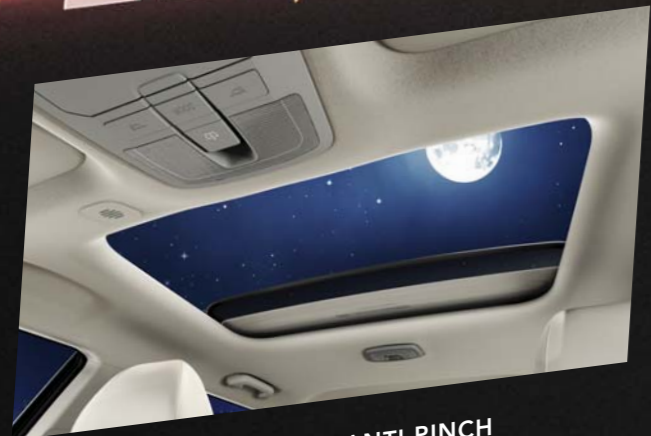
ELECTRIC SUNROOF WITH ANTI-PINCH