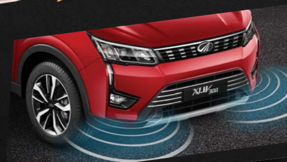
FIRST-IN-SEGMENT FRONT PARKING SENSORS