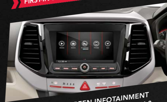
17.78 CM TOUCHSCREEN INFOTAINMENT WITH GPS NAVIGATION, APPLE CARPLAY & ANDROID AUTO™

The XUV300 allows you to adjust the air temperature to create separate, customised environments for the driver and front passenger. With 3 memory slots for your preferred setting, you won't waste time prepping up for your joyride.