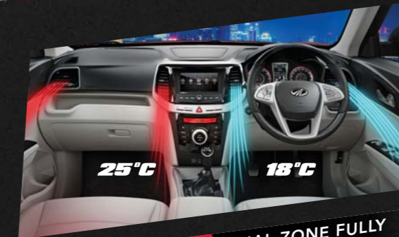
FIRST-IN-SEGMENT DUAL-ZONE FULLY AUTOMATIC TEMPERATURE CONTROL