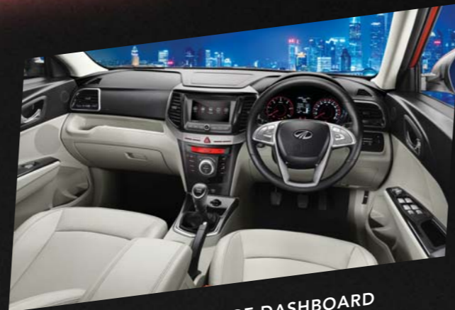
DUAL-TONE BLACK & BEIGE DASHBOARD