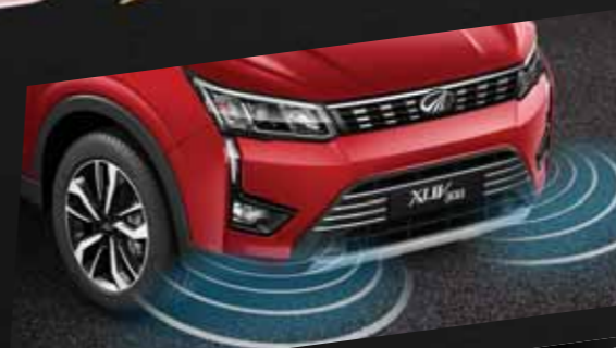
FIRST-IN-SEGMENT FRONT PARKING SENSORS