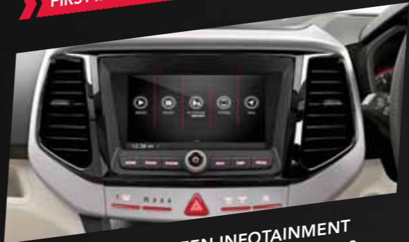
17.78 CM TOUCHSCREEN INFOTAINMENT WITH GPS NAVIGATION, APPLE CARPLAY & ANDROID AUTO™