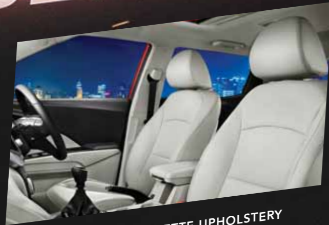
PREMIUM GREY LEATHERETTE UPHOLSTERY