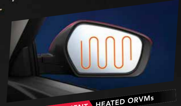
FIRST-IN-SEGMENT HEATED ORVMs