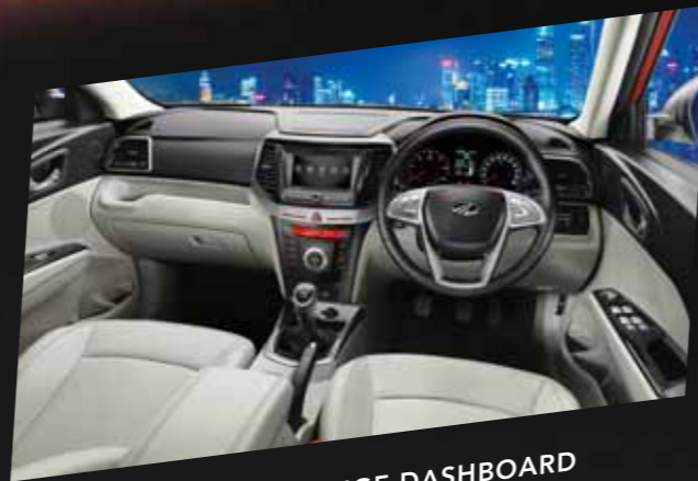
DUAL-TONE BLACK & BEIGE DASHBOARD