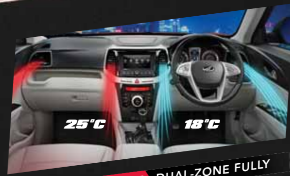
FIRST-IN-SEGMENT DUAL-ZONE FULLY AUTOMATIC TEMPERATURE CONTROL