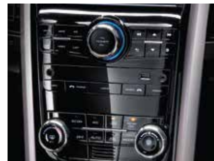
PIANO BLACK CENTRE CONSOLE