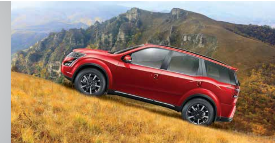
HILL DESCENT & HILL HOLD CONTROL