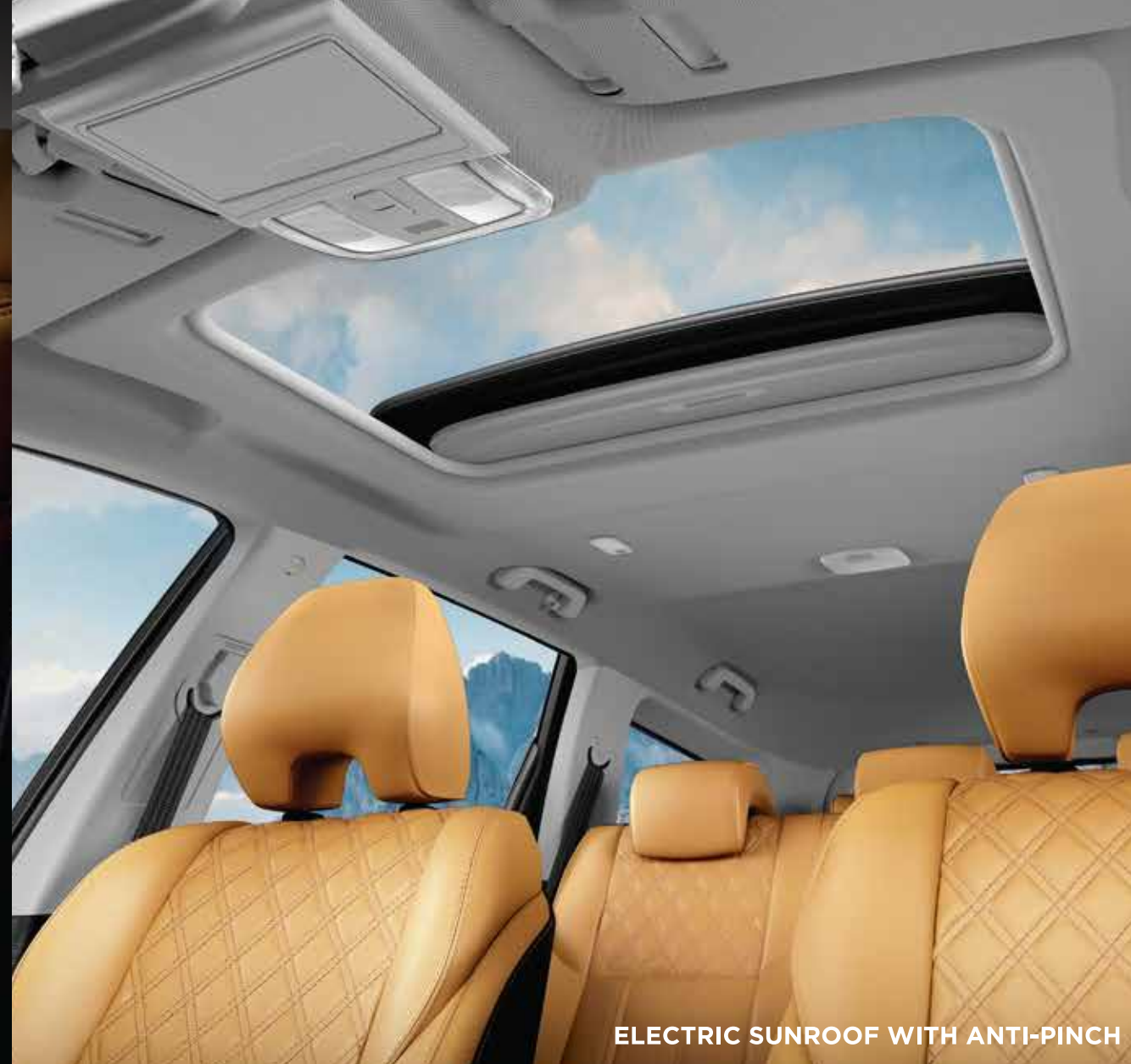
ELECTRIC SUNROOF WITH ANTI-PINCH

Step inside the new XUV500 and you can't help but feel pampered. The immaculate, soft-touch leather craftsmanship with fine stitch lines and piano black centre console add a dash of elegance to the dashboard. And the quilted, tan leather seats further accentuate this feeling of sophistication. But that's not all, look up and you will find the stunning electric sunroof with anti-pinch. Finally, the reduced noise levels, resulting in a much quieter in-cabin experience, ensures that even the most remote adventures, feel nothing short of 5-star extravagance.