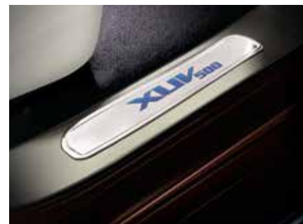
ILLUMINATED SCUFF PLATES