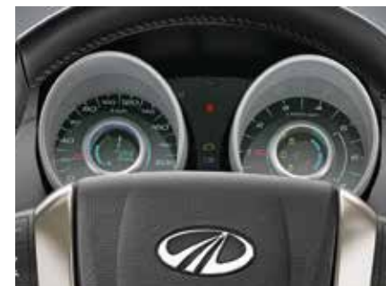
SPORTY TWIN POD CLUSTER