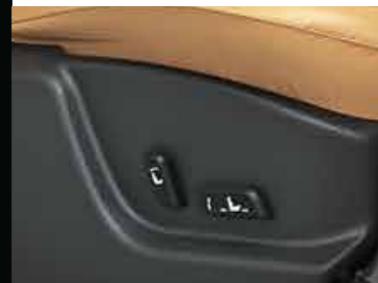
6-WAY POWER-ADJUSTABLE DRIVER'S SEAT

The dashboard and door trims have been fashioned with soft-touch, faux leather with fine stitch lines, elevating the interior's fit and finish by a few notches.