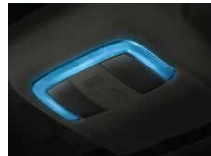
ICY-BLUE LOUNGE LIGHTING