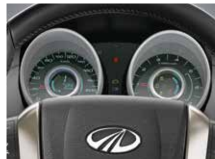
SPORTY TWIN POD CLUSTER