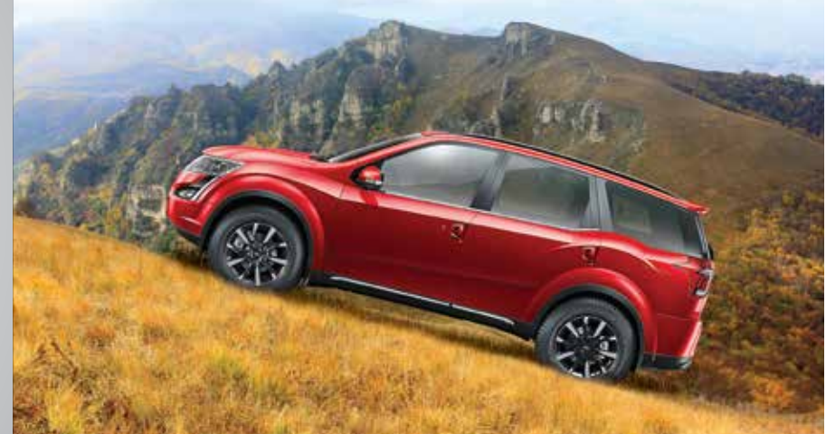
HILL DESCENT & HILL HOLD CONTROL