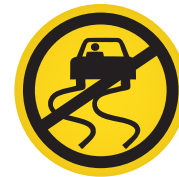
ELECTRONIC STABILITY PROGRAM WITH ROLLOVER MITIGATION SYSTEM

These headlights have a unique quality that light up the curves in the road when you turn the steering wheel. So, there will never be a surprise around the corner.