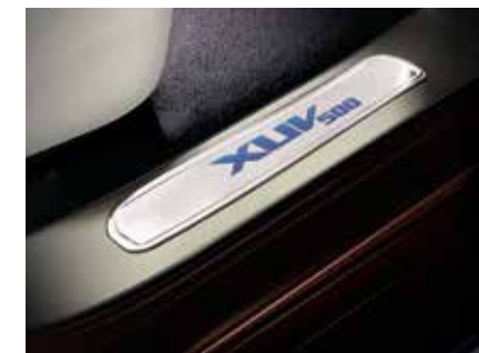
ILLUMINATED SCUFF PLATES