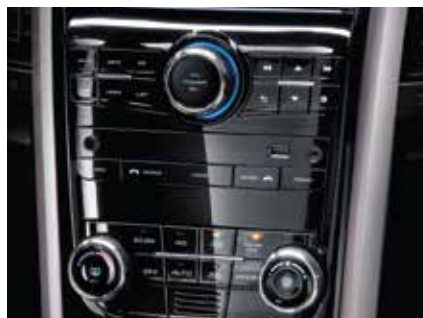
NEW PIANO BLACK CENTRE CONSOLE