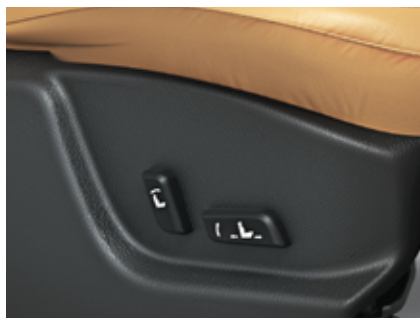
6-WAY POWER-ADJUSTABLE DRIVER'S SEAT