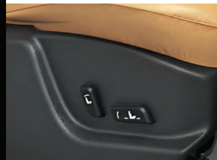
6-WAY POWER-ADJUSTABLE DRIVER'S SEAT

The dashboard and door trims have been fashioned with soft-touch, faux leather with fine stitch lines, elevating the interior's fit and finish by a few notches.