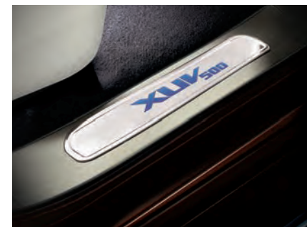
ILLUMINATED SCUFF PLATES