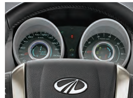
SPORTY TWIN POD CLUSTER