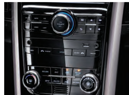
PIANO BLACK CENTRE CONSOLE