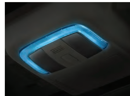
ICY-BLUE LOUNGE LIGHTING