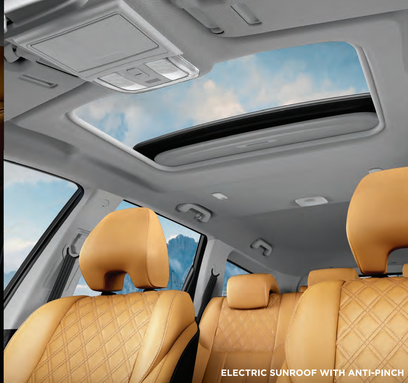
ELECTRIC SUNROOF WITH ANTI-PINCH

Step inside the new XUV500 and you can't help but feel pampered. The immaculate, soft-touch leather craftsmanship with fine stitch lines and piano black centre console add a dash of elegance to the dashboard. And the quilted, tan leather seats further accentuate this feeling of sophistication. But that's not all, look up and you will find the stunning electric sunroof with anti-pinch. Finally, the reduced noise levels, resulting in a much quieter in-cabin experience, ensures that even the most remote adventures, feel nothing short of 5-star extravagance.