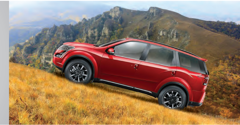
HILL DESCENT & HILL HOLD CONTROL