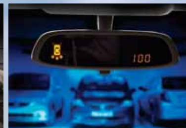
Intellipark reverse assist system