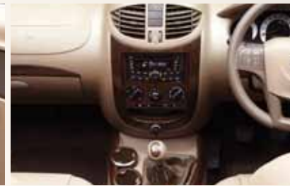
Glossy wood finish console