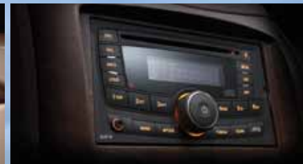
2-DIN music system