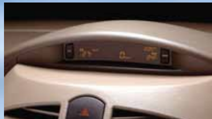
Digital Drive Assist System (DDAS)

With the famed mHawk engine, EST and a magical voice command system, the stylish new Xylo is sure to get you wows. But don't take our word for it. Take it for a test drive and watch it thrill you, first hand. Of course, in-cabin entertainment is first class and the ample safety and convenience features leave nothing to be desired.