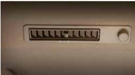
Individual AC vents