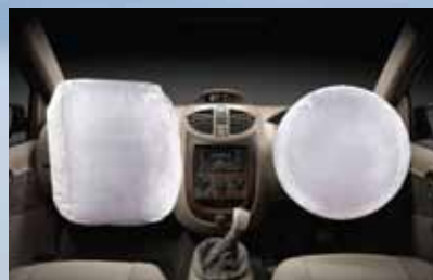
Dual SRS airbags