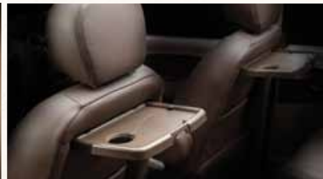
Foldable snack trays