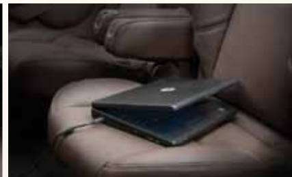
Laptop and mobile charging point