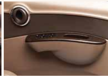
Stylish new door trims