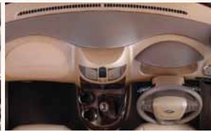
New two-tone dashboard