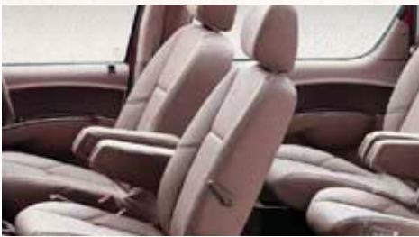
Genuine Italian leather interiors

Long legs are always happy in a Xylo, thanks to the generous legroom. But the luxurious new cabin of the Xylo makes even fashion models dreamy. There's chic leather and glossy wood finishing everywhere. The seats transform into flat beds for your comfort and the air-conditioning is perfect, even in the last row.