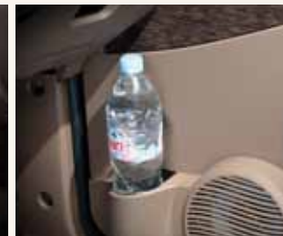
Convenient storage spaces

Of course, the features that made the Xylo the most comfortable MUV on Indian roads are all still there. Like the best-in-class legroom, auditorium-like seating and more.