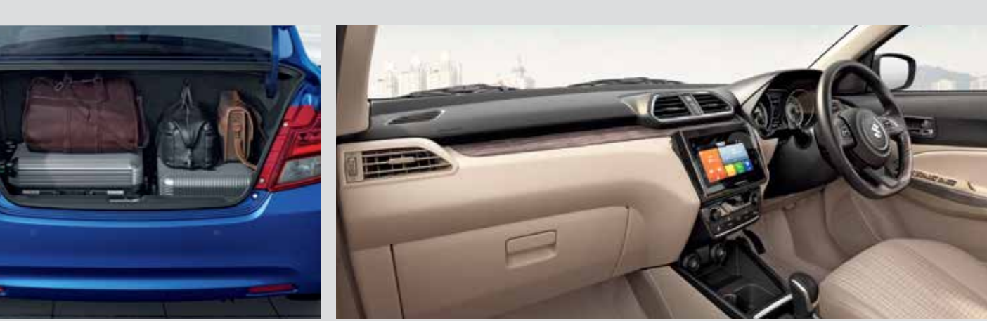
Large Boot Makes room for all your desires

That takes premiumness to a whole new level