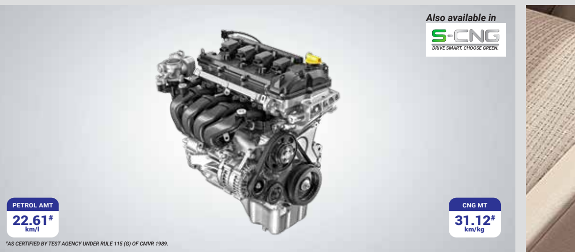
Advanced K Series DualJet, Dual VVT Engine

The Dzire comes with performance at its core. So, every time you take the wheel, the drive is powerful, efficient yet elegant.