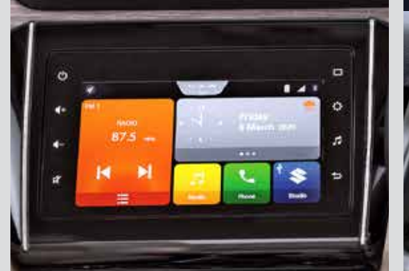
SmartPlay Studio System (17.78cm) With in-car entertainment & top-notch features

Powered by the latest technology, the all-new Dzire makes a host of features available at your fingertips, letting every drive be convenient and easy.