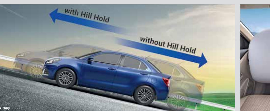
Electronic Stability Program with Hill-hold Assist* So that the drive remains smooth, even on inclined surfaces