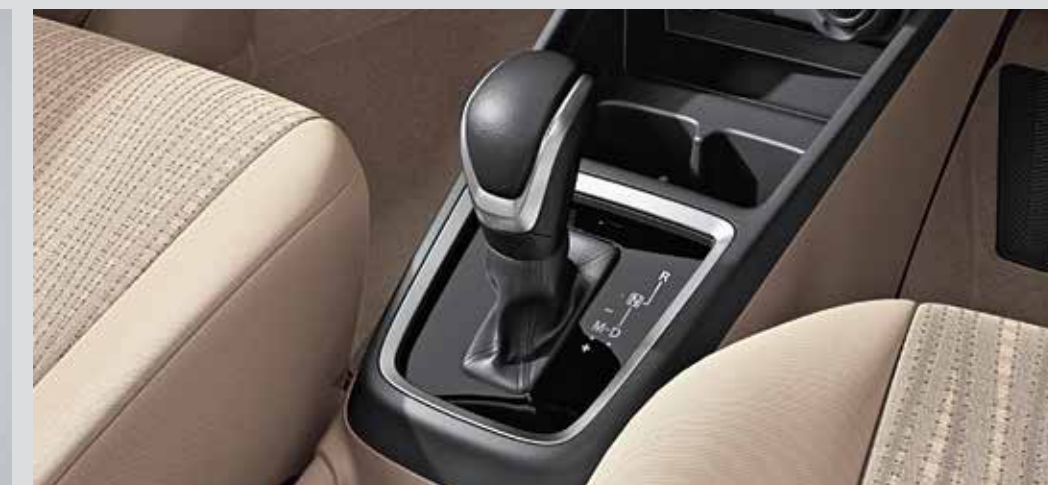
Automatic Gear Shift Technology Makes every drive effortless

Powered by the trusted K-series technology, now with an improved mileage