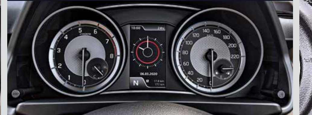
Coloured Multi Information Display (10.67cm) With dynamic screens that provide useful car information