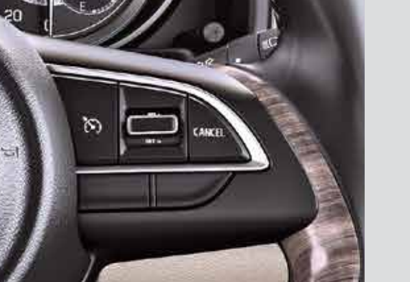
Steering-mounted controls with Cruise Mode Giving you the power at your fingertips