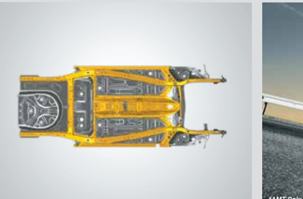
Suzuki HEARTECT Platform Absorbs collision impact, enhances safety

The Dzire comes equipped with features that take care of the safety of all the passengers.