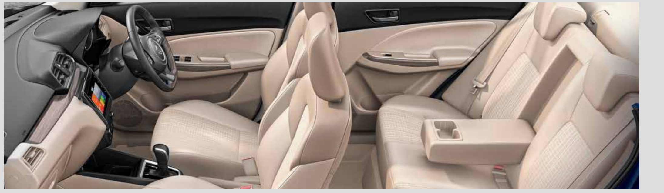
Stylish & spacious Interiors That provide comfort, space and elegance, all at the same time

With the Dzire, you enter a world that is filled with elegance, plush interiors, lots of space and even more style.