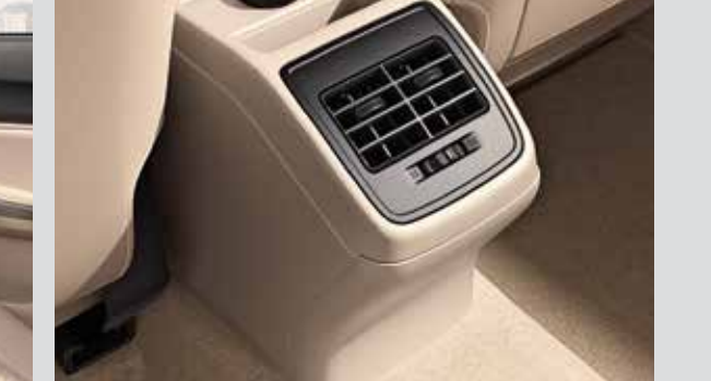
Rear AC Vent Provides backseat-comfort and relaxation