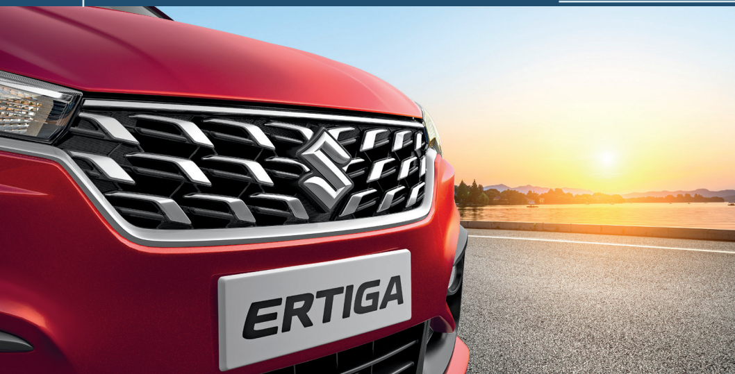
Dynamic Chrome Winged Front Grille The most stylish way to make an entrance.

● Elegant from every angle, the Ertiga is designed to bring out the stylish side of togetherness.