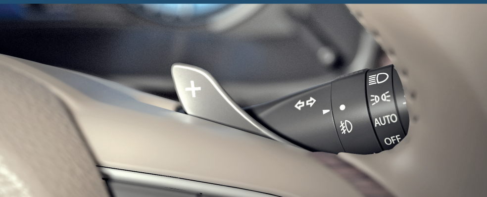
6-Speed AT with Paddle Shifters Surge ahead by engaging the smart paddle shifters.

● Togetherness, driven by technology. The Ertiga is equipped with state-of-the-art technology to add more fun to your moments of togetherness.