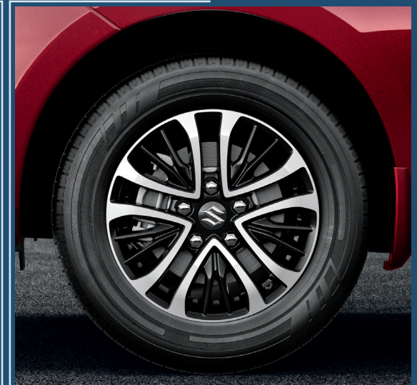
Machined Two-Tone Alloy Wheels Make a statement, every time.