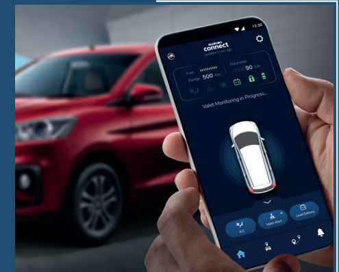
Connected Car Technology with Suzuki Connect Always stay connected with your car.