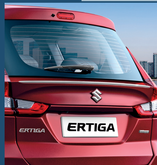
New Back Door Garnish with Chrome Insert Let those second looks chase you.