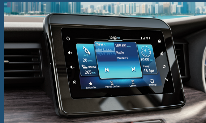
17.78cm Smartplay Pro Connect with your world with just a voice command - "Hi Suzuki".