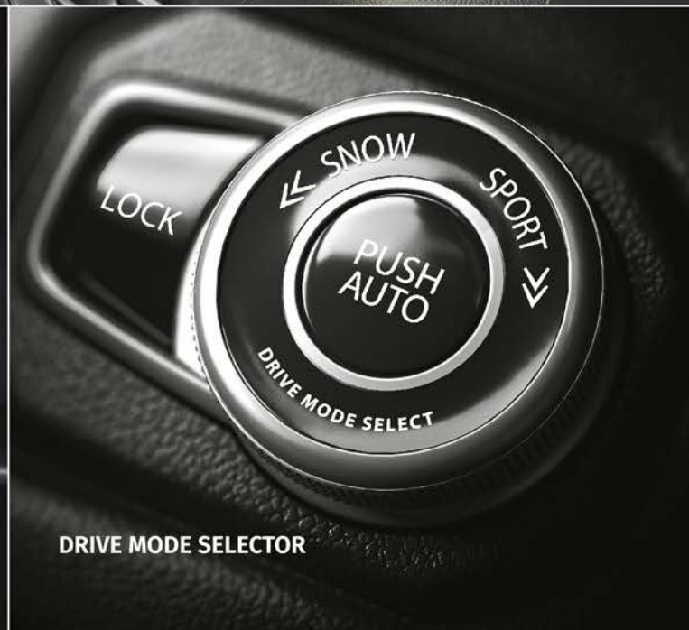
DRIVE MODE SELECTOR