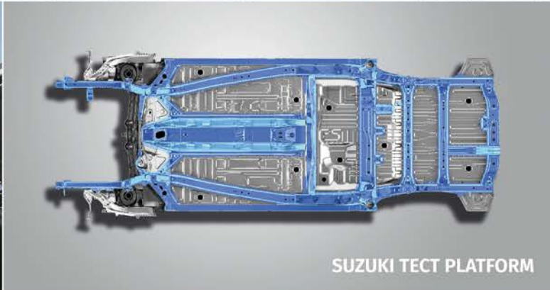
SUZUKI TECT PLATFORM