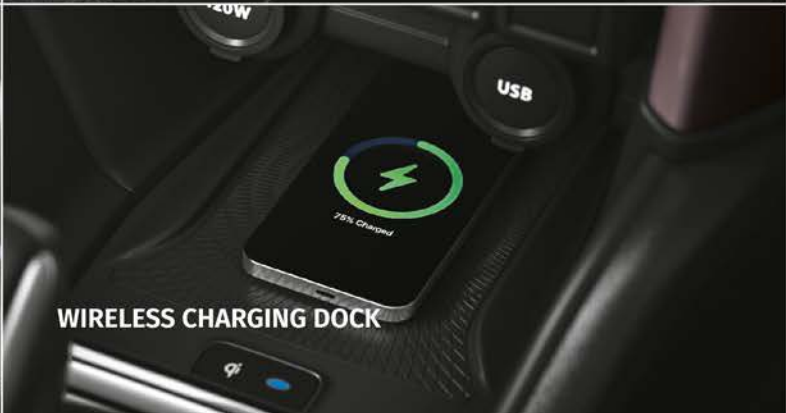
WIRELESS CHARGING DOCK