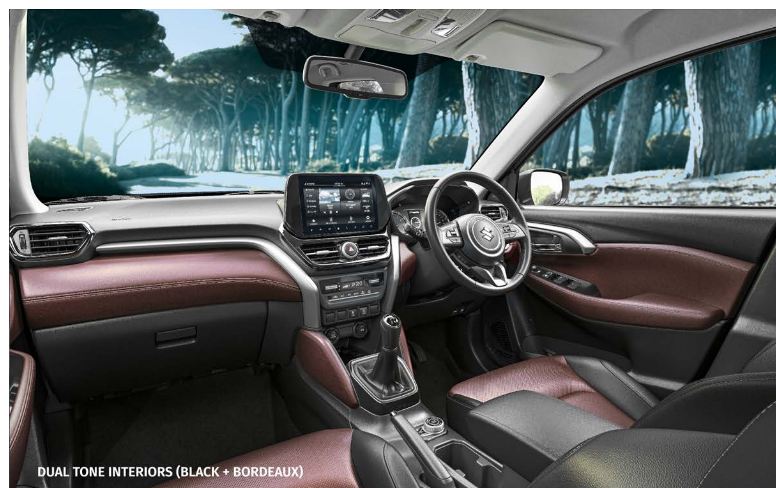
DUAL TONE INTERIORS (BLACK + BORDEAUX)