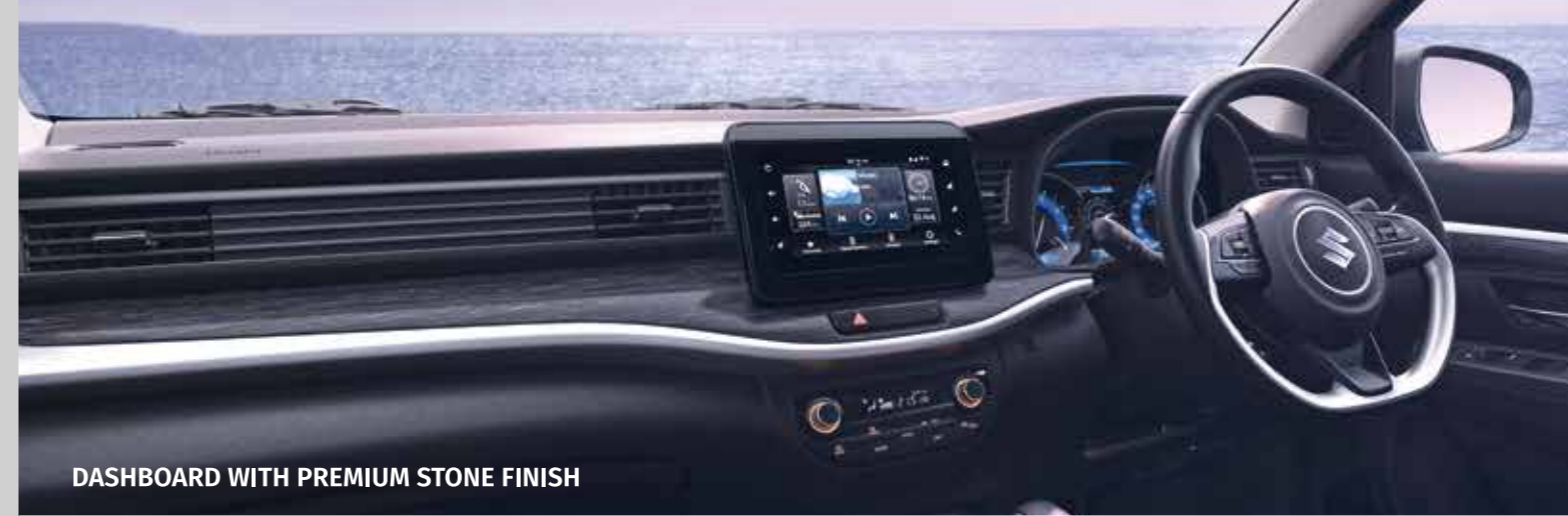
DASHBOARD WITH PREMIUM STONE FINISH

Featuring a distinct new Front Chrome Grille with a Sweeping X-Bar that flows smoothly into the Quad Chamber LED Headlamps as LED DRLs, the All-New XL6 makes its presence felt. The distinct hood is complemented by aggressive shoulder lines that firmly highlight its body contours and seamlessly flow into the Smoke Grey LED Tail Lamps, carrying the powerful design from the front to the rear. Sporty Roof Rails, a Back Door Spoiler and the new Shark Fin Antenna radiate an unmistakable sense of style while the striking Dual-Tone Machined-Finish R16 Alloy Wheels evoke a sense of stability whenever you take it out for a spin.