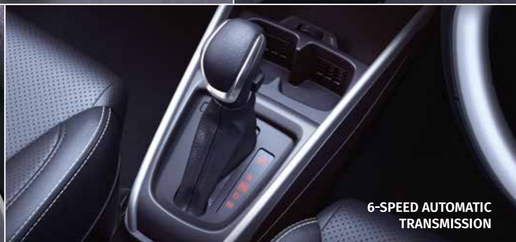
6-SPEED AUTOMATIC TRANSMISSION