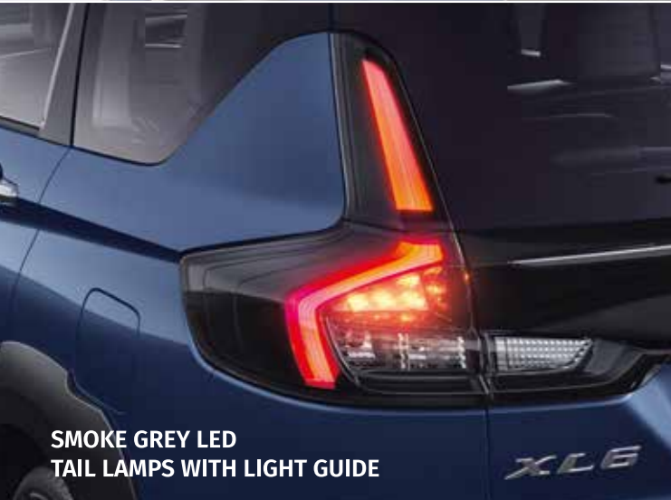
SMOKE GREY LED TAIL LAMPS WITH LIGHT GUIDE