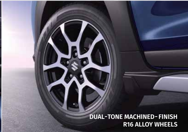
DUAL-TONE MACHINED-FINISH R16 ALLOY WHEELS