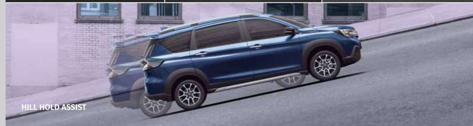
HILL HOLD ASSIST

In addition, the All-New XL6 has ISOFIX Child Seat Mounts, Speed Alert System, Driver and Co-driver Seat Belt Reminder, Rear Parking Sensors and many more features dedicated to your safety and comfort when on the move.