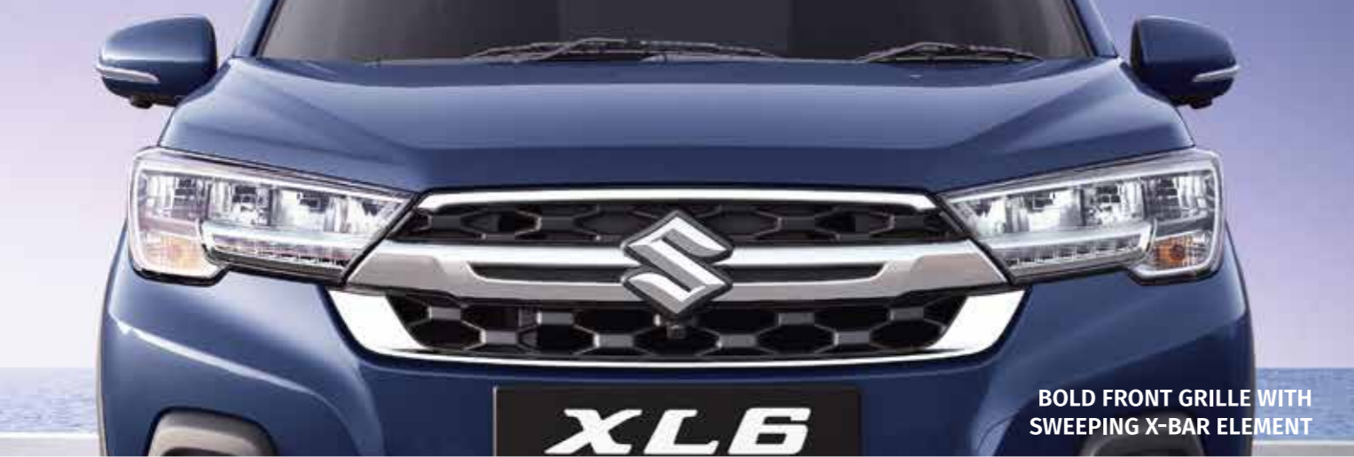
BOLD FRONT GRILLE WITH SWEEPING X-BAR ELEMENT