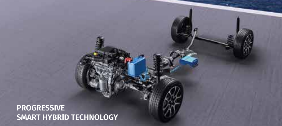
PROGRESSIVE SMART HYBRID TECHNOLOGY