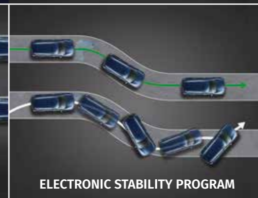
ELECTRONIC STABILITY PROGRAM