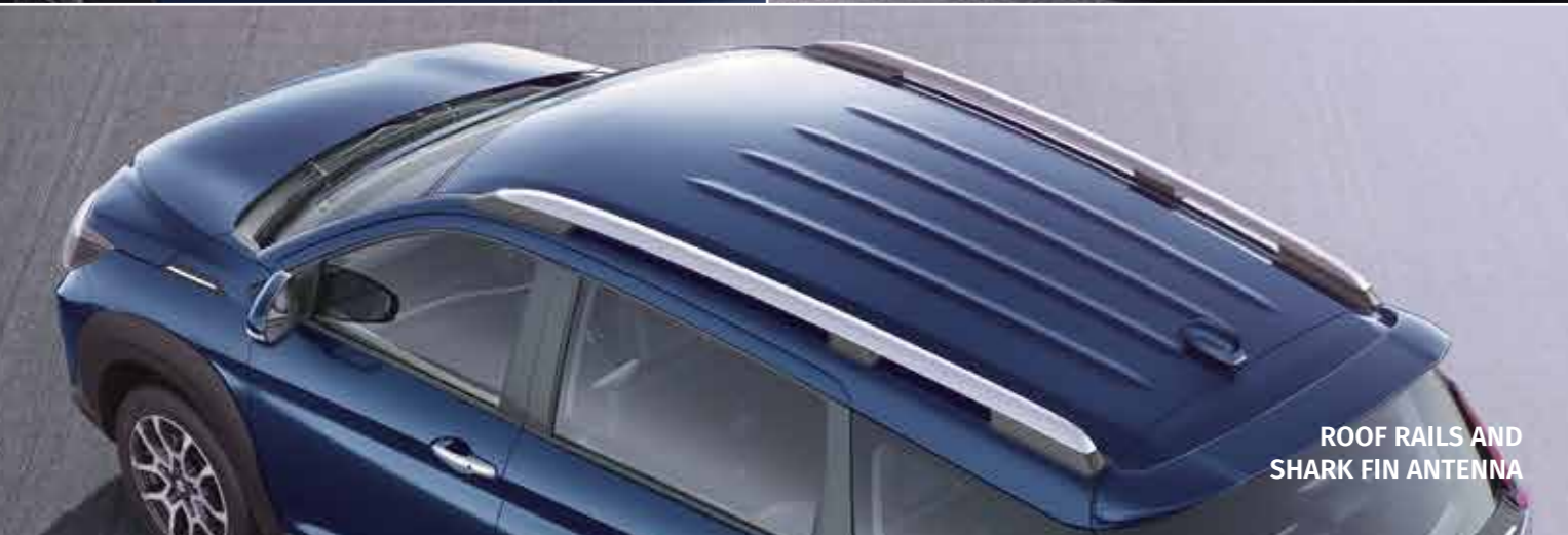
ROOF RAILS AND SHARK FIN ANTENNA