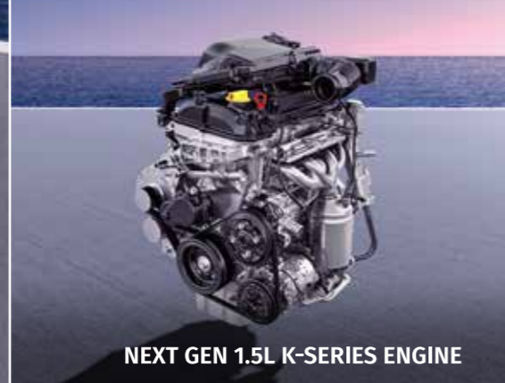
NEXT GEN 1.5L K-SERIES ENGINE