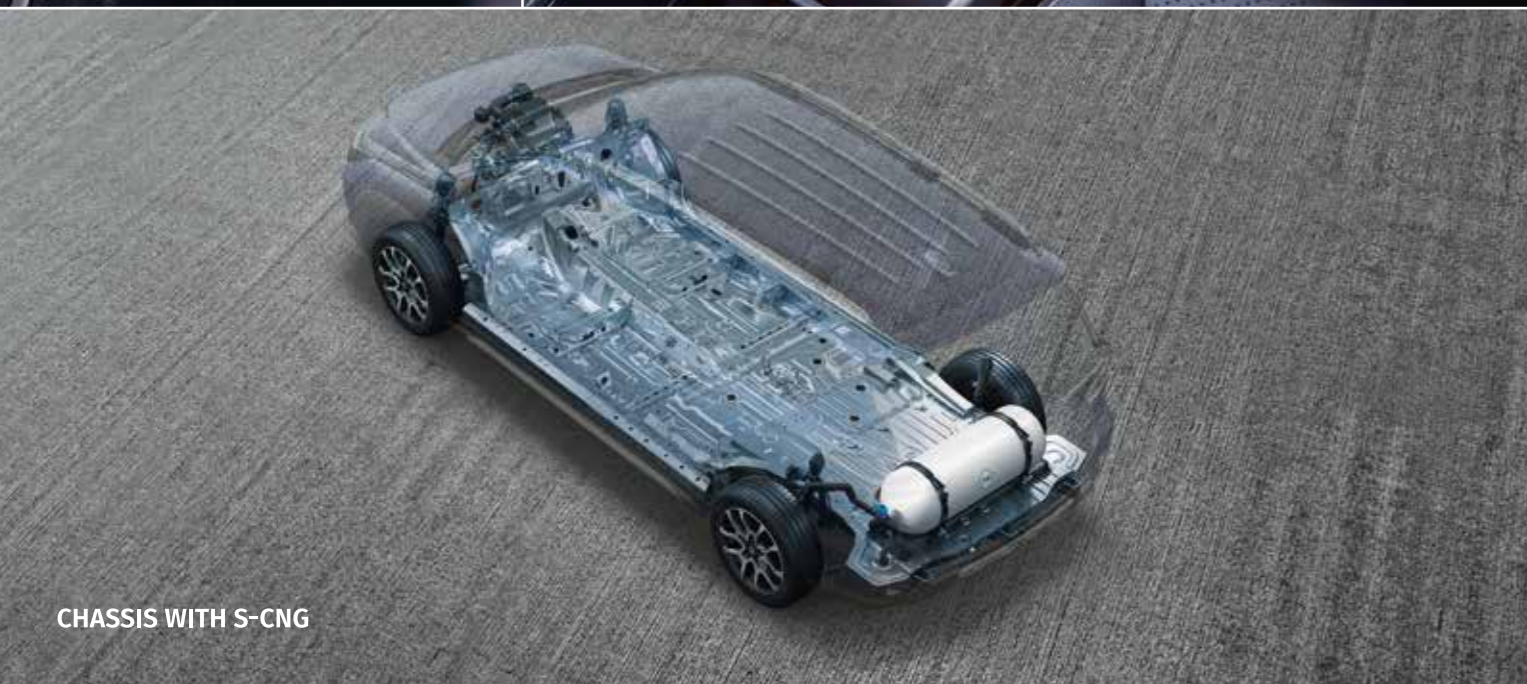
CHASSIS WITH S-CNG