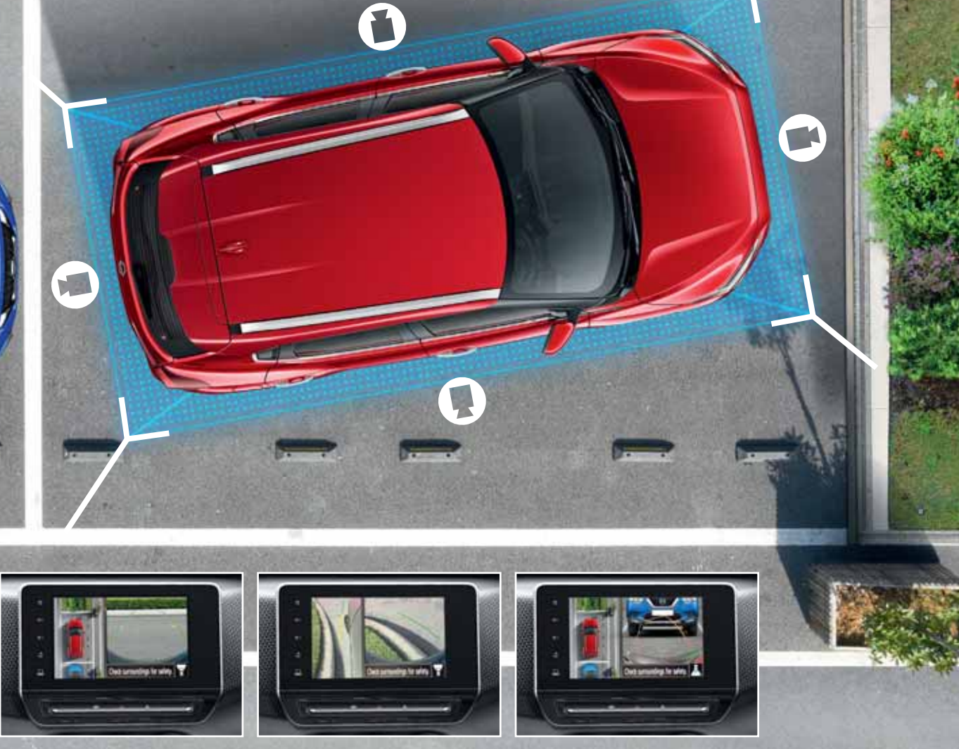
BIRD'S EYE & FRONT VIEW

No more cables. No more hassles. Be it for navigation or grooving on the go, stay wirelessly connected to the classy 20.32 cm full flush touchscreen with Android Auto & Apple CarPlay.