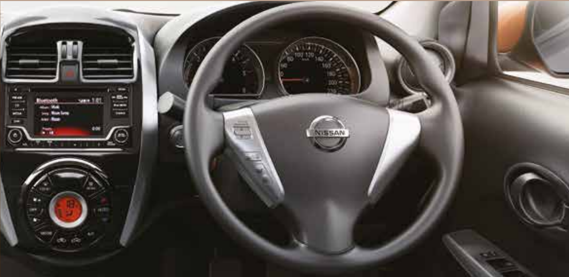
Steering Mounted Audio Controls and Handsfree Phone