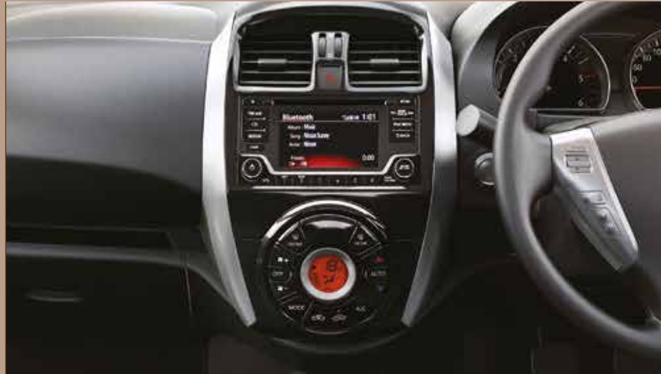
Piano Black Finish Instrument Cluster