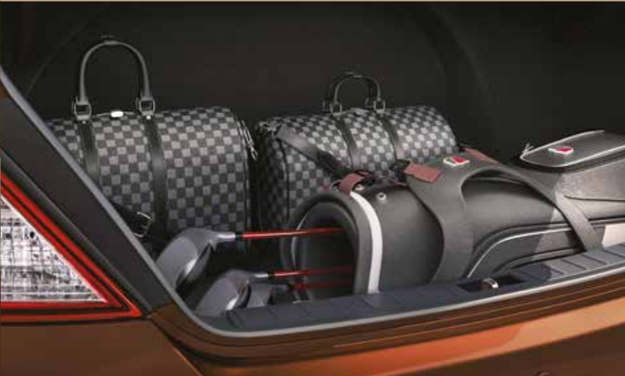
490 (l) Boot Space