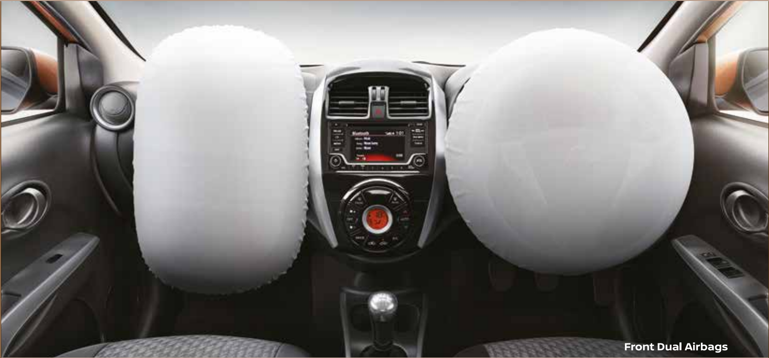
Front Dual Airbags