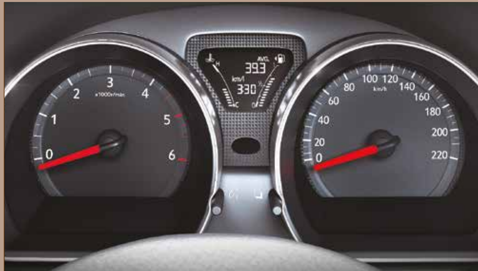
Fine Vision Metre and Drive Computer