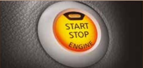
Push Button Start