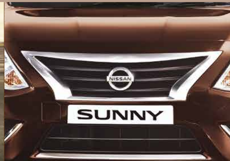
Chrome Plating Radiator Grille