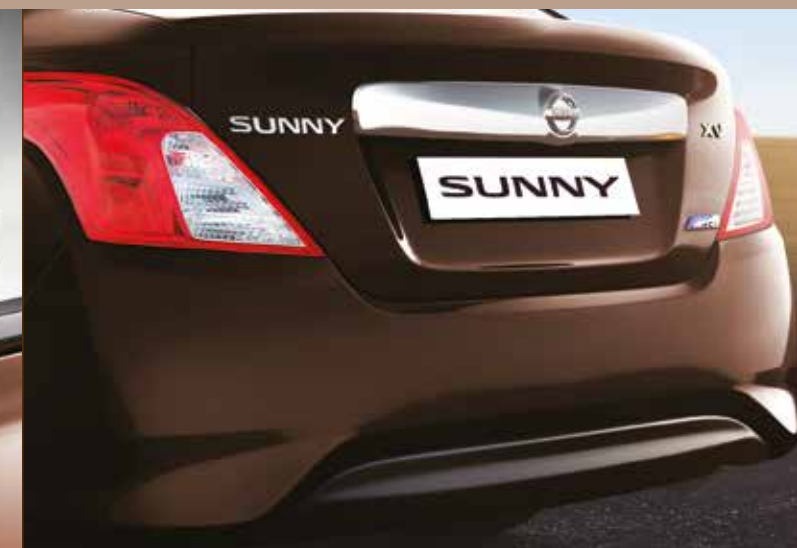
Rear Trunk Chrome Garnish and New Rear Bumper Shape