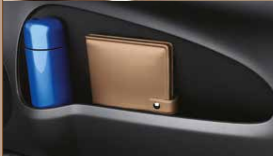
Door Bottle Holders