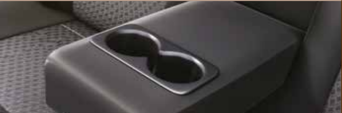
Rear Seat Centre Arm Rest