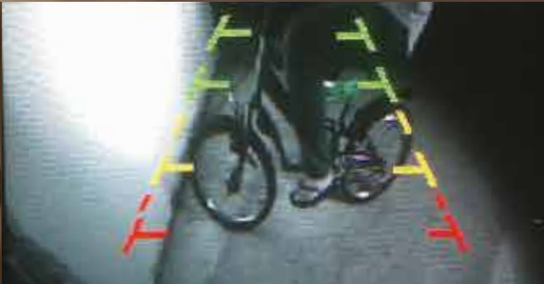
Rear View Camera with Park Assist