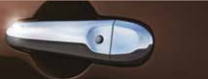
Intelligent Entry System