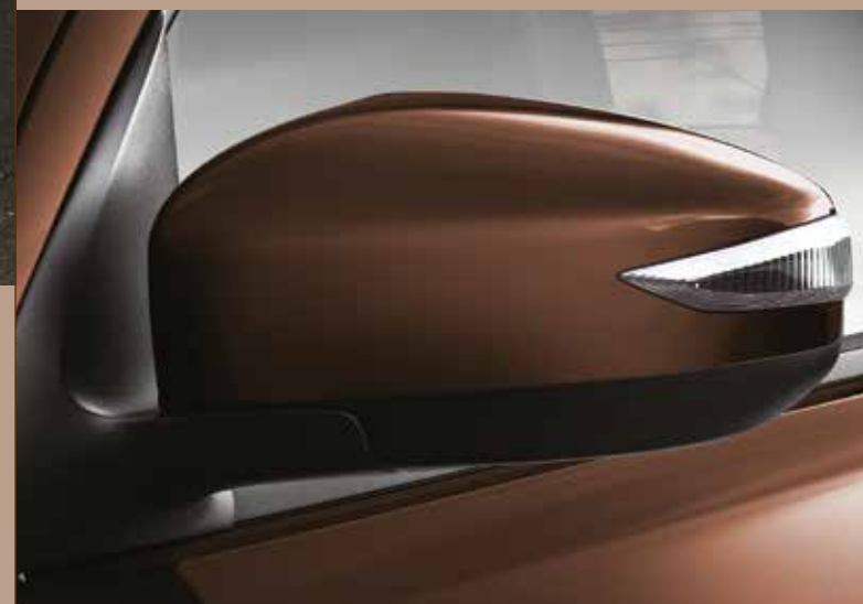
Foldable, Electrically Adjustable ORVM with Side Indicators

Aerodynamically designed, the new Nissan Sunny speaks volumes. From the bold Chrome Grille for that unforgettable frame and the Nissan Bagde to the redesigned Boomerang Headlamps for that stylish and modern touch. The chiselled front and sides complement the sleek roof while the Y-spoke design of the R15 alloy wheels add to the new Nissan Sunny's commanding presence.