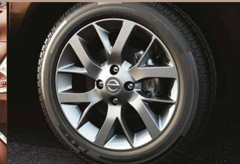
R15 12 Spoke Alloy Wheels