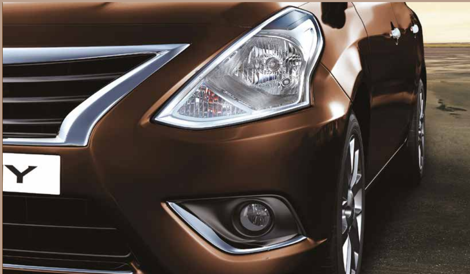
Boomerang Headlamps and Chrome Highlighted Fog Lamps