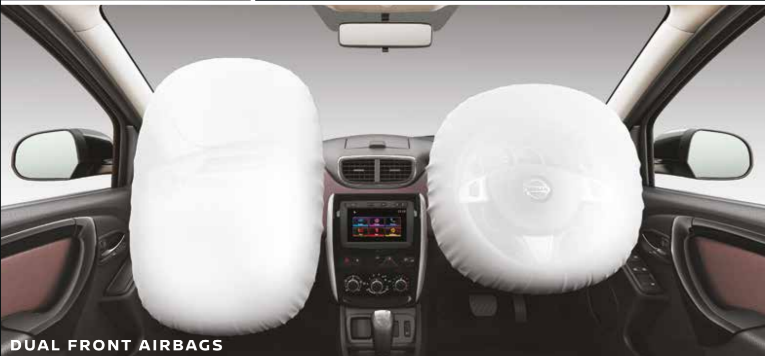
DUAL FRONT AIRBAGS

When you're up against the world, it pays to stay safe. And when it comes to safety, the new Nissan Terrano reigns supreme. From a thoughtfully-designed body to well-imagined interiors, it helps you conquer terrains. Safely.