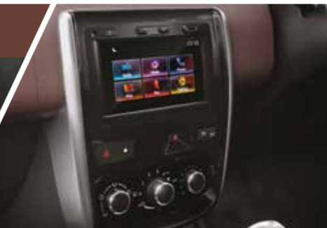
BLUETOOTH, USB AND AUX-IN CONNECTIVITY