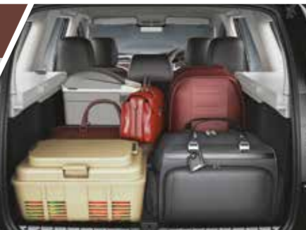
EXTRA LARGE BOOT