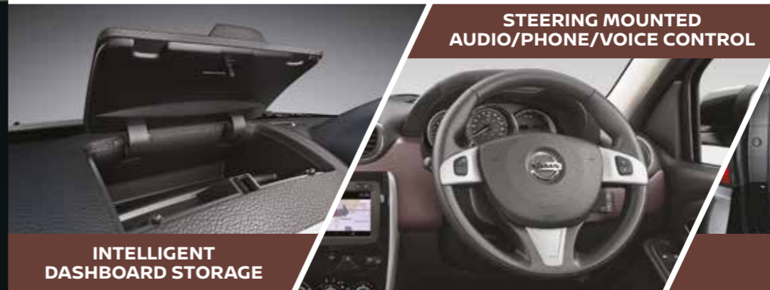
INTELLIGENT DASHBOARD STORAGE