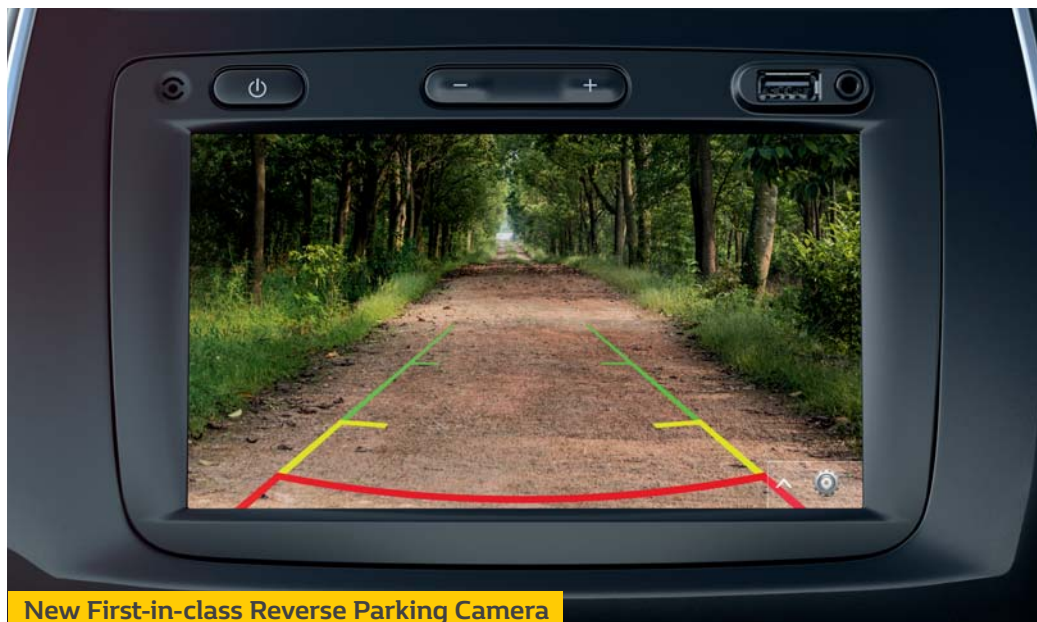
New First-in-class Reverse Parking Camera