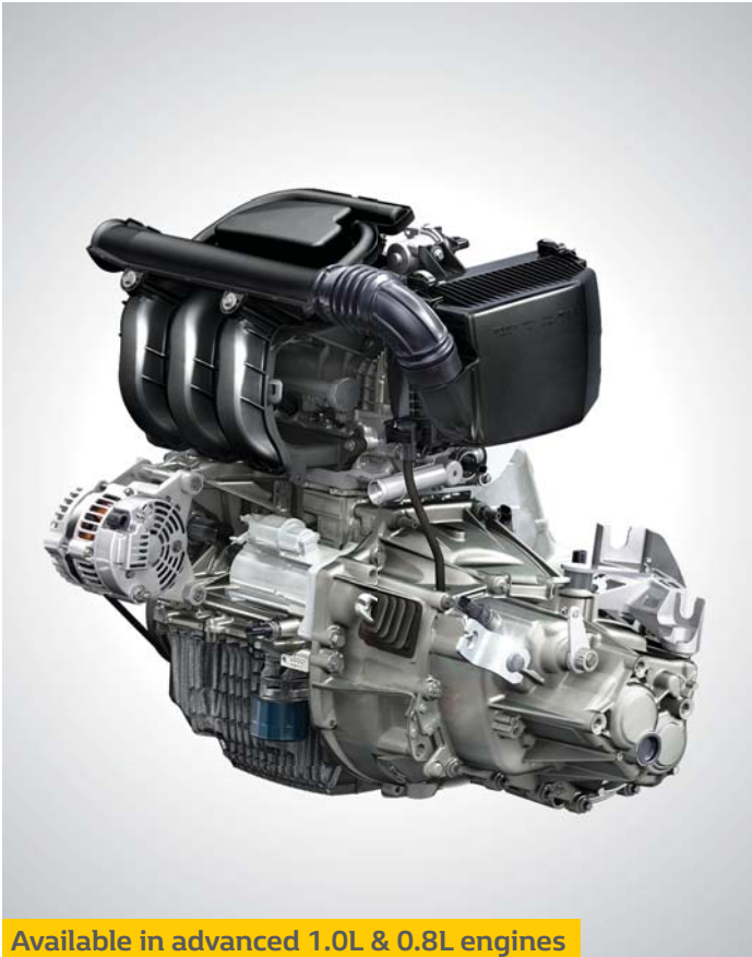
Available in advanced 1.0L & 0.8L engines