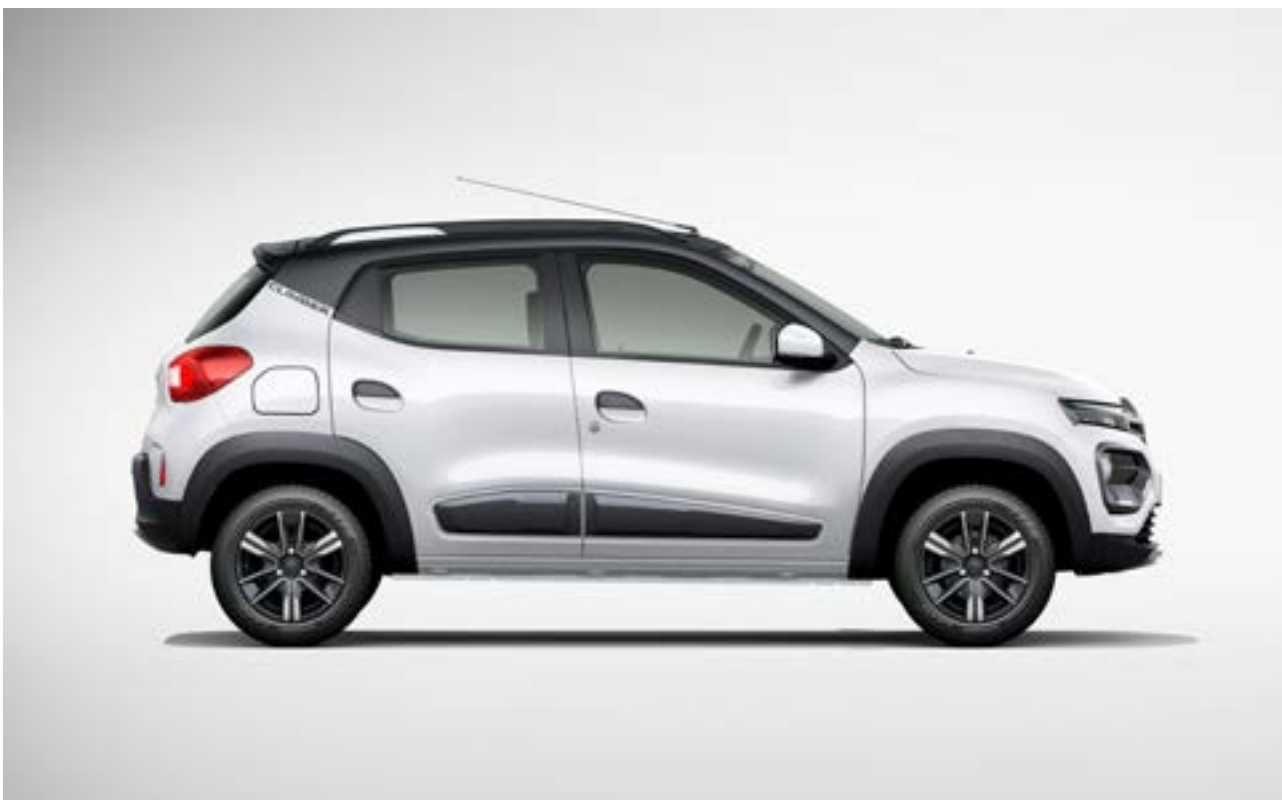
ice cool white