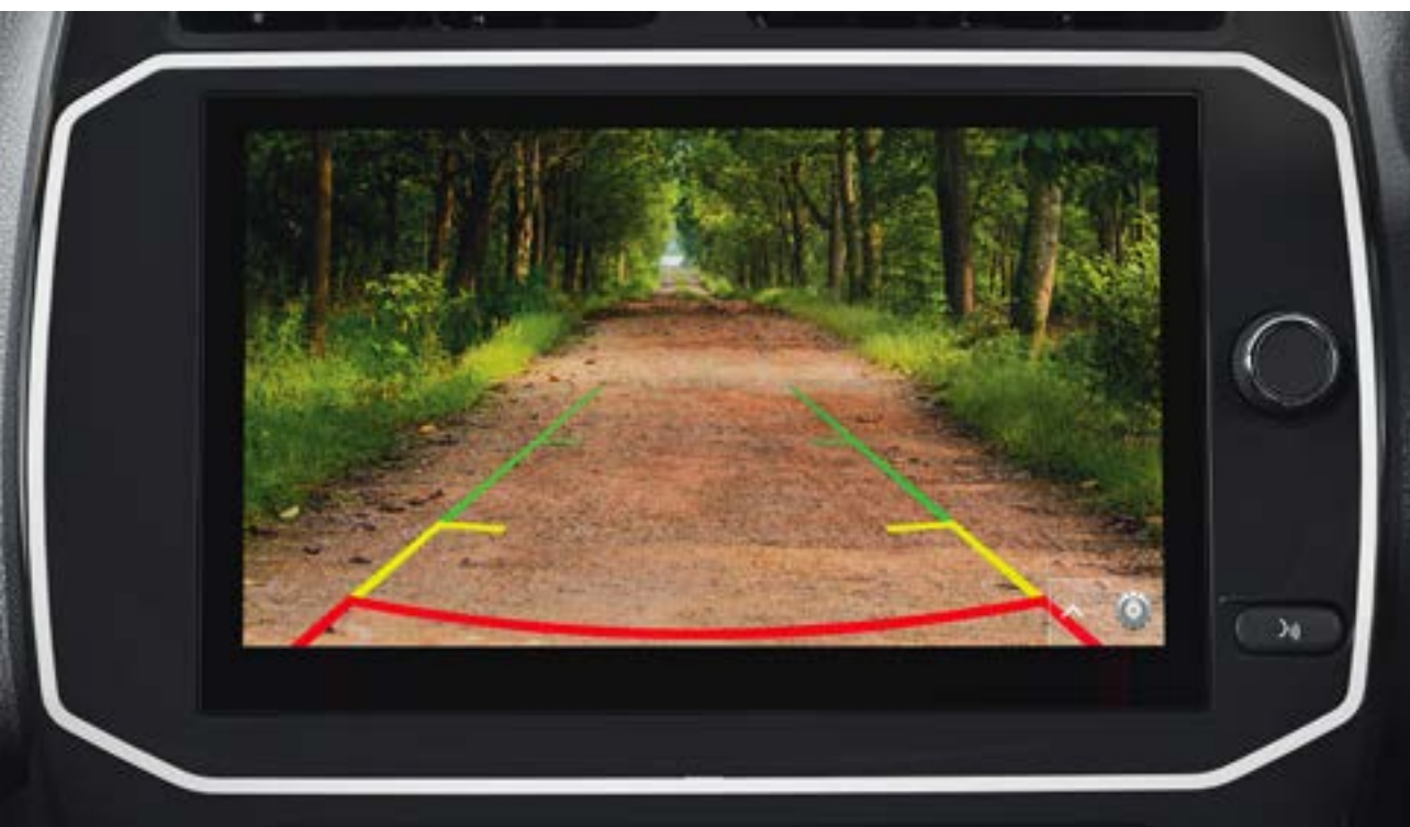
reverse parking camera with guidelines 1 Enhances parking precision in tight spots by providing visual assistance.