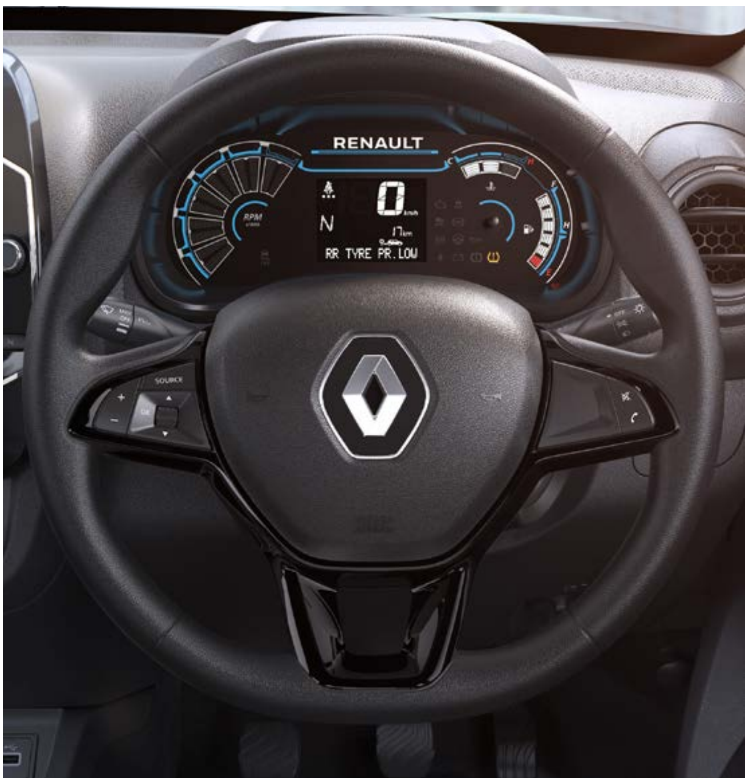
steering mounted audio controls