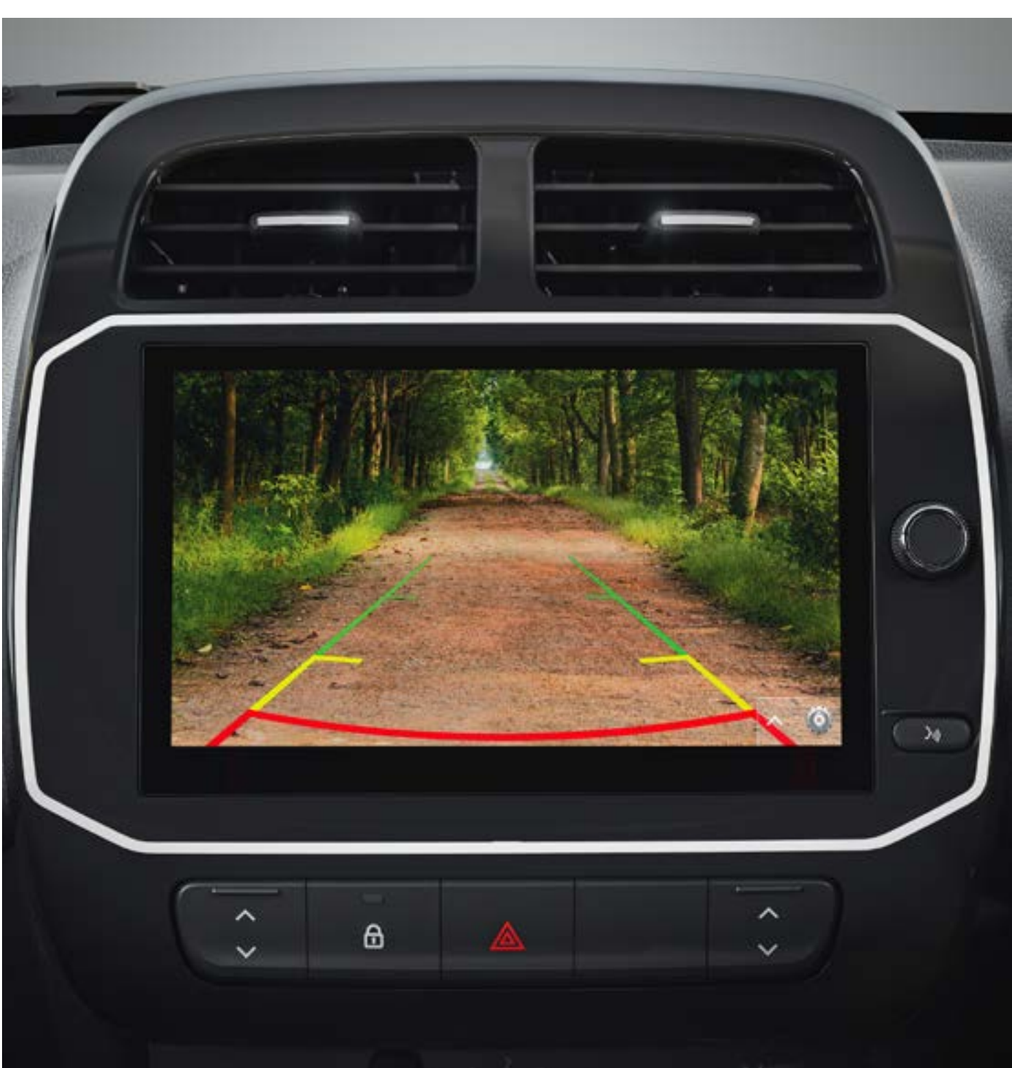
20.32 cm touchscreen mediaNAV