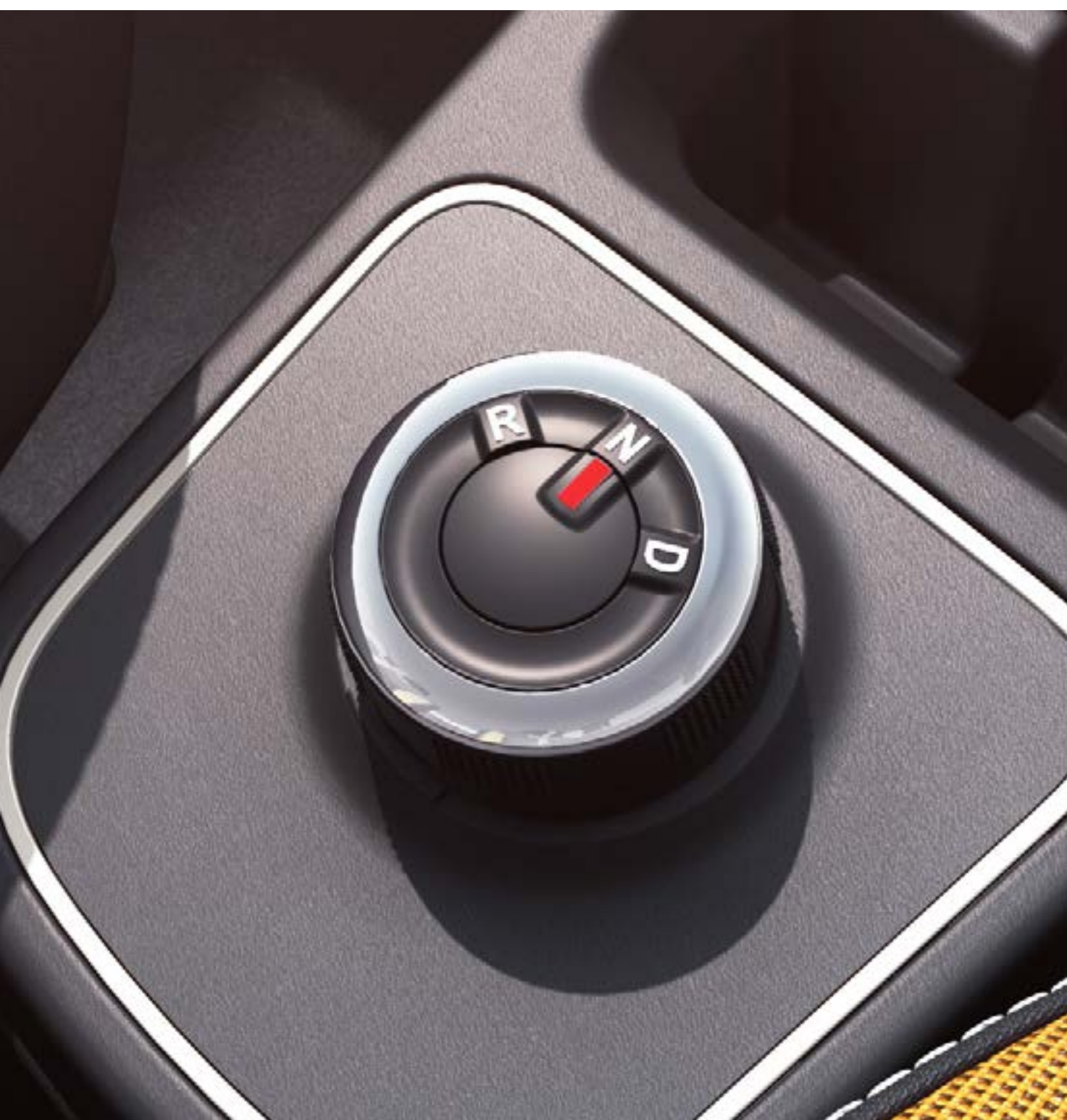
floor console mounted AMT dial