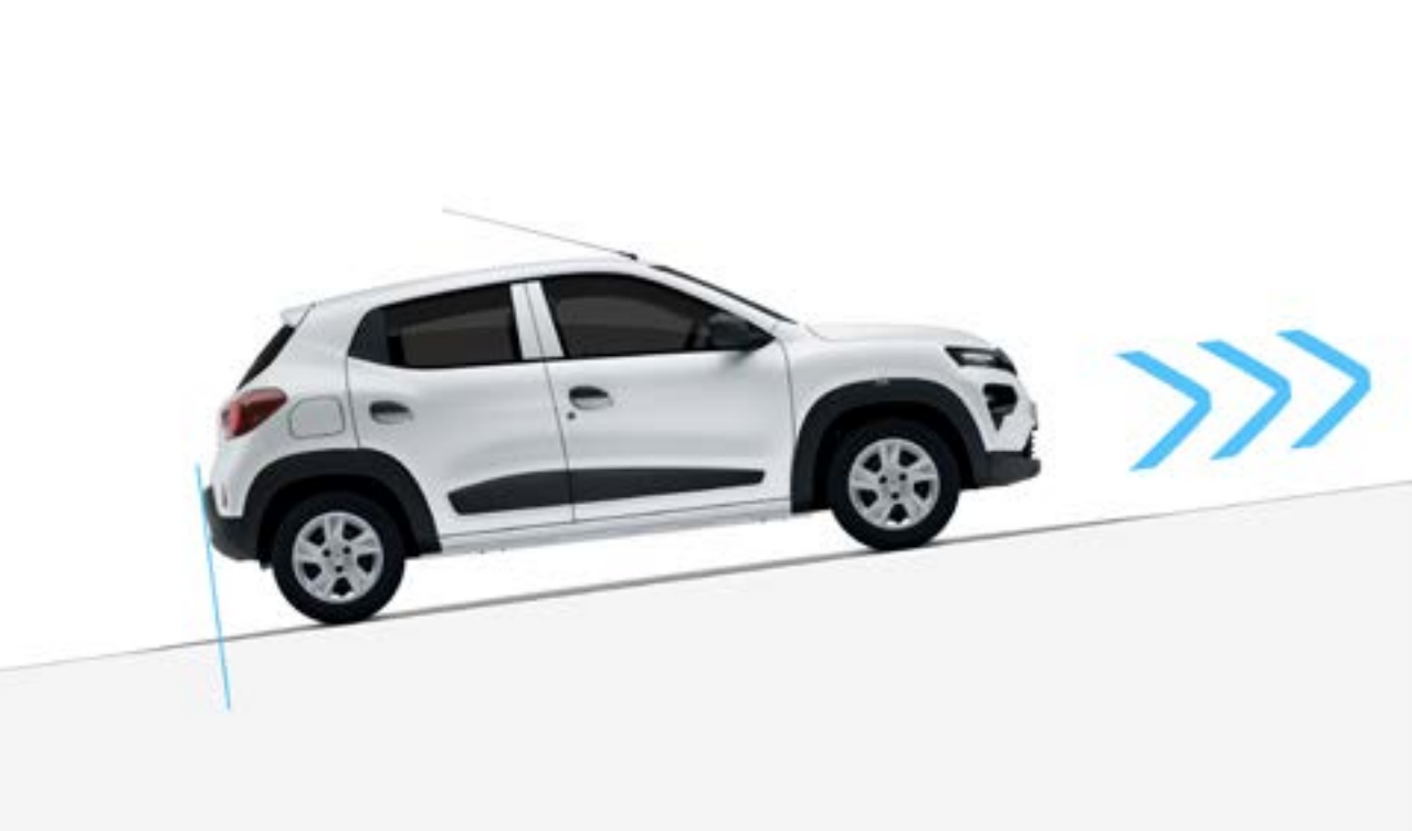
hill start assist 2 Maintains brake pressure for two seconds, preventing rollback when you move away on a steep slope.