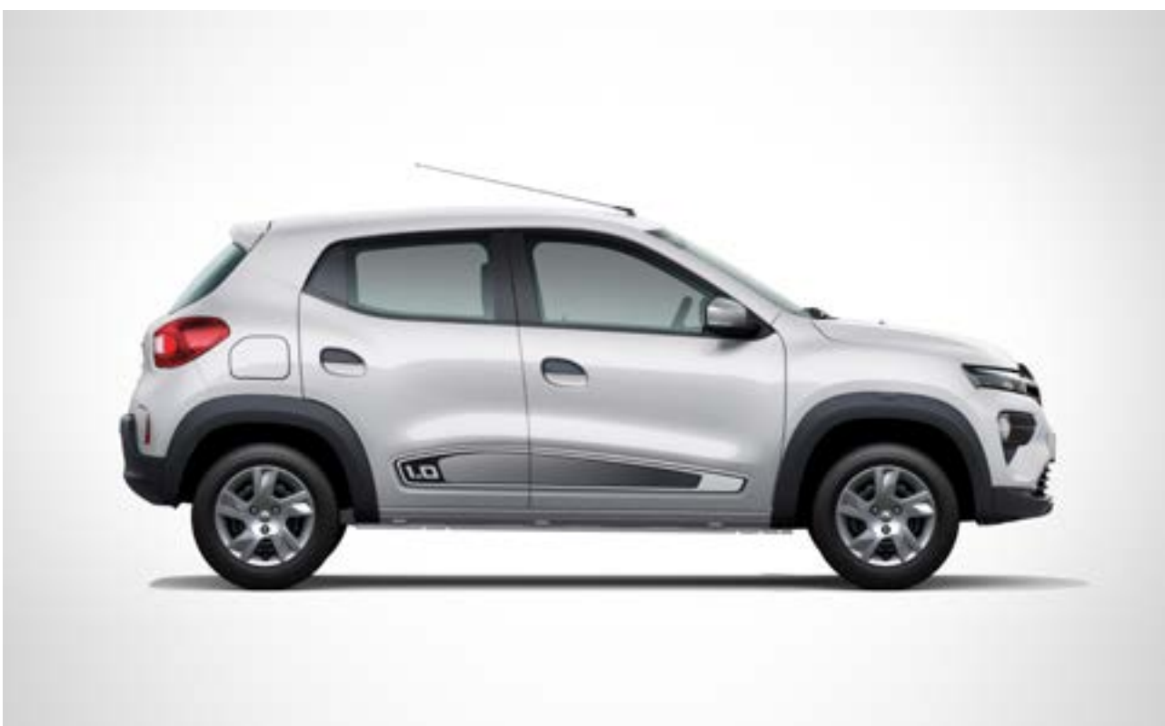
ice cool white