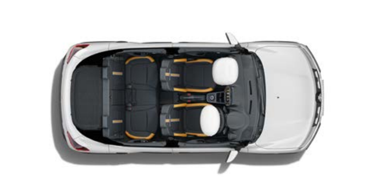
dual airbags Provide crucial protection by minimising the impact of collision.