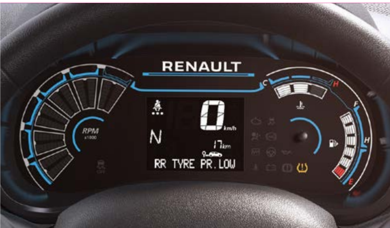
tyre pressure monitoring system Displays the tyre pressure status in real-time.