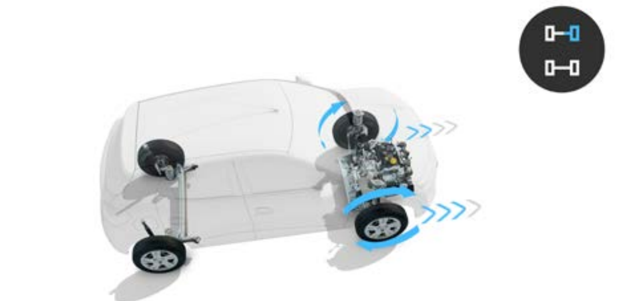
traction control system Limits wheel slip during starting, acceleration and braking.