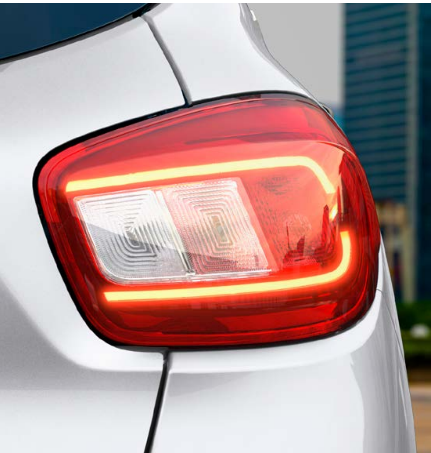
tail lamps with LED light guides