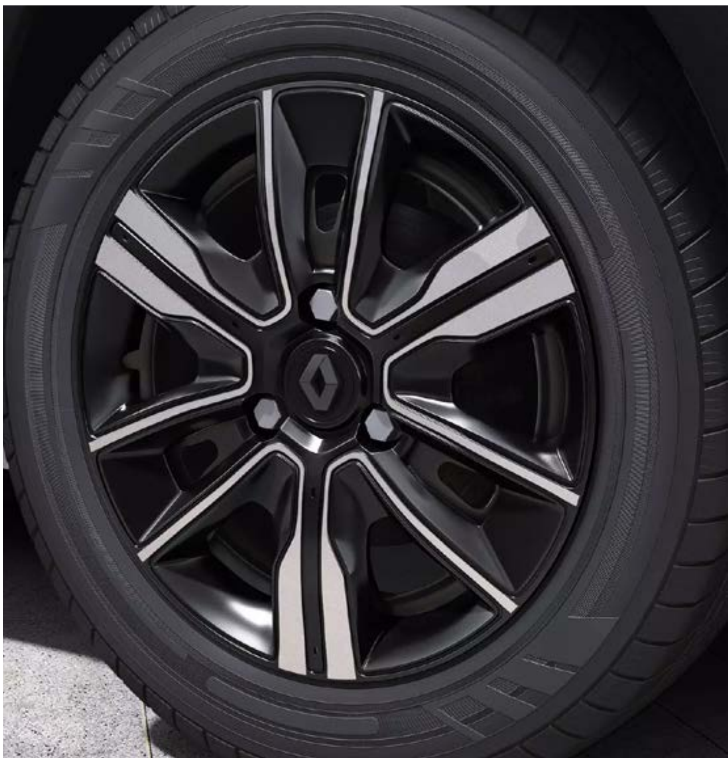
dual tone multi-spoke flex wheels