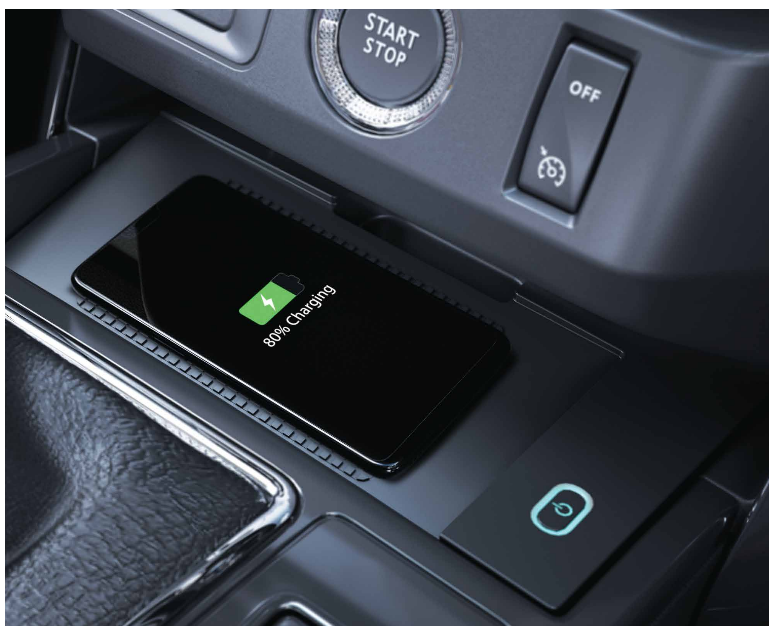
wireless smartphone charger