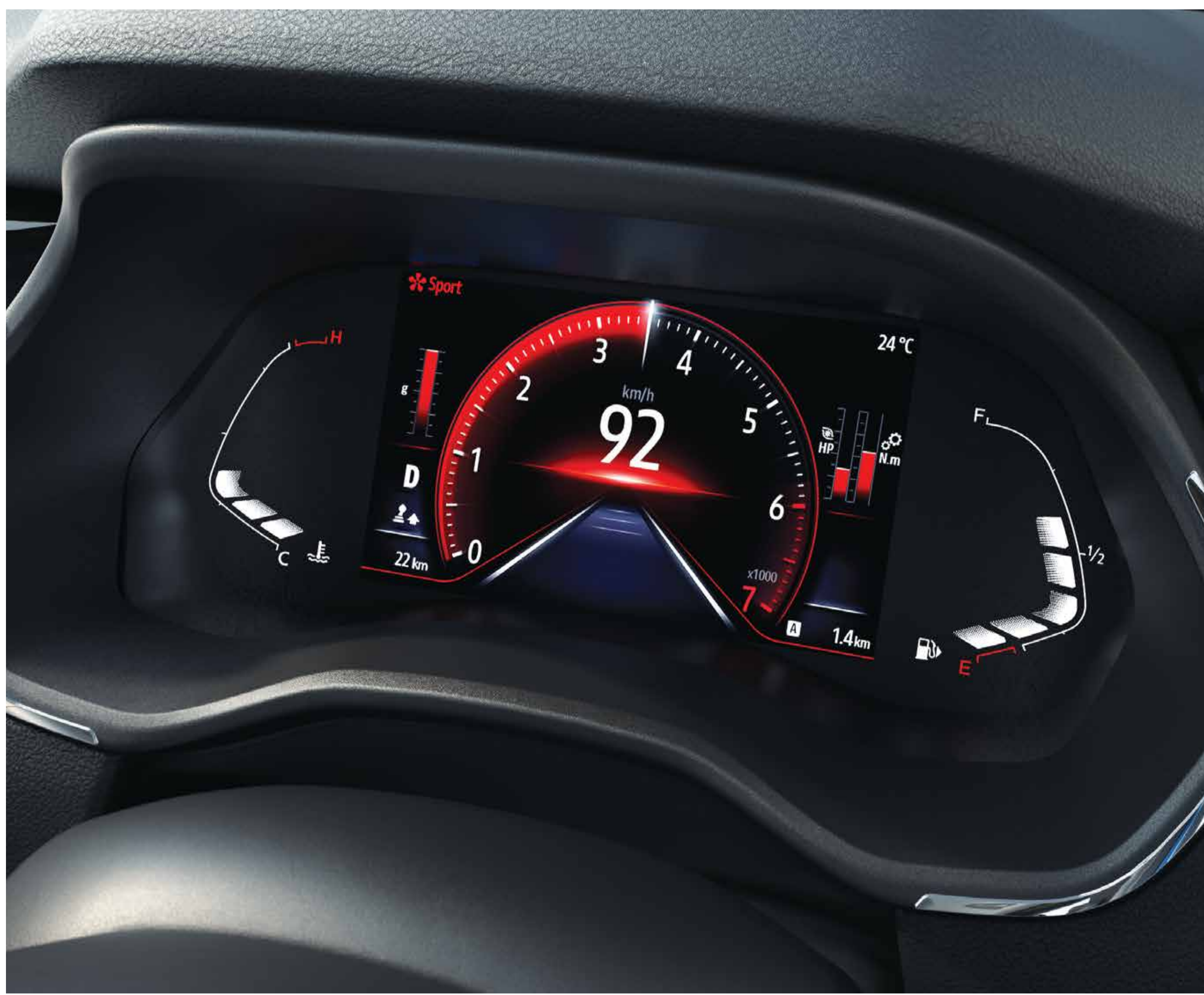
17.78 cm reconfigurable TFT cluster