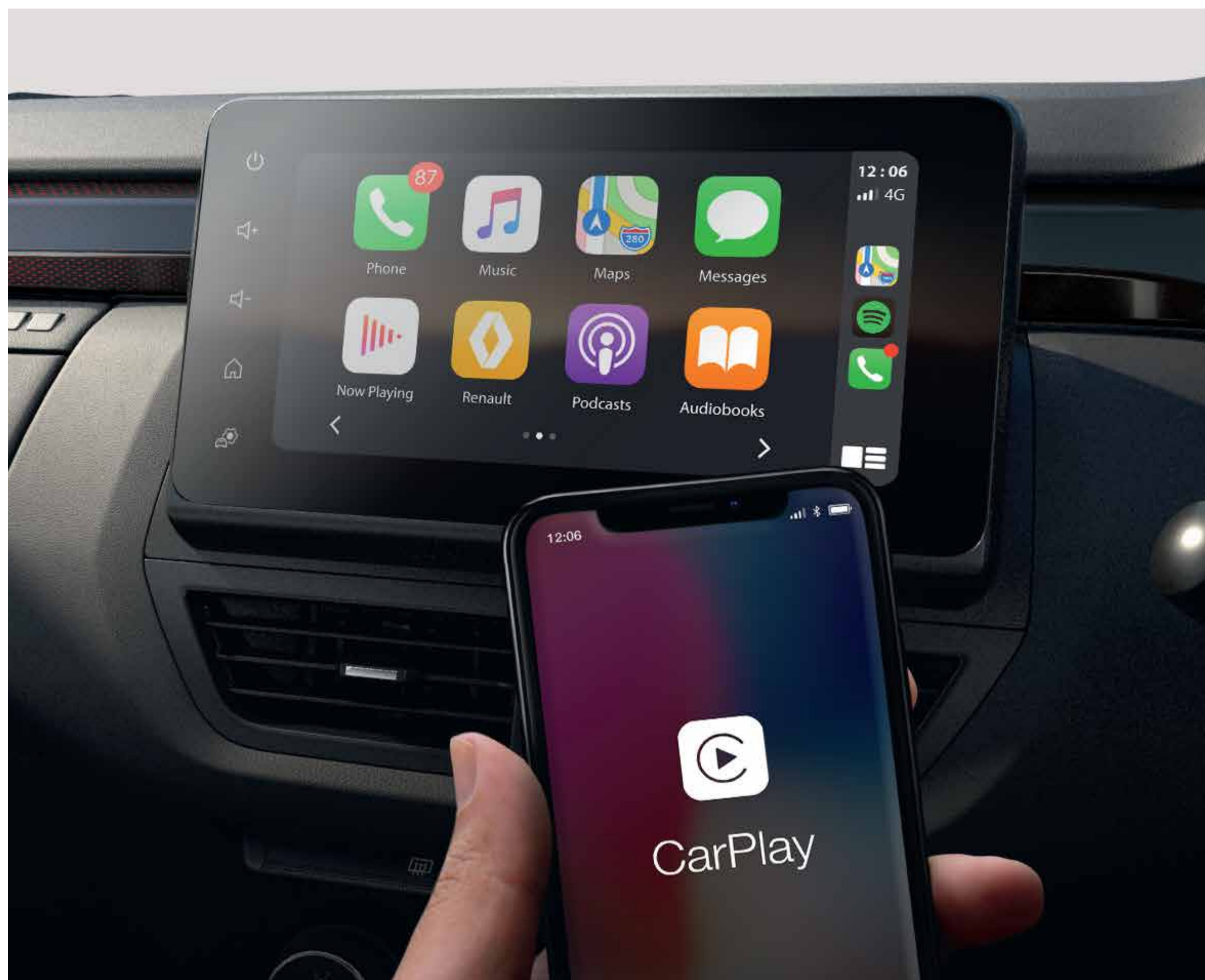
wireless smartphone replication