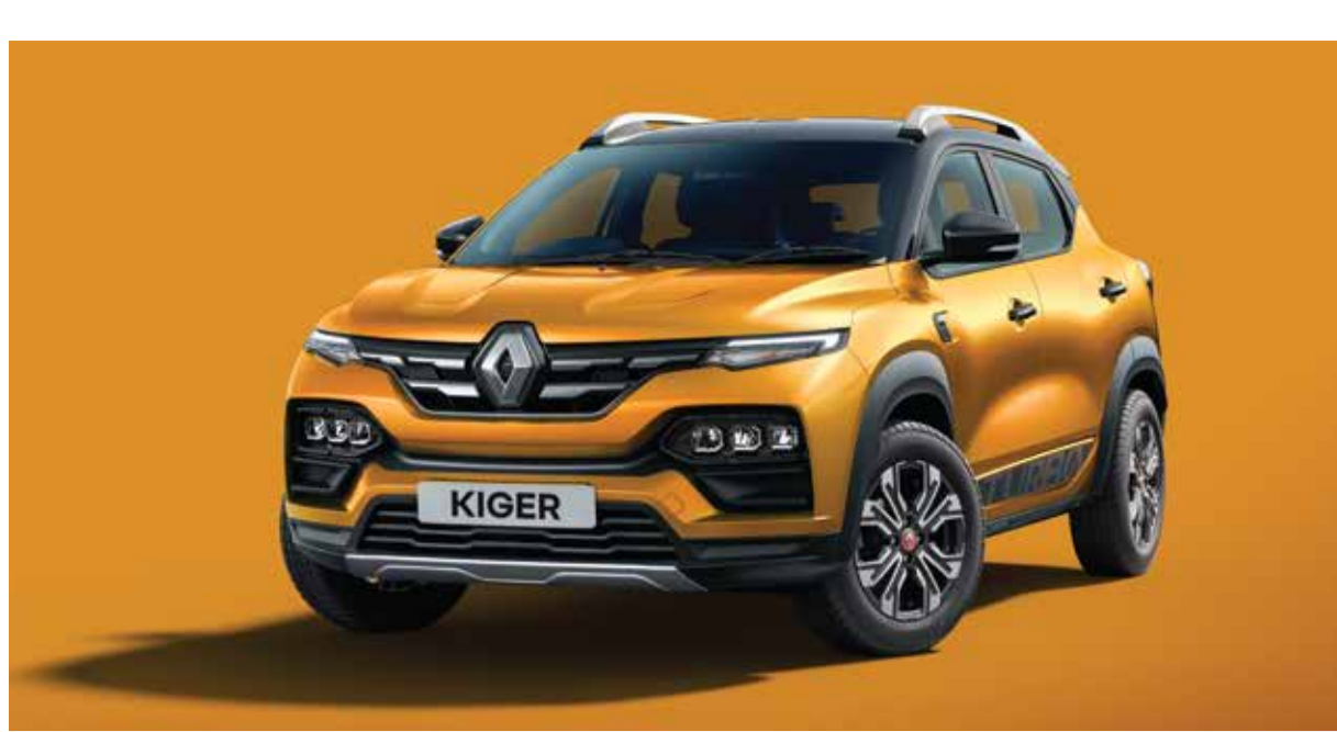
NEW METAL MUSTARD