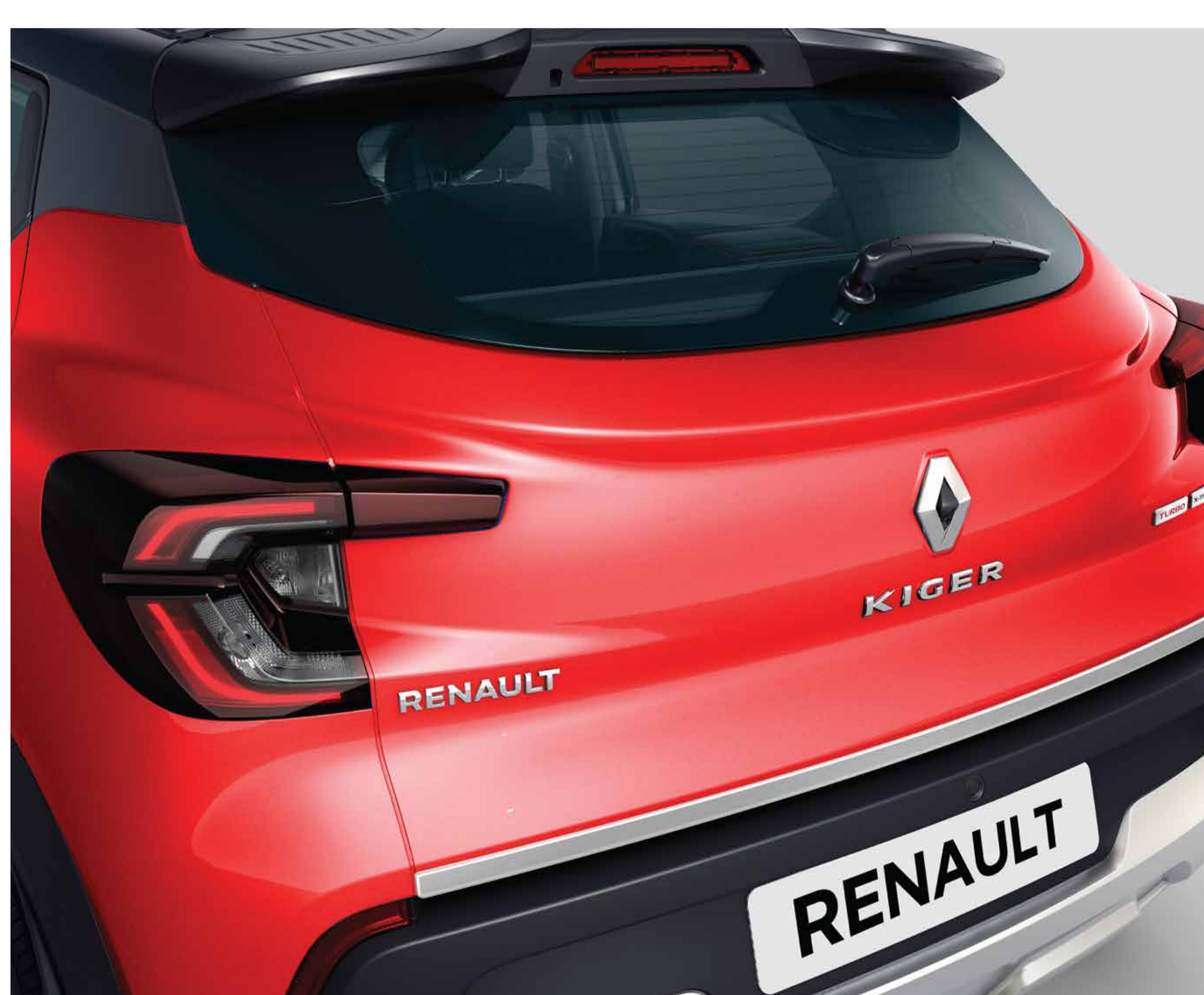
signature LED tail lamps