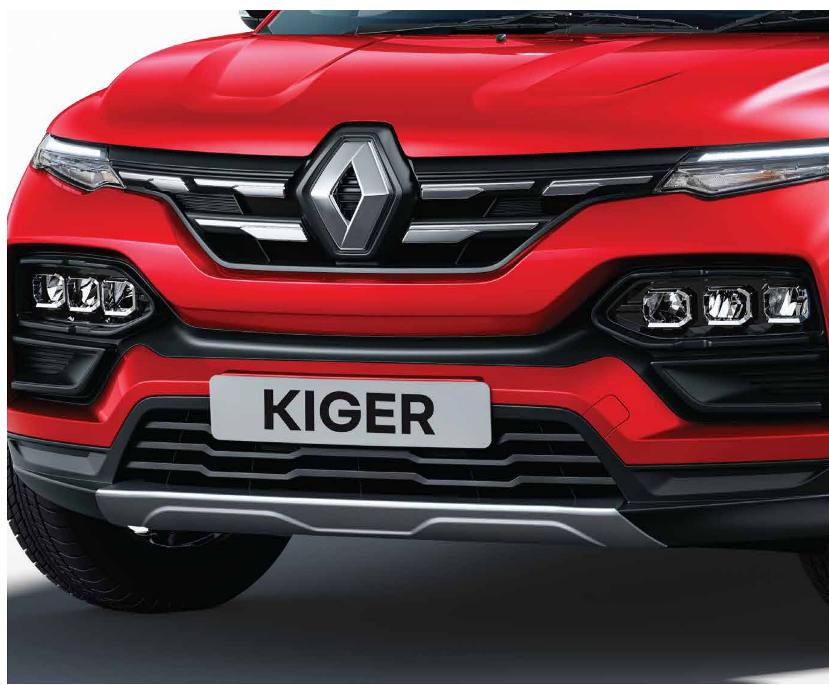
front skid plate

The KIGER's 40.64 cm diamond cut alloys, front and rear skid plate and high ground clearance of 205 mm further add to its imposing stance.