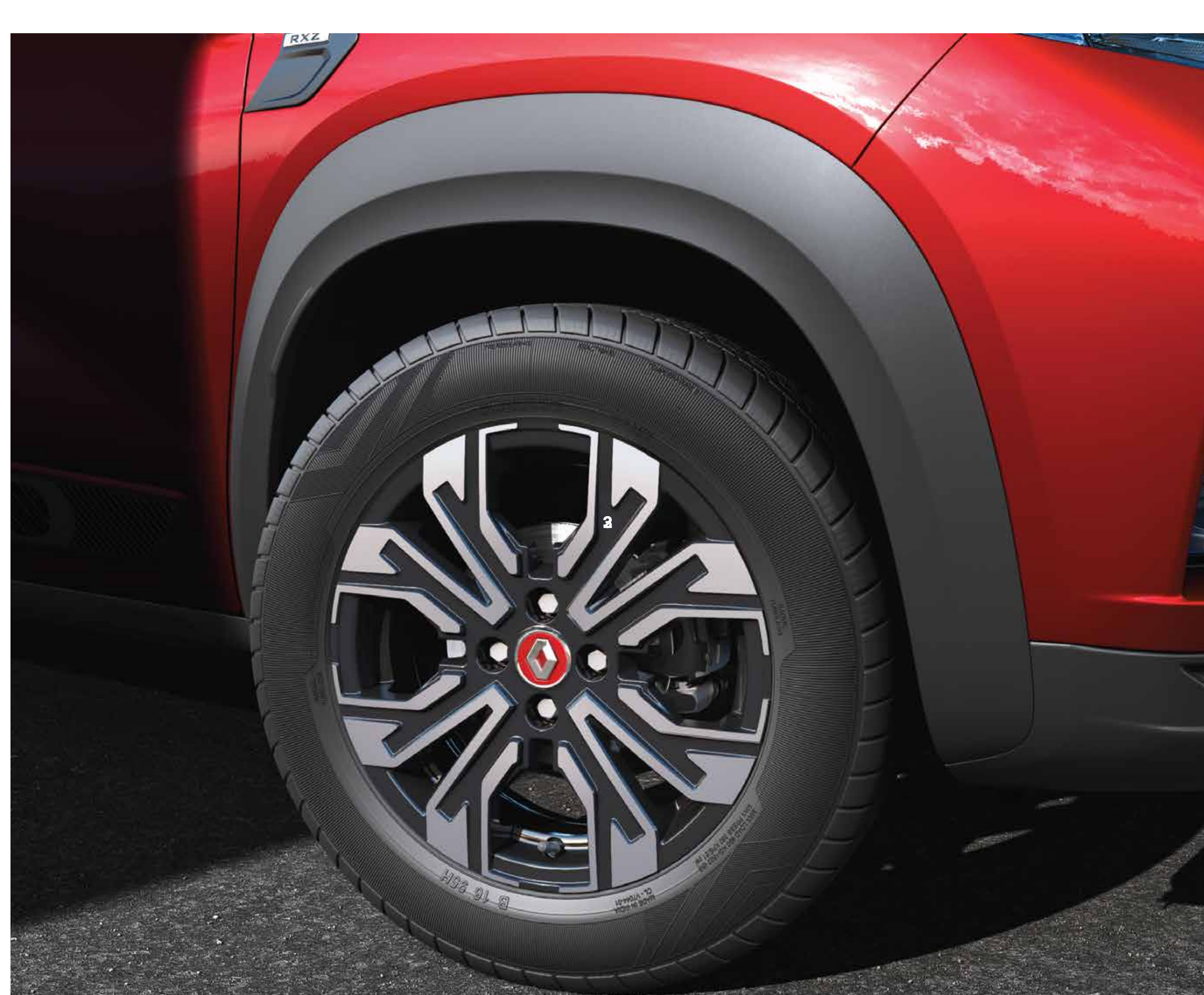
40.64 cm diamond cut alloys