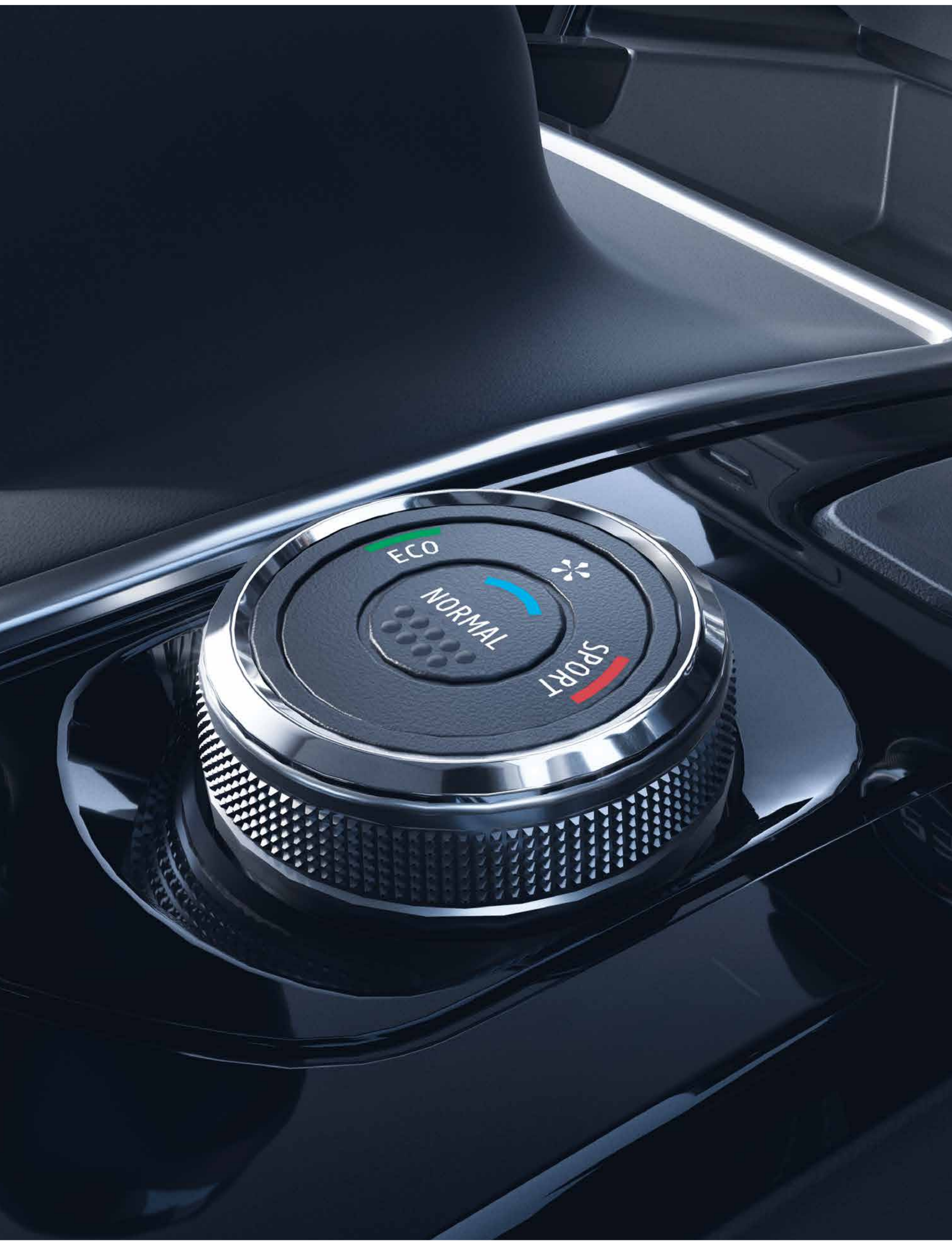
multi-sense drive modes

Go where your curiosity takes you. Zip through different experiences with the new turbo-charged petrol engine. The car gives you the best of both – performance and fuel efficiency with multi-sense drive modes that work in tandem with 17.78 cm reconfigurable TFT cluster.