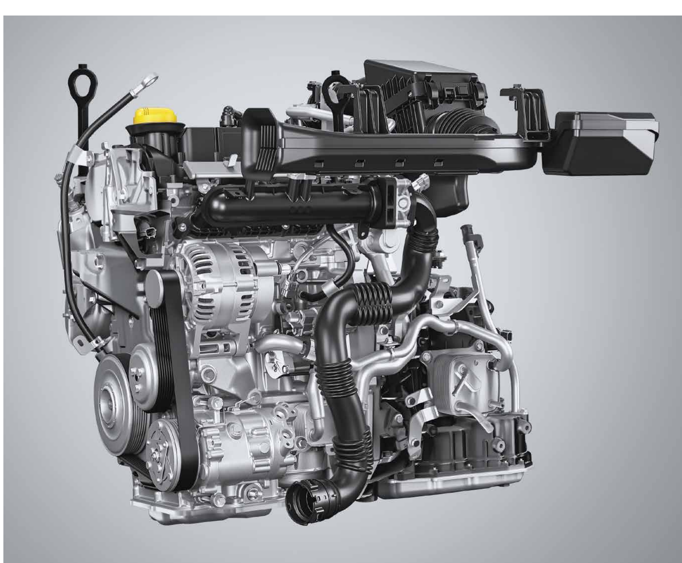
1.0L turbo-charged engine