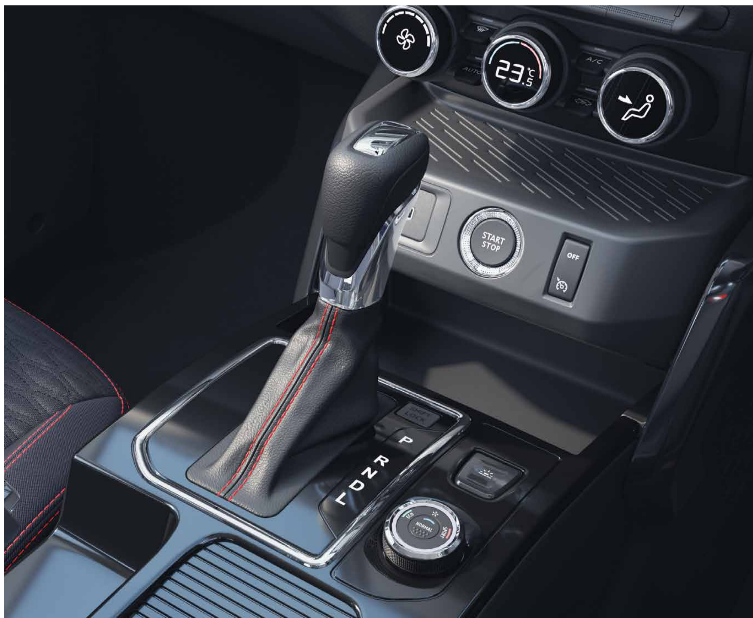
X-TRONIC CVT transmission