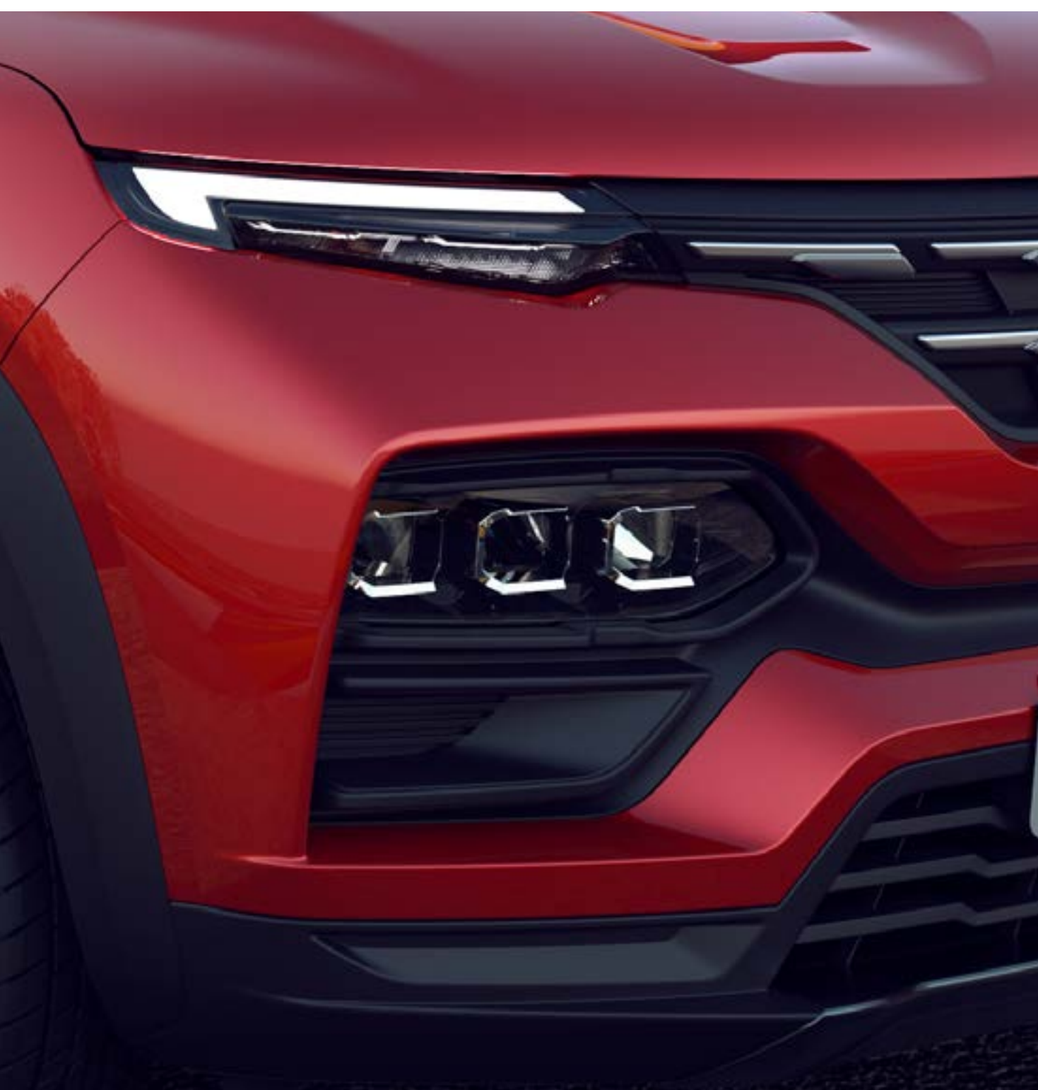
tri-octa LED pure vision headlamps

The finest details, like the chrome front grille, 40.64 cm diamond cut alloy wheels, sporty red calipers, rear spoiler, and LED headlamps with LED DRLs, reflect the SUV's cohesive design philosophy.