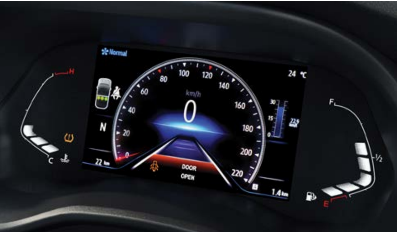
rear seat belt reminder Designed to alert the rear seat passengers to buckle up for a safe drive.