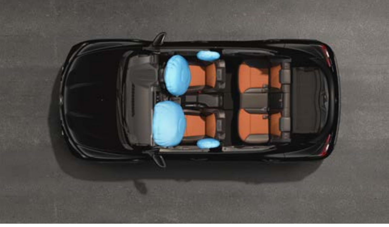
front & side airbag - driver & passenger 1 Four airbags 1 offer increased protection.