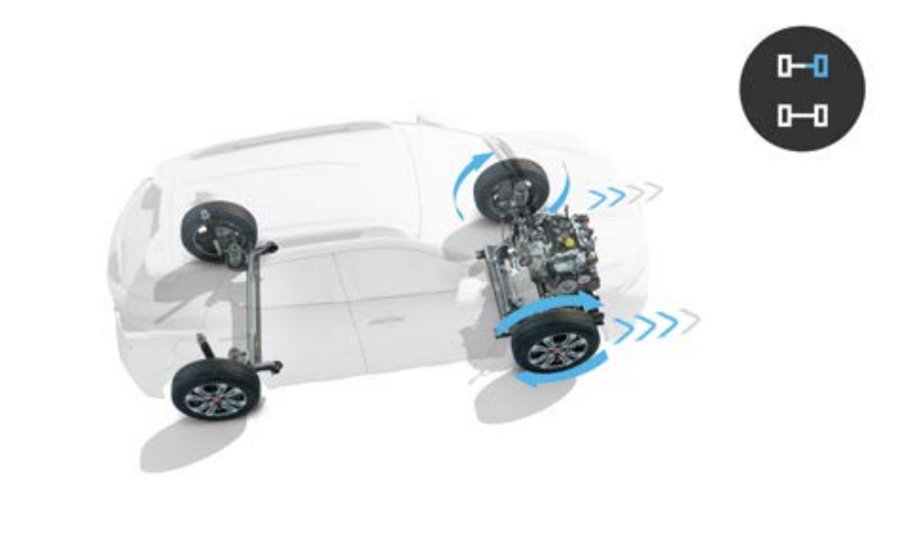
traction control system Limits wheel slip during starting, acceleration and braking.