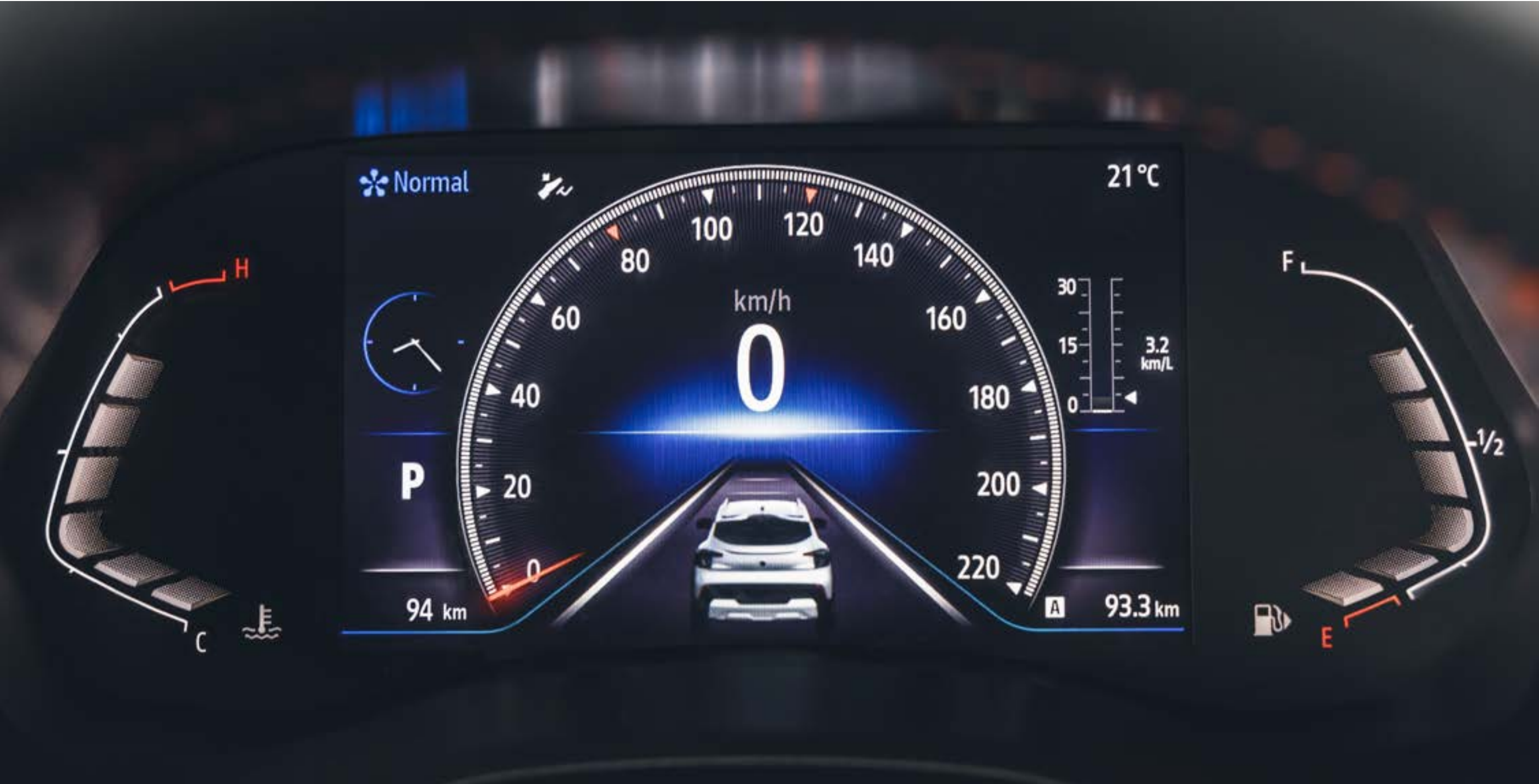
17.78 cm reconfigurable TFT cluster

Take control of your adventures, be it in the city or out on the highway. Cruise in the normal mode, switch to the fuel-efficient, eco mode or enjoy dynamic driving with sport mode.