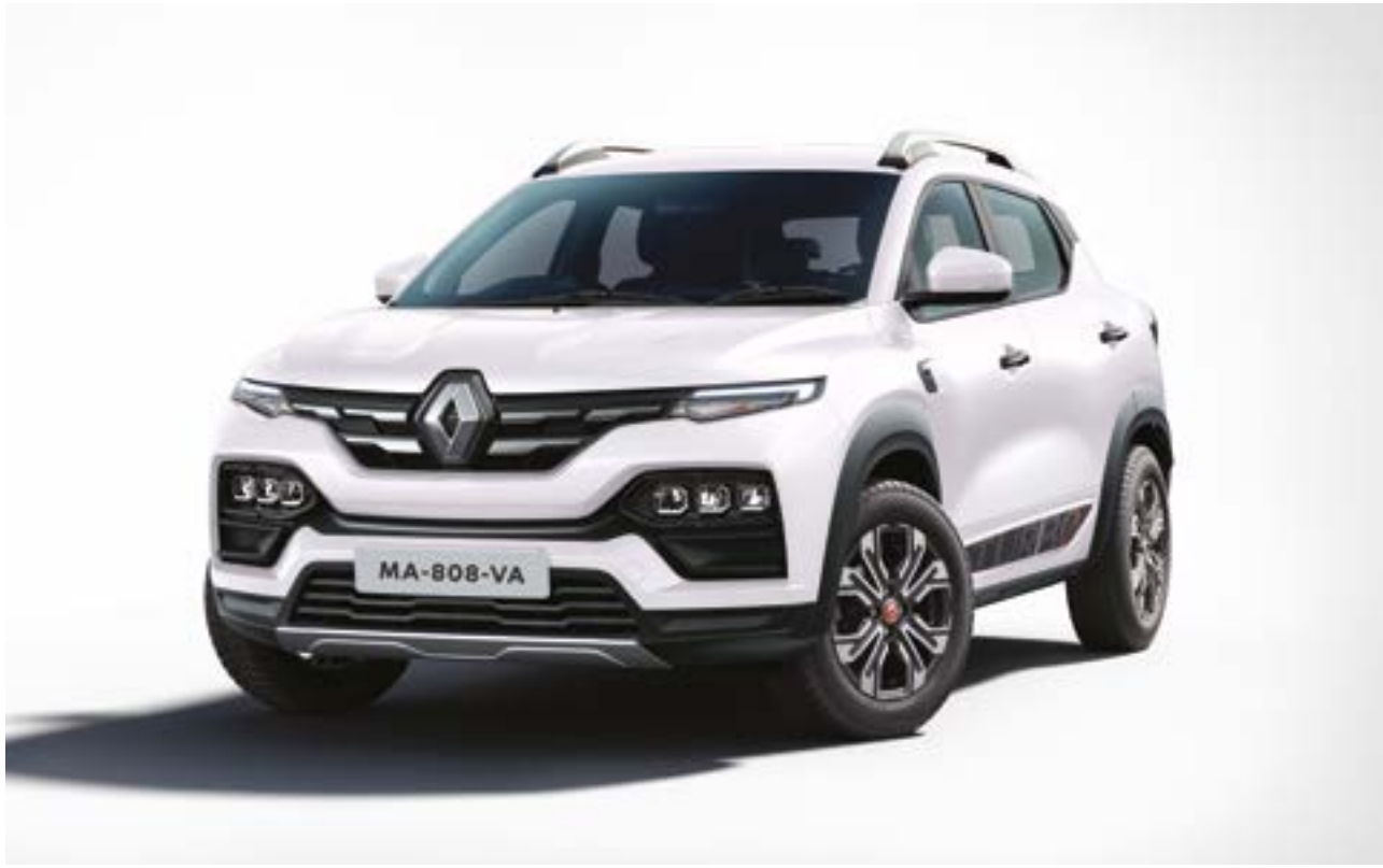
ice cool white