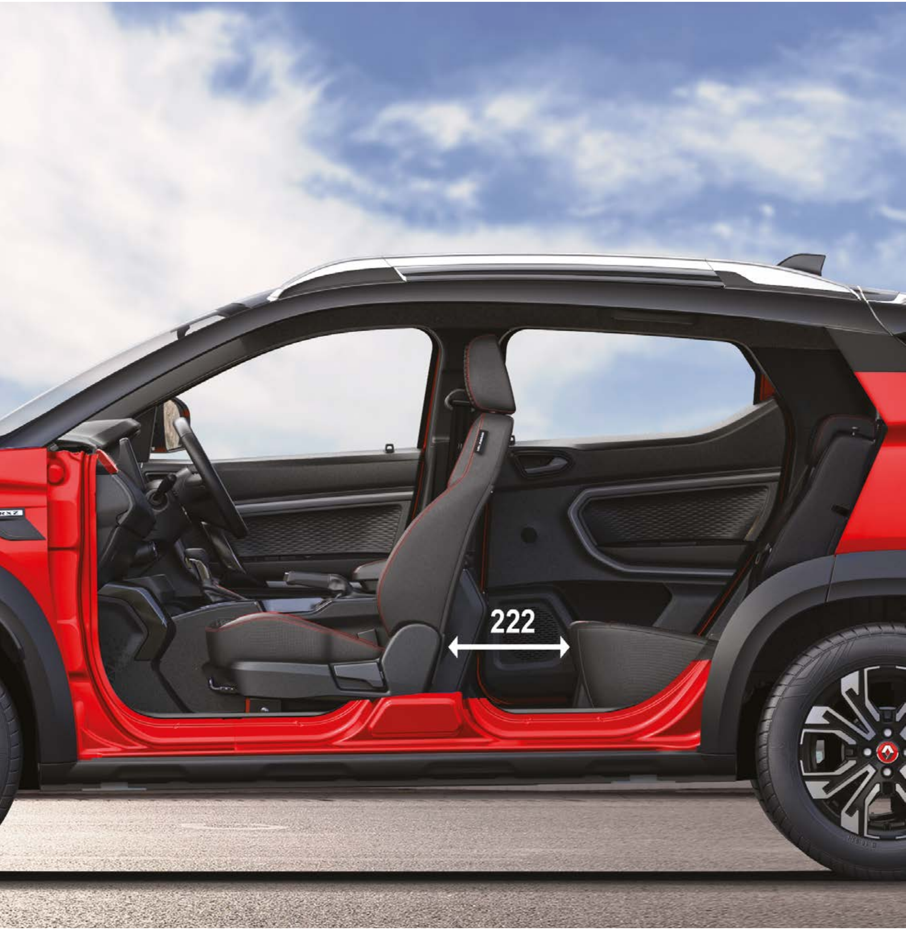
rear knee room of 222 mm

From its premium, modern upholstery to its spacious cabin, everything about Renault Kiger spells comfort. Settle in comfortably and enjoy every drive.