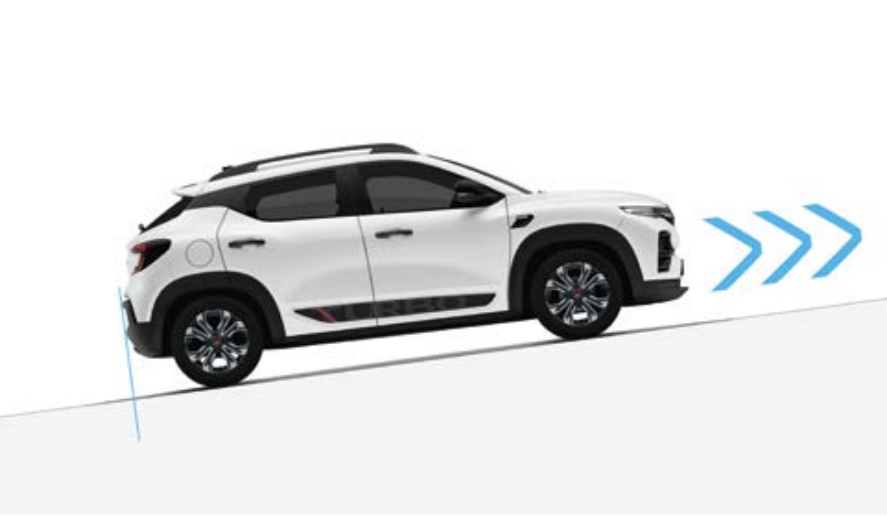
hill start assist Maintains brake pressure for two seconds, preventing rollback when you move away on a steep slope.