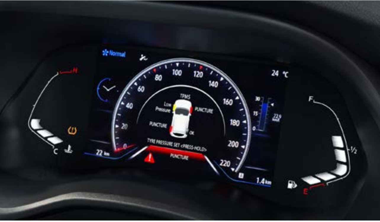
tyre pressure monitoring system Displays the tyre pressure status in real-time.