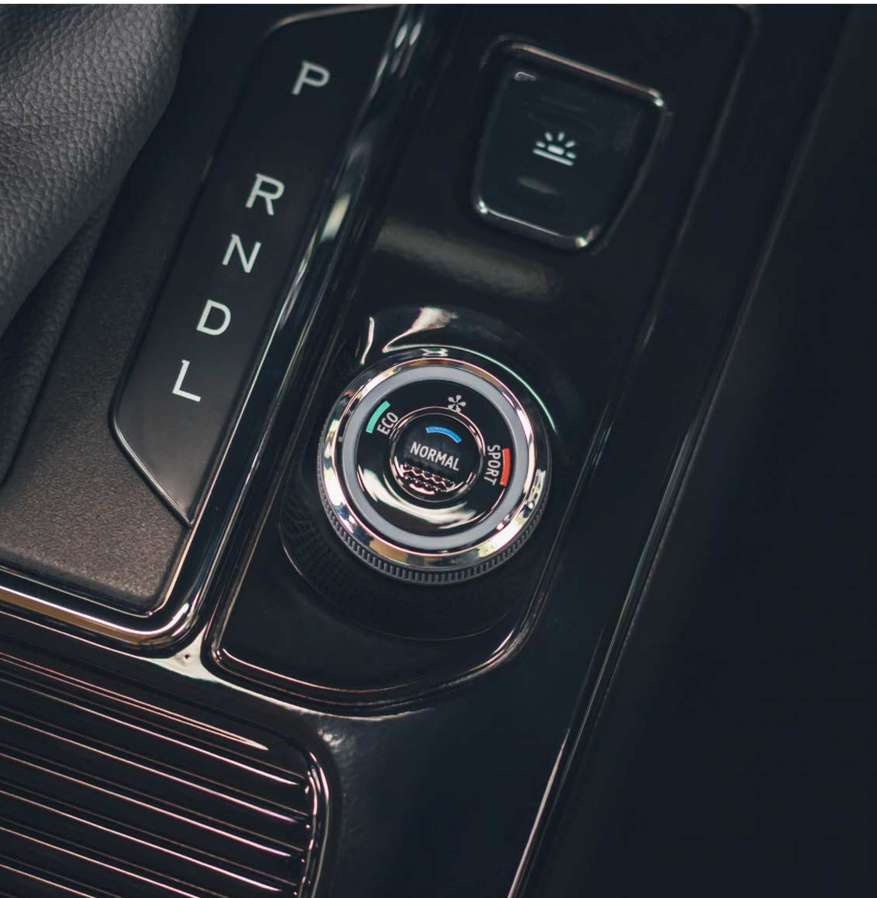
multi-sense drive modes

Experience a host of responsive features designed for a bold SUV. With a turbo-charged engine under the hood and an effortless driving experience enhanced by multi-sense drive modes, Renault Kiger truly combines the best of performance and efficiency.