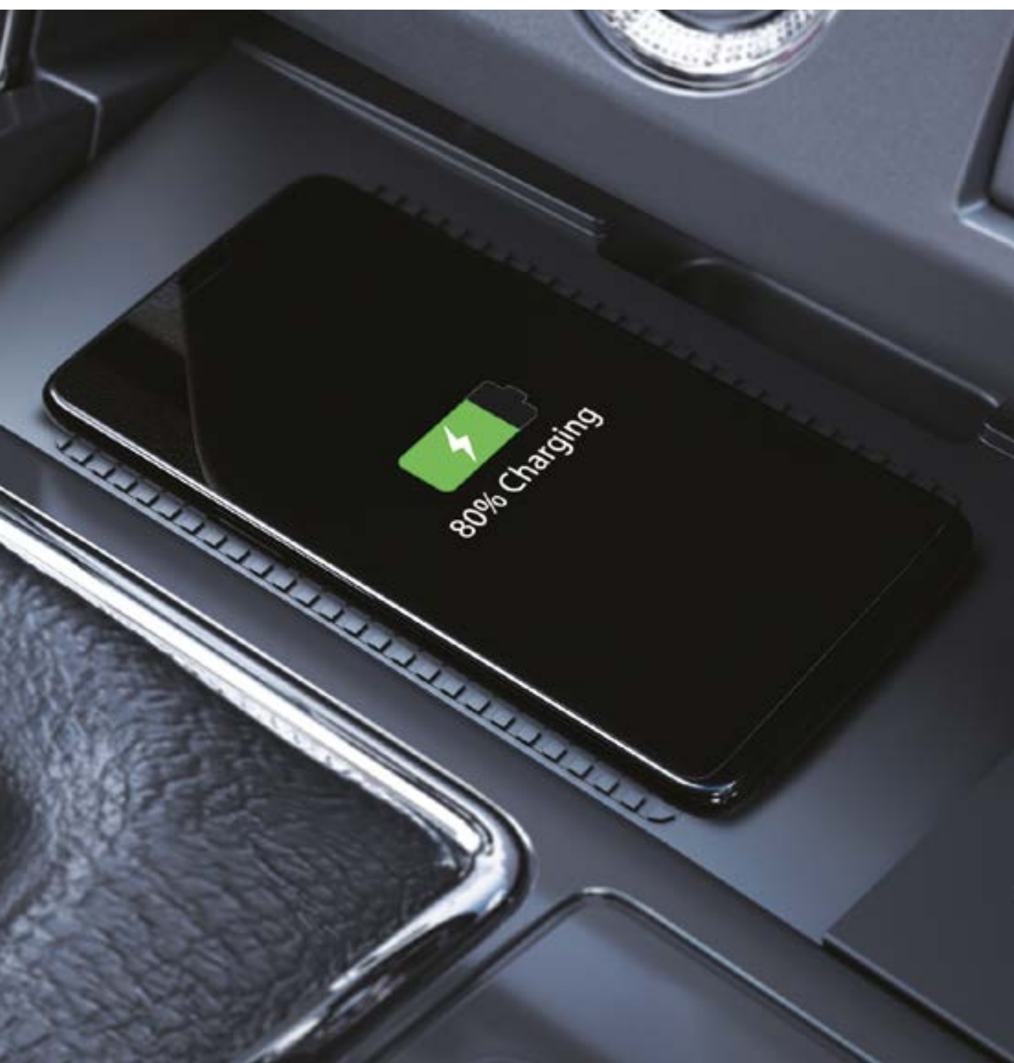
wireless smartphone charger

Begin your journey with a push of the start button. Seamlessly link your smartphone to the 20.32 cm floating touchscreen via wireless replication, all while it charges wirelessly. Elevate your comfort with the take-a-break reminder, which prompts you to pause for refreshing stops on long drives.