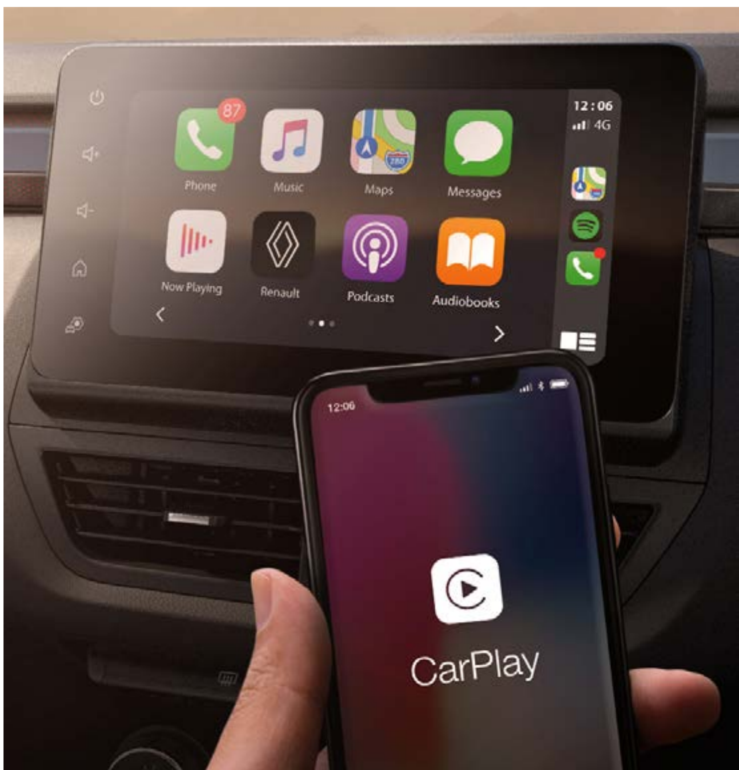
wireless smartphone replication with Android Auto™ and Apple CarPlay™