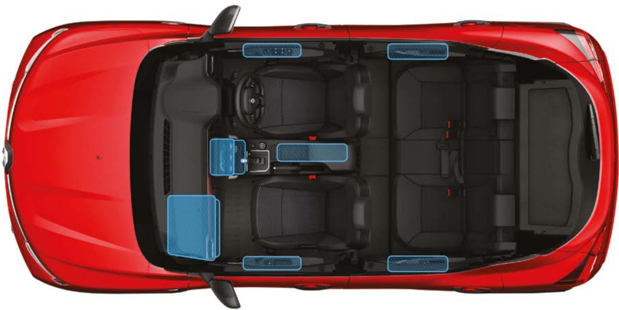
total cabin storage volume of 29-litres

Discover the practical side of Renault Kiger. This SUV comes with a generous 405-litre boot space and ample cabin storage for you to house all your essentials easily.