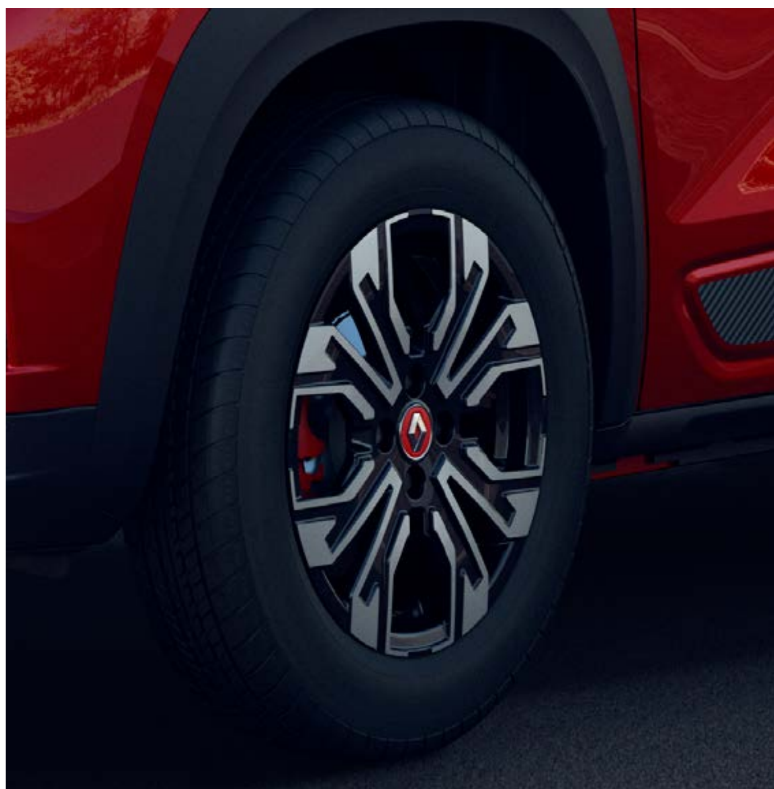
40.64 cm diamond cut alloy wheels