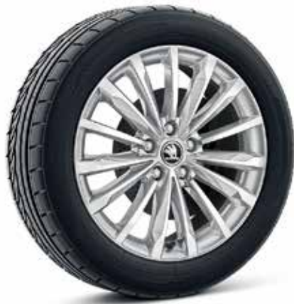
18" ELBRUS Alloy Wheels