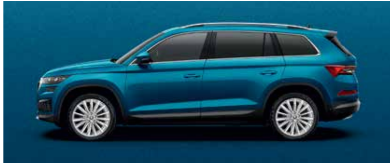
Lava Blue Metallic