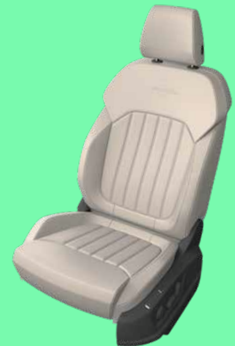
Stone Beige Leather Seats