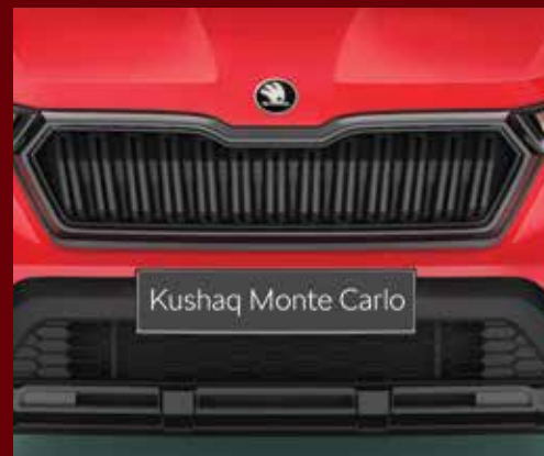
»» Škoda Signature Grille with Glossy Black Surround