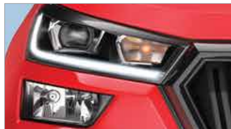
» LED Headlamps with DRLs