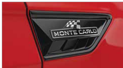
» Exclusive Monte Carlo Badging