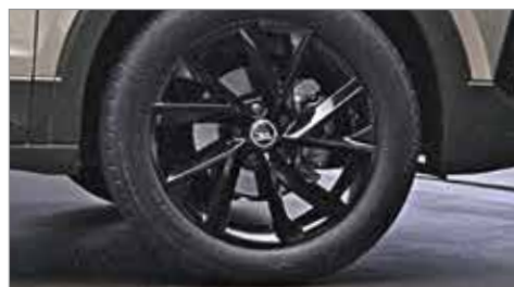
» R17 Black Alloy Wheels