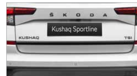
» Sporty Black Exterior Accents