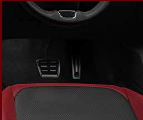
»» Alu Pedals