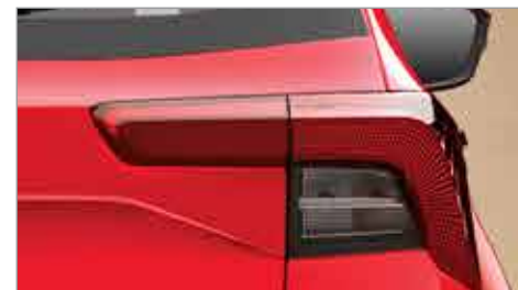
» LED Tail Lamps