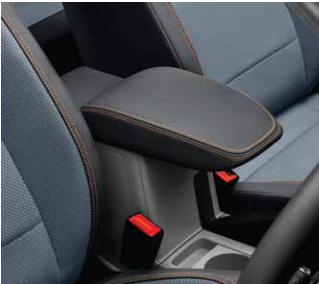
Storage In Front Centre Armrest