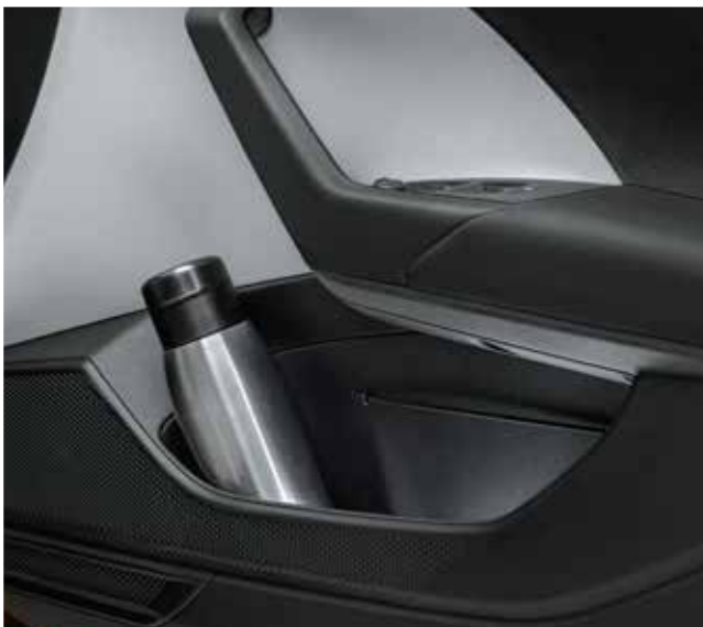
Storage In the Front and Rear Doors