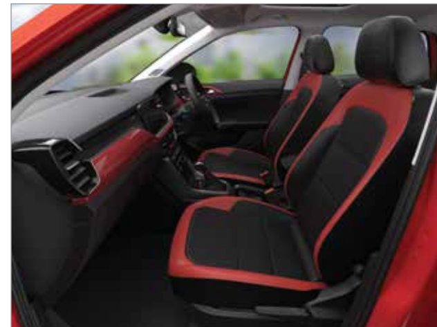
»» Monte Carlo Inscribed Ventilated and Electric Front Leatherette Seats