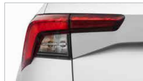
» LED Tail Lamps