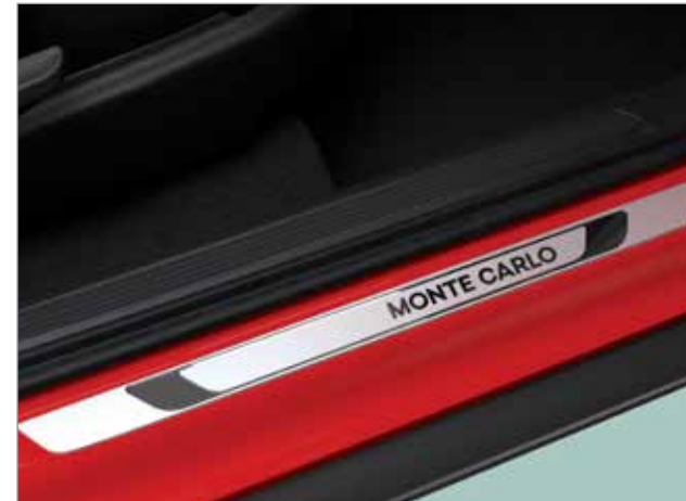
»» Monte Carlo Inscribed Front Scuff plates