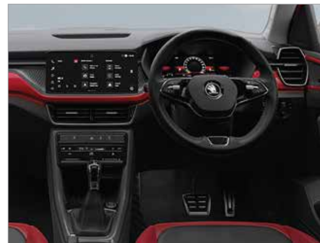
»» 20.32 cm Škoda Virtual Cockpit with Red Theme