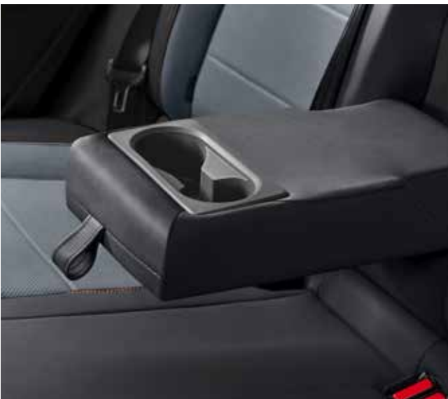
Cupholders In Armrest