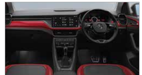
» Red Ambient Lighting with Ruby Red Metallic Décor