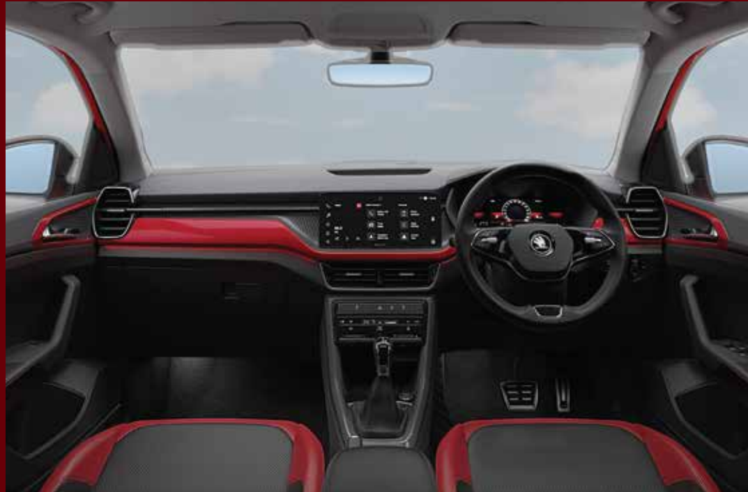
»» Dashboard with Dual tone Interior Décor with Ruby Red Metallic Inserts