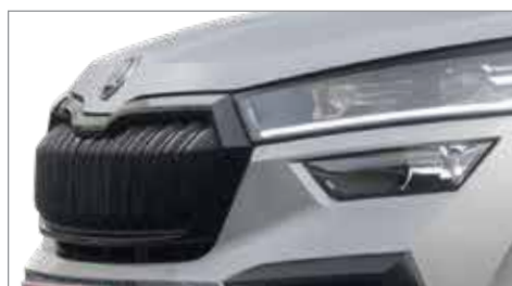
» ŠKODA Signature Grille with Glossy Black Surround