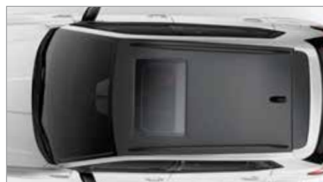
» Dual Tone Roof with Electric Sunroof