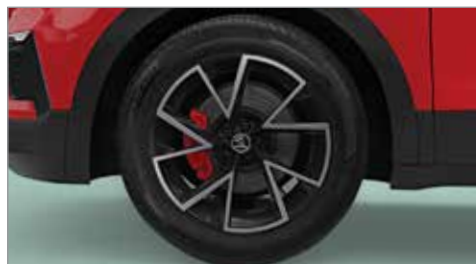
» R17 Dual Tone Alloy Wheels with Red Calipers