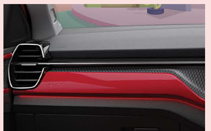
Red Ambient Lighting with Ruby Red Metallic Décor