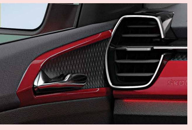
Front Door Handles with Ruby Red Metallic Décor