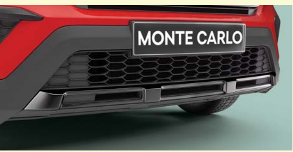
Glossy Black Front Diffuser