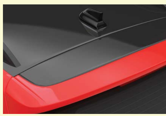
Dual-tone Tailgate Spoiler