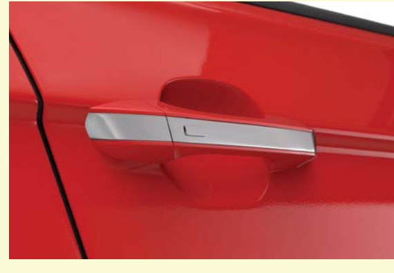
Dark Chrome Door Handles