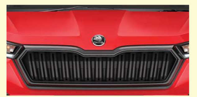
ŠKODA Signature Grille with Glossy Black Surround