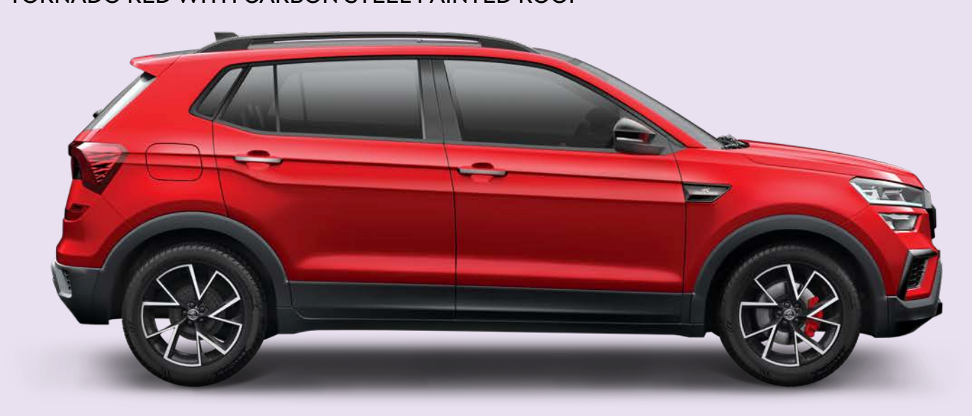
TORNADO RED WITH CARBON STEEL PAINTED ROOF