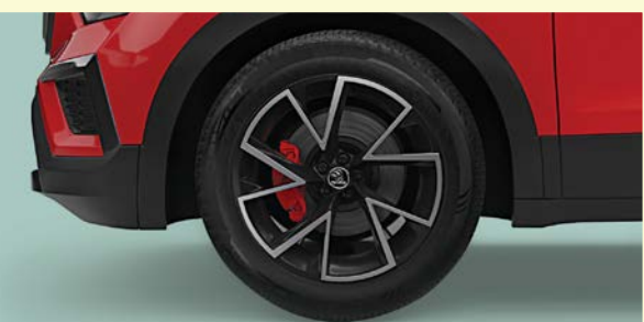
R17 Dual-tone VEGA Alloy Wheels With Red Brake Calipers*