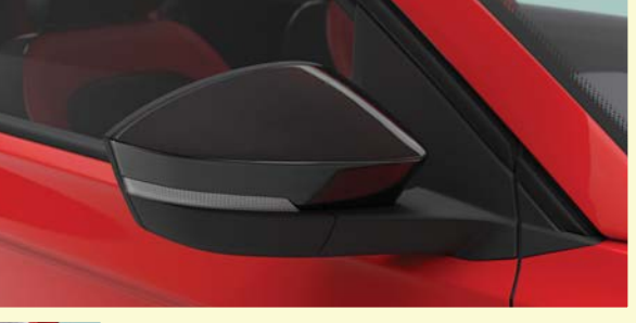
Glossy Black ORVMs