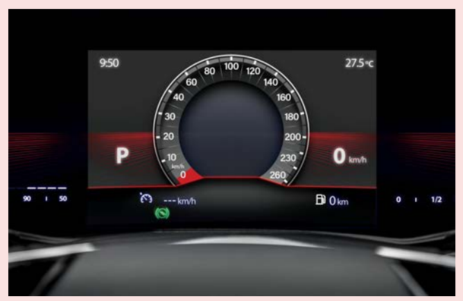
20.32cm ŠKODA Virtual Cockpit with Red Theme