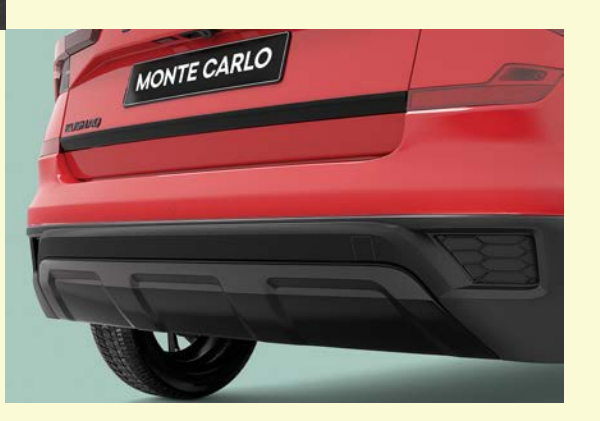
Glossy Black Rear Diffuser and Trunk Garnish