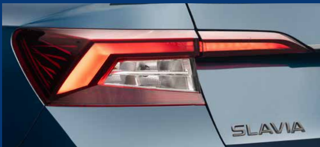
»» Darkened LED Tail Lamps