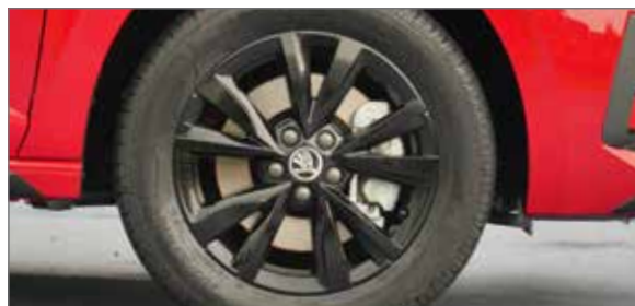
» R16 Black Alloy Wheels