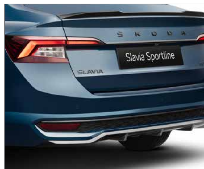
»» Sporty Black Exterior Package