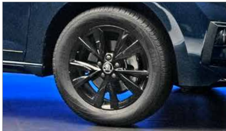
» R16 Black Alloy Wheels