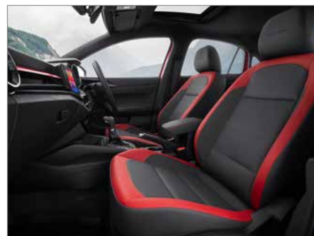
»» Monte Carlo Inscribed Ventilated and Electric Front Leatherette Seats