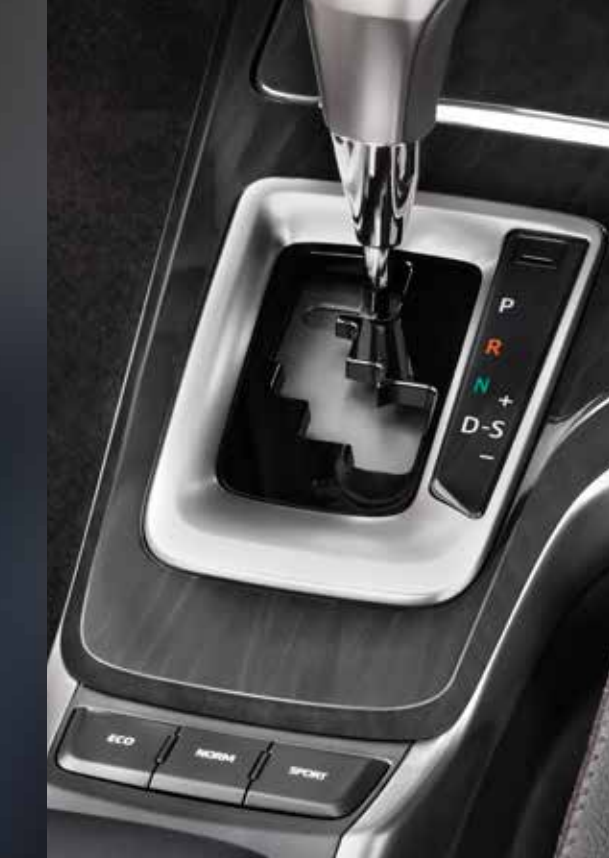
Interior Wood Trim Colour with Galaxy Black Ornamentation