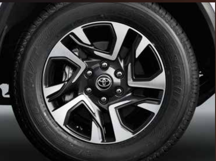
18" Multi-layered Machine Cut Alloy Wheels