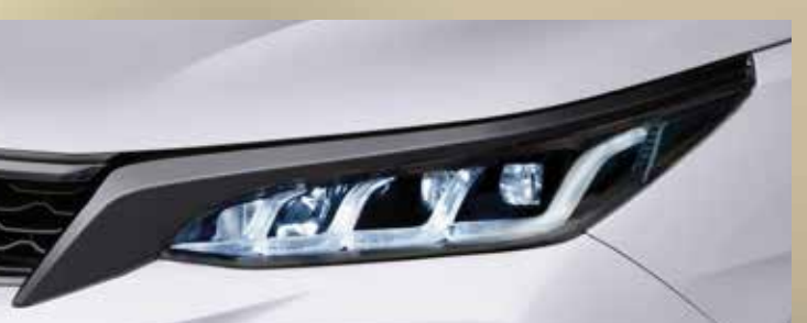
Split Quad LED with Waterfall LED Line Guide Signature