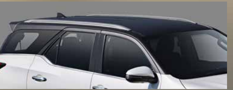
Dual Ione Black Roc