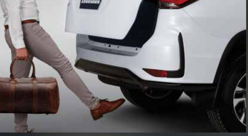
Kick Sensor for Power Back Door