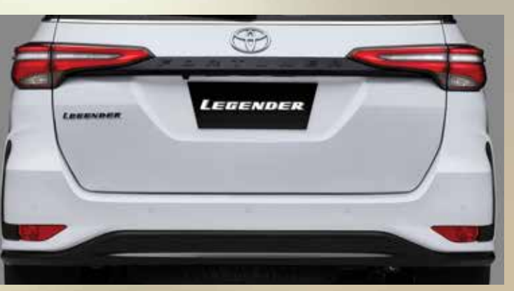
Rear Black Garnish & Catamaran Style Rear Bumper