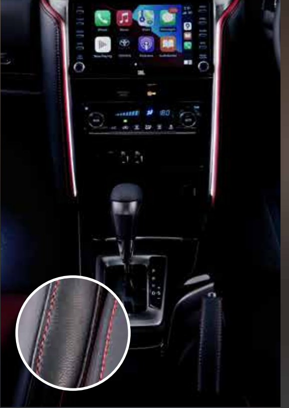
Interior Contrast Stitching on Console Box