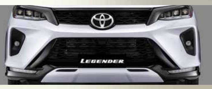
Sharp & Sleek Grille with Catamaran Style Front Bumper