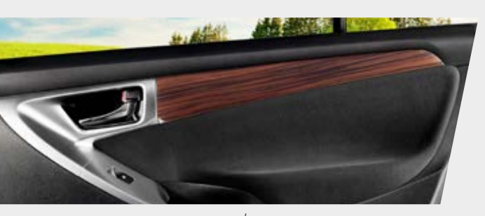
Wood Finish Interior Panels / Gives a premium and luxurious look

Foldable Seatback Table with Cup Holder / Keeps your knick knacks safetly when on the go