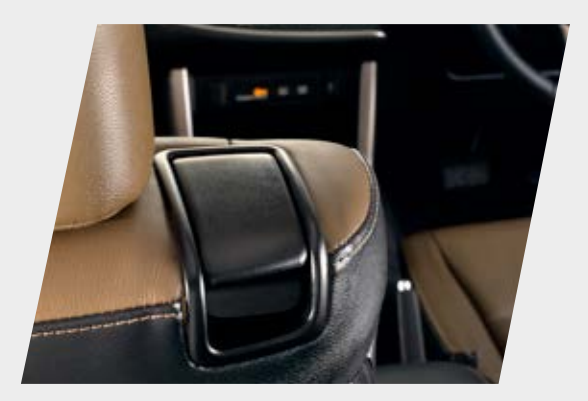
Easy Slide Front Passenger Seat Adjusts the rear legroom for more comfort