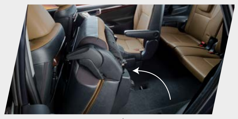
One-touch Tumble Second Row Seat / Gives you easy access to the third row seats

The interior of the new Innova Crysta is unequalled in its refinement and class. While the sheer amount of space will thrill you, the built-to-last quality will mesmerise you. Be it the choice of premium leather<sup>#</sup> seats, enhanced legroom or soft-touch materials, the new Innova Crysta spells unparalleled comfort. So whether it's a long journey or a short trip, it gives you the calm and composure needed for you to arrive in style and confidence at your destination.