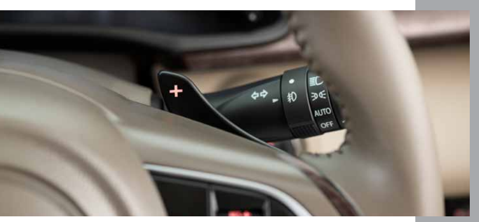
PADDLE SHIFTERS FOR BETTER PERFORMANCE

*Disclaimer: Fuel Efficiency as Certified by Test Agency under Rule 115 of CMVR, 1989 under standard Test Conditions, Actual Mileage on Road may vary.