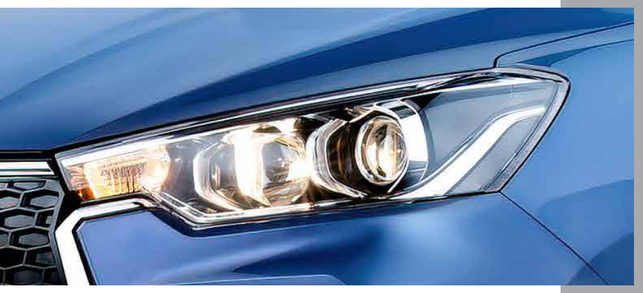
AUTO HEADLAMP Featuring follow me home function