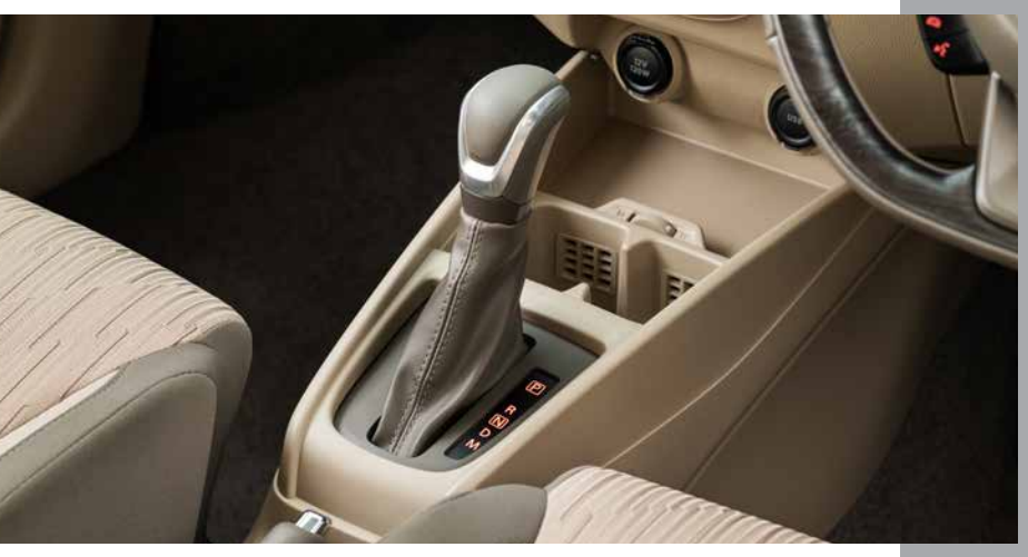
6-SPEED AUTOMATIC TRANSMISSION