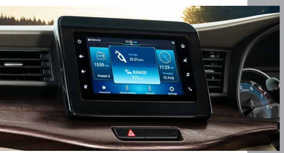
17.78 cm SMARTPLAYCAST AUDIO Display audio with wireless Android Auto and Apple CarPlay

SMARTPHONE CONNECTIVITY* Remote immobilisation | Tow alert | Remote start/stop