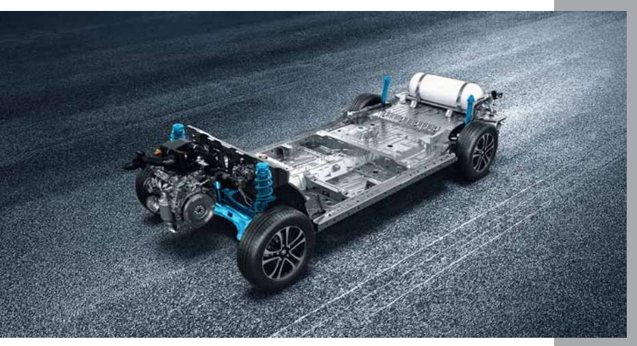
POWERFUL 1.5L (0.001462 m<sup>3</sup>) K SERIES ENGINE E-CNG technology for CNG grade | Fuel-efficiency of 26.11 km/kg* for CNG grade