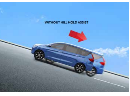
HILL HOLD ASSIST