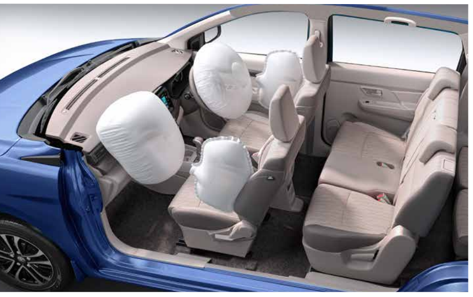
DUAL FRONT AIRBAGS AND SEAT SIDE AIRBAGS FOR ENHANCED SAFETY

The Rumion comes loaded with safety features to keep you safe all the time, allowing you to enjoy the good vibes of peace of mind.