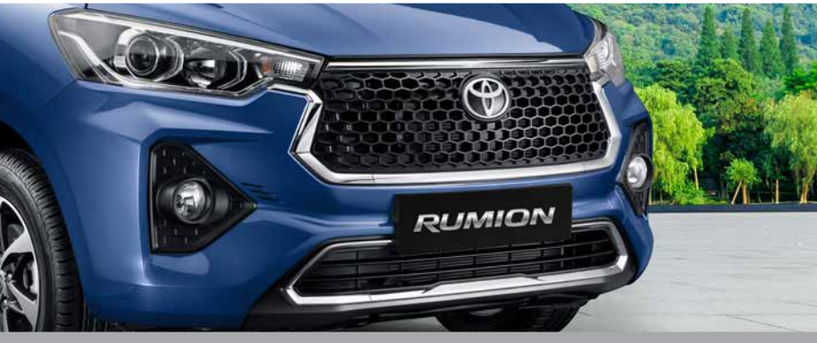
PREMIUM GRILLE WITH CHROME FINISH ON THE FRONT BUMPER

Everything about the Rumion is designed to exude stylish vibes. Take for instance its premium front grille with chrome finish bumper. So no matter where you go, you are always upbeat and full of cheer.