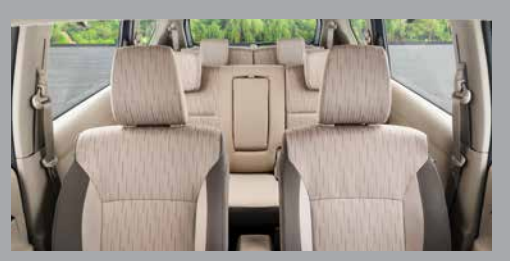
7 SEATER WITH PLUSH DUAL TONE SEAT FABRIC