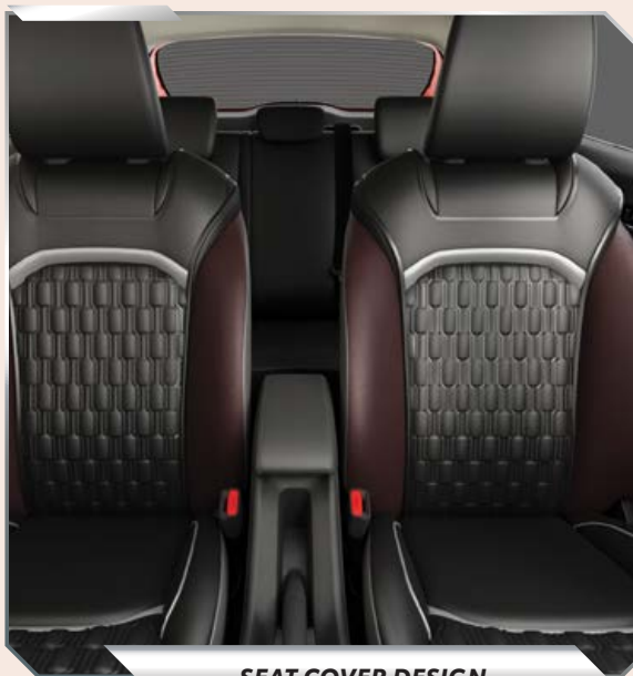
SEAT COVER DESIGN