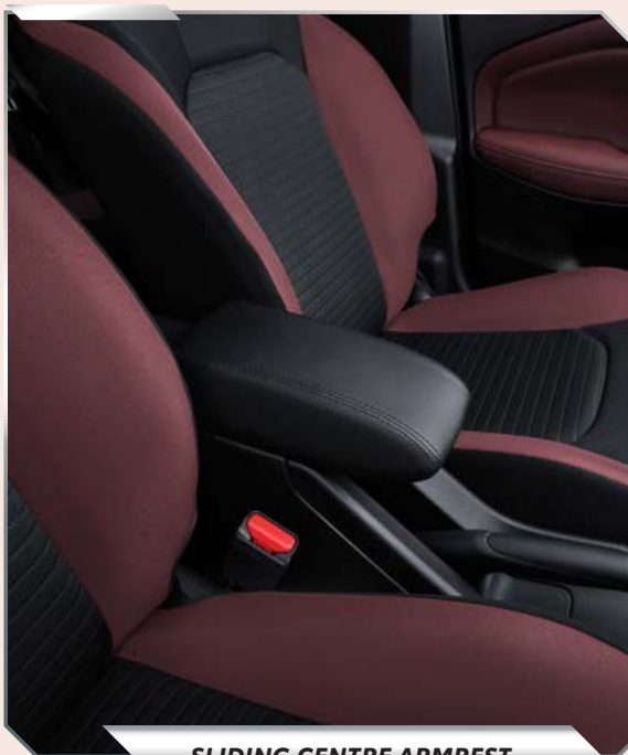
SLIDING CENTRE ARMREST