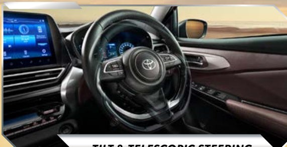
TILT & TELESCOPIC STEERING