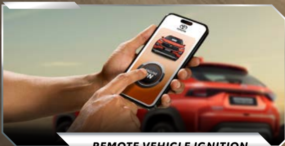
REMOTE VEHICLE IGNITION