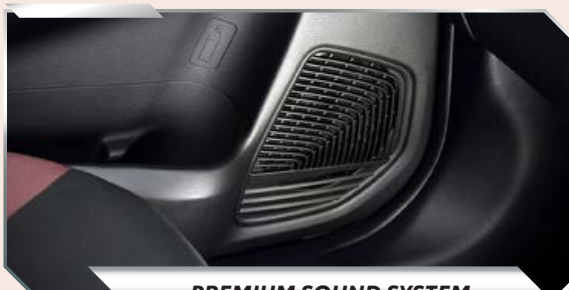
PREMIUM SOUND SYSTEM