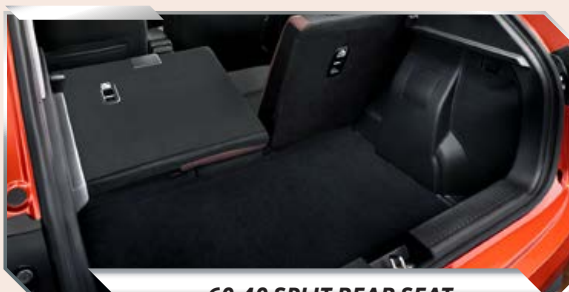
60:40 SPLIT REAR SEAT