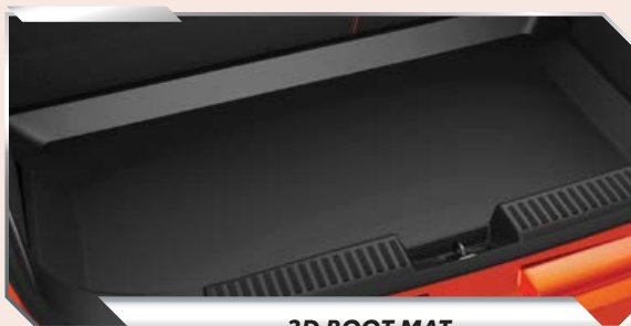
3D BOOT MAT