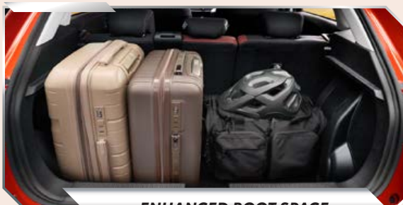
ENHANCED BOOT SPACE