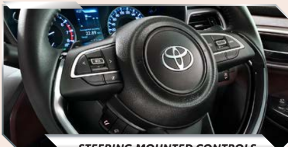
STEERING MOUNTED CONTROLS