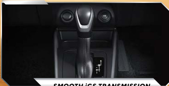
SMOOTH iGS TRANSMISSION