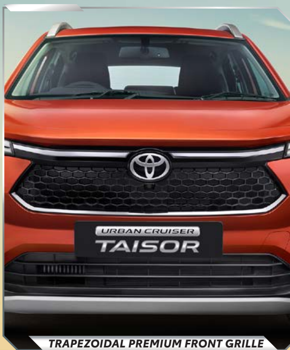
TRAPEZOIDAL PREMIUM FRONT GRILLE WITH CHROME GARNISH