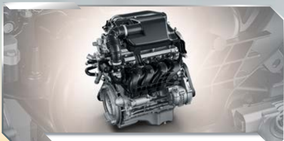
EXCITING 1.2L PETROL ENGINE