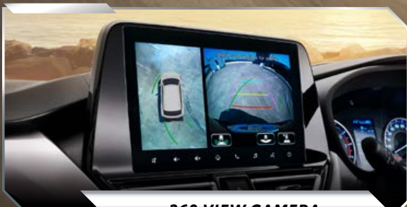
360 VIEW CAMERA