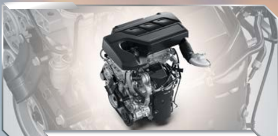
POWERFUL 1.0L TURBO ENGINE