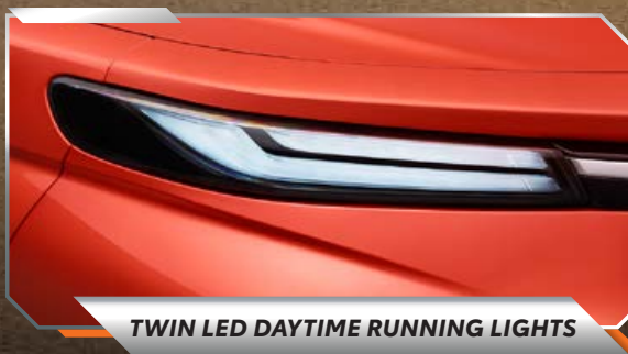
TWIN LED DAYTIME RUNNING LIGHTS