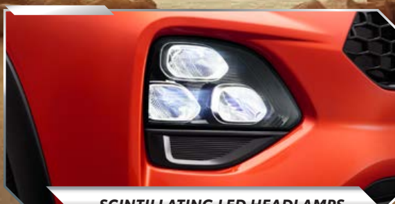
SCINTILLATING LED HEADLAMPS