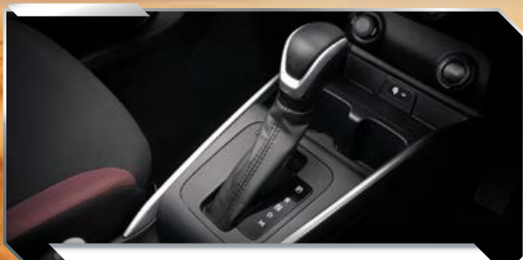
SLICK 6 SPEED AUTO TRANSMISSION