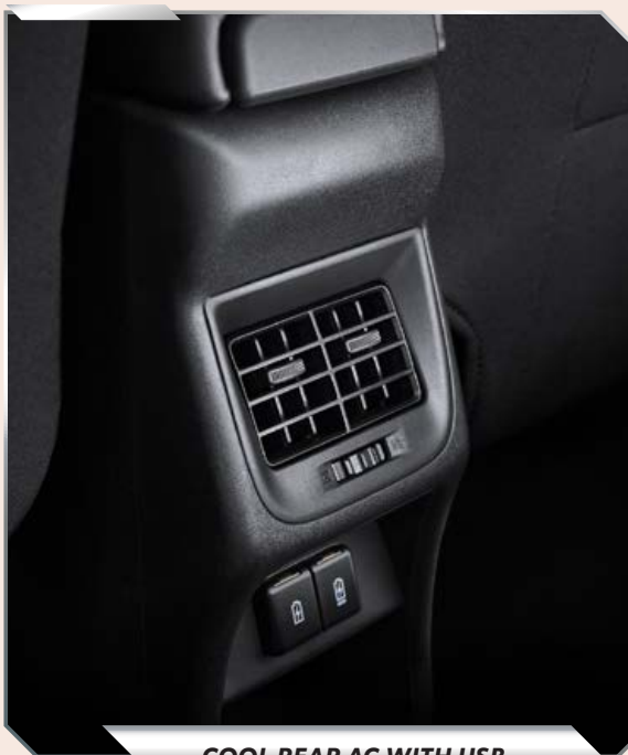
COOL REAR AC WITH USB