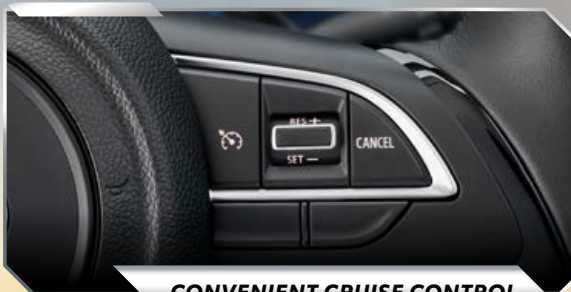
CONVENIENT CRUISE CONTROL