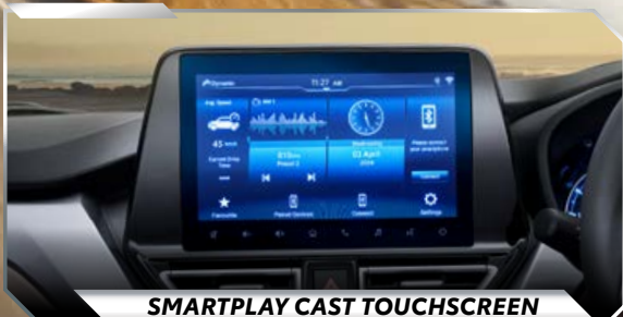
SMARTPLAY CAST TOUCHSCREEN INFOTAINMENT SYSTEM